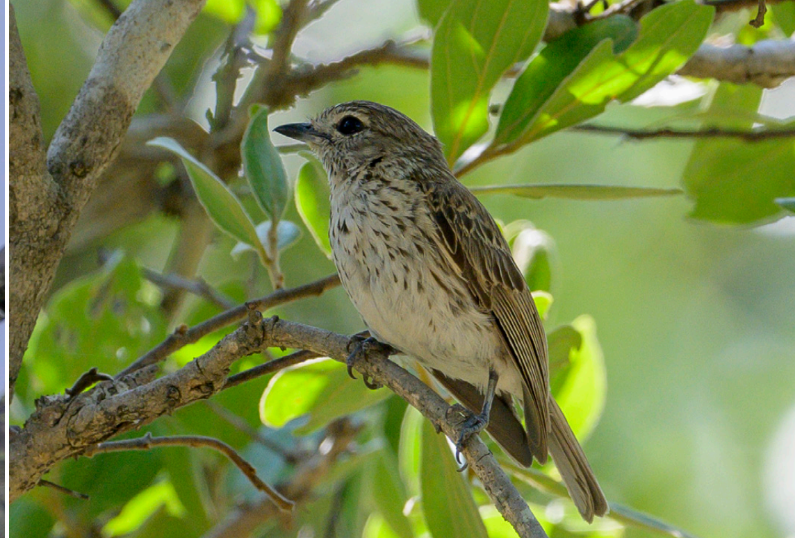
Bohm's Flycatcher and Bushveld Pipit © Michael Mills