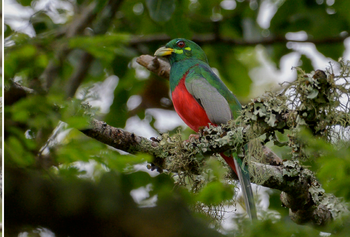
Narina Trogon and Olive Long-tailed Cuckoo