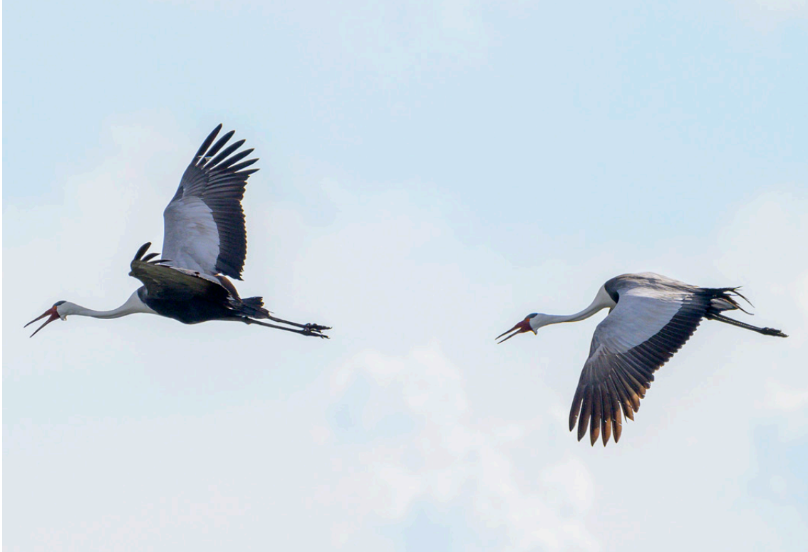
Wattled Crane and Whyte's Francolin