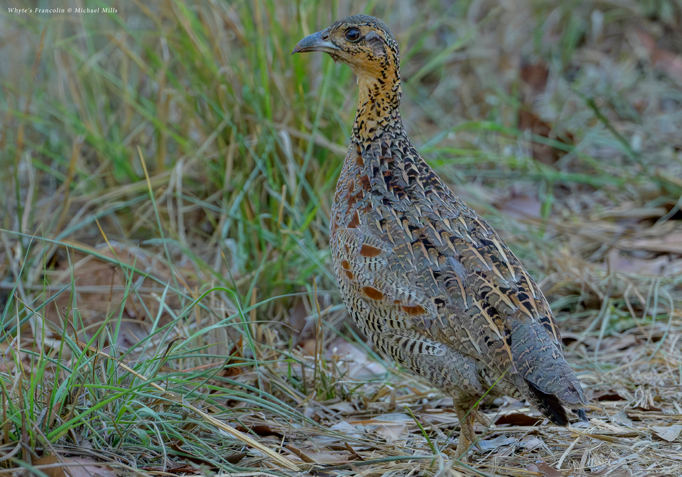
Whyte's Francolin