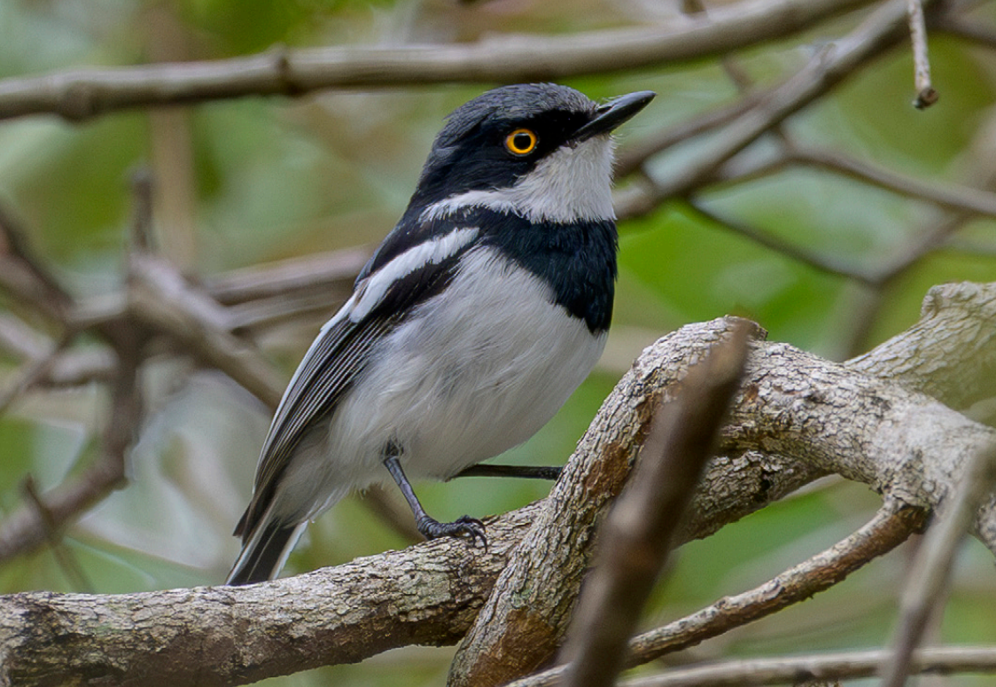
Margaret's Batis and Miombo Pied Barbet