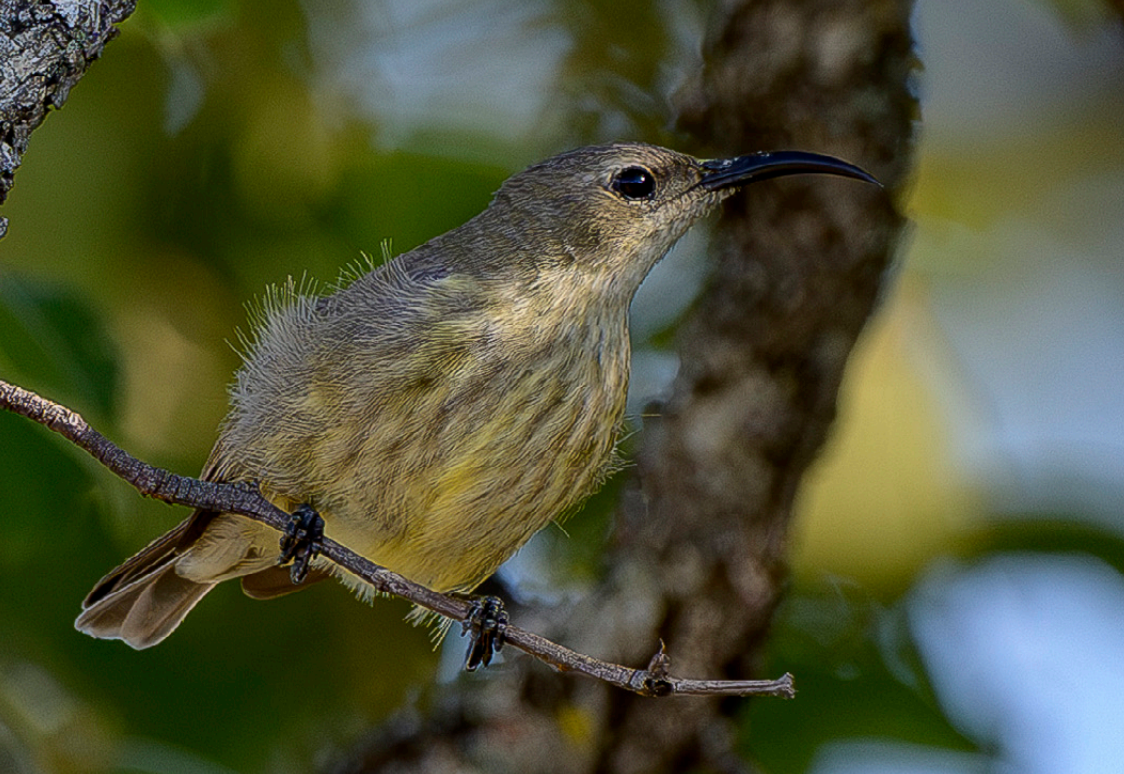
Shelley's Sunbird (female and male)