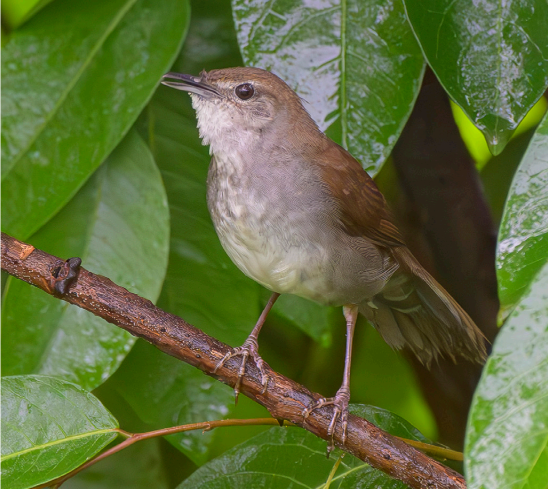
Bamboo Warbler