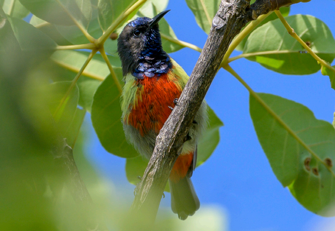
Anchieta's Sunbird, Angola Lark and Southern Carmine Bee-eater