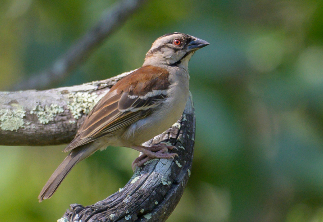
Chestnut-backed Sparrow-Weaver and Cuckoo-finch