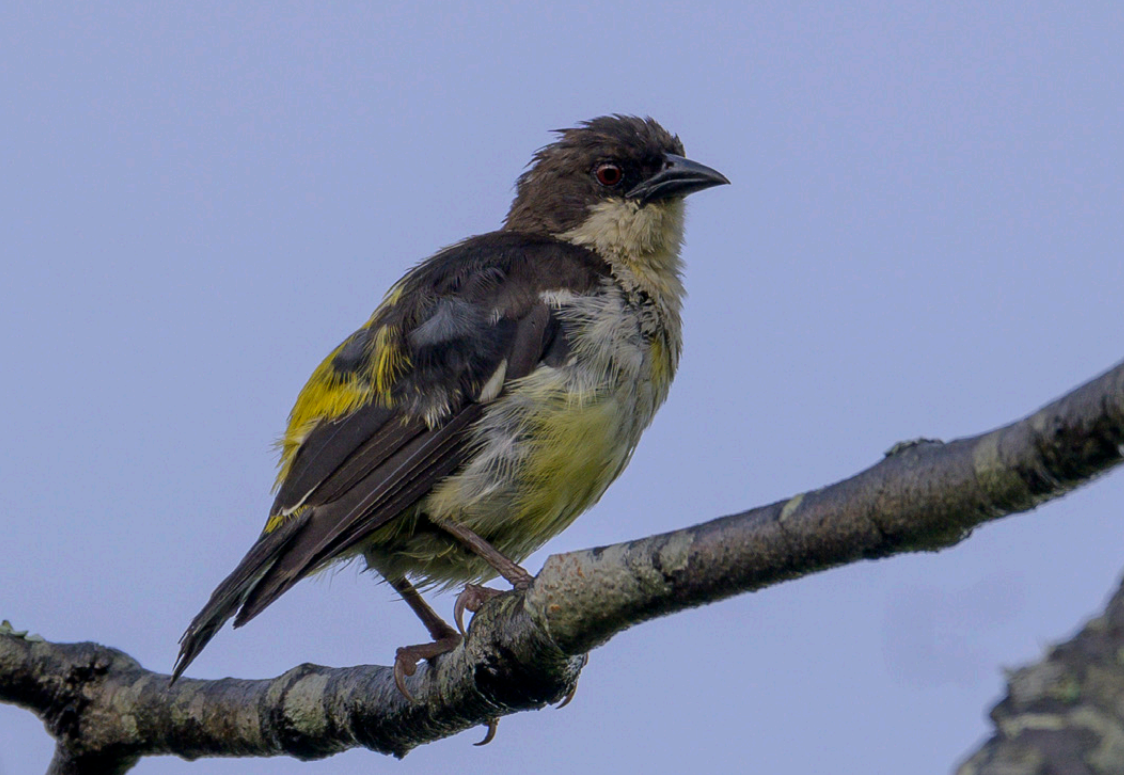
Bar-winged Weaver and Bennett's Woodpecker