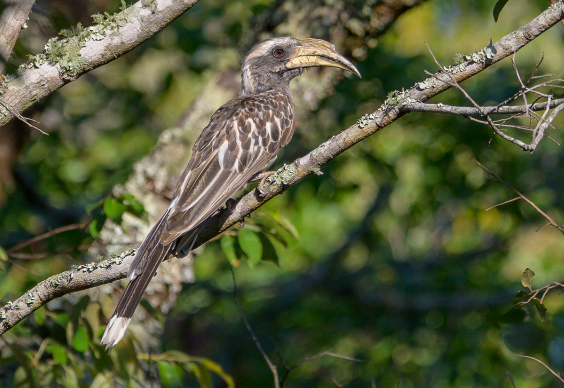
Pale-billed Hornbill and Gorgeous (Perrin's) Bushshrike