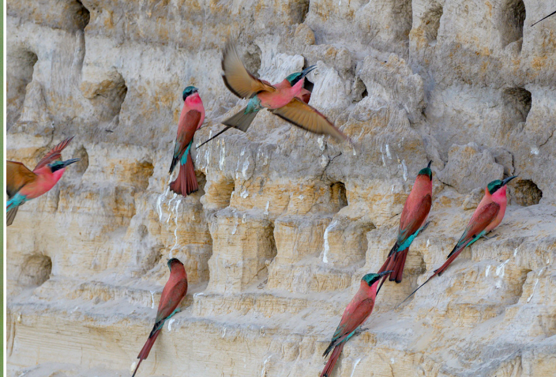
Southern Carmine Bee-eater