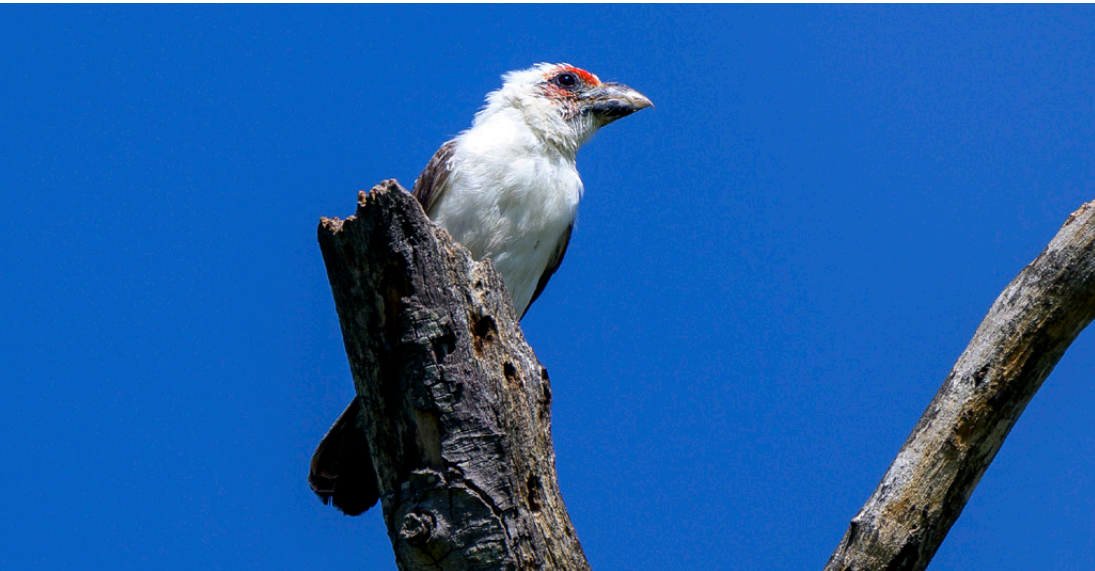
Zambian Barbet

gallery forests (mashitus) held Bocage's Akalat, Bannerman's Sunbird and Laura's Woodland Warbler. And other top birds seen included dispalying African Pitta at two locations, point-blank views of Margaret's Batis, Olive Long-tailed Cuckoo, Shelley's Francolin, terrific views of the localised Whyte's Francolin, Forbes's Plover, Lesser Jacana, Three-banded Courser, Southern White-faced Owl, African Barred Owlet, Bradfield's Hornbill, Böhm's Bee-eater Southern Carmine Bee-eater, Dickinson's Kestrel, Livingstone's Flycatcher, Bamboo Warbler, Luapula Cisticola, Shelley's Sunbird and Bushveld Pipit. In total we logged 461 species.