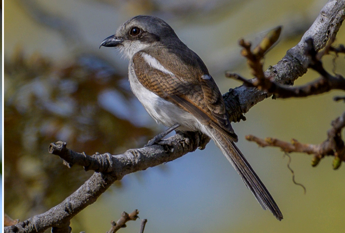
Sousa's Shrike and Shelley's Francolin