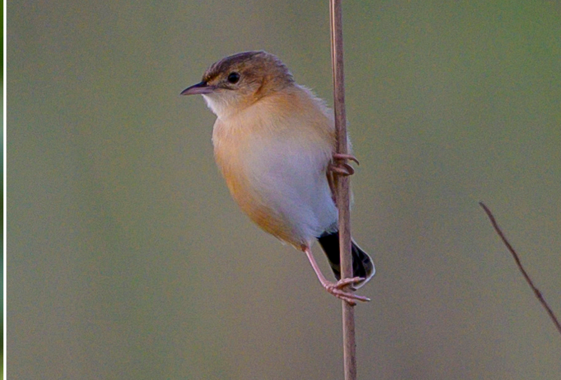
Dambo Cisticola and Fawn-breasted Waxbill