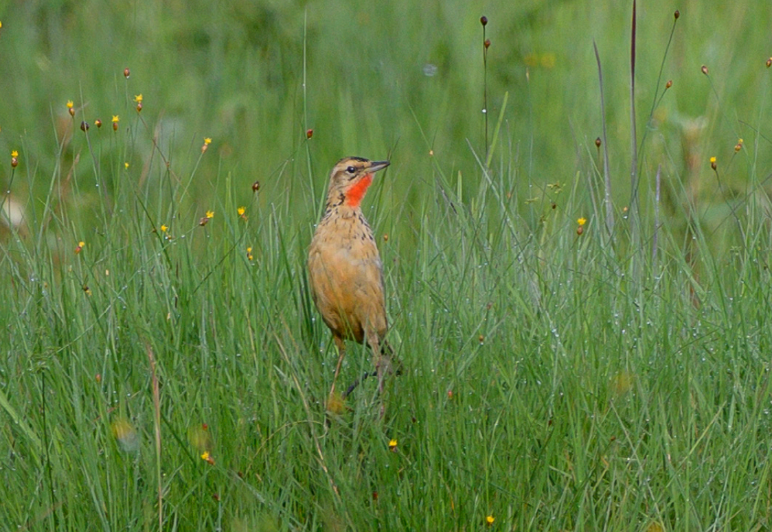
Grimwood's Longclaw and Lesser Jacana