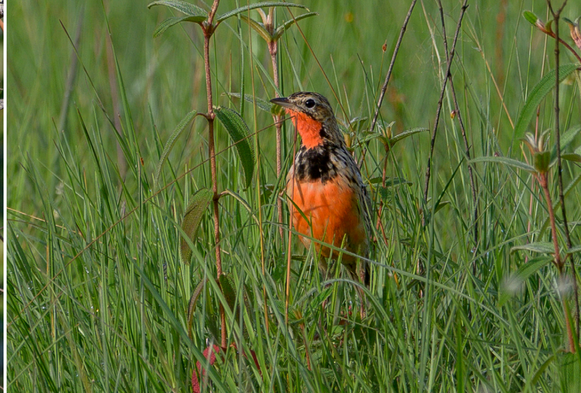
Rosy-throated Longclaw and Rufous-bellied Tit