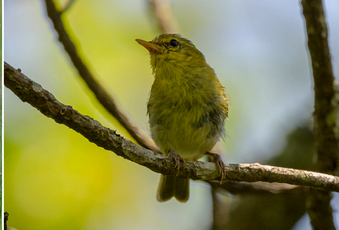
Laura's Woodland Warbler and Livingstone's Flycatcher