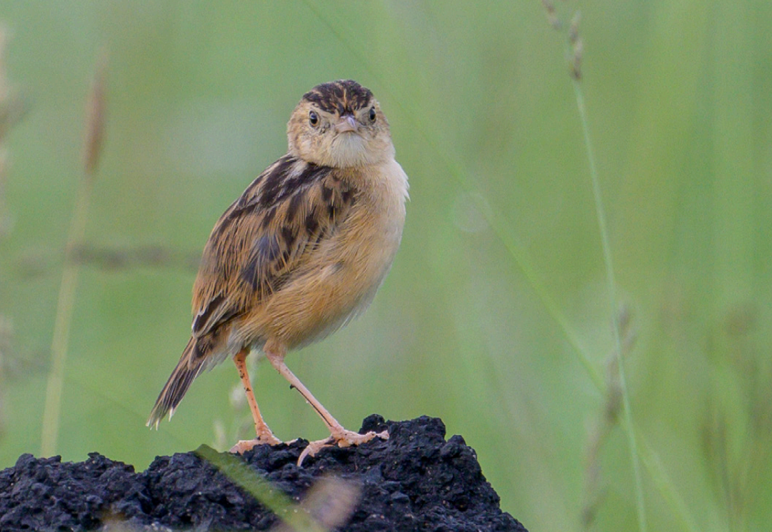
Wing-snapping Cisticola and Zambian Barbet