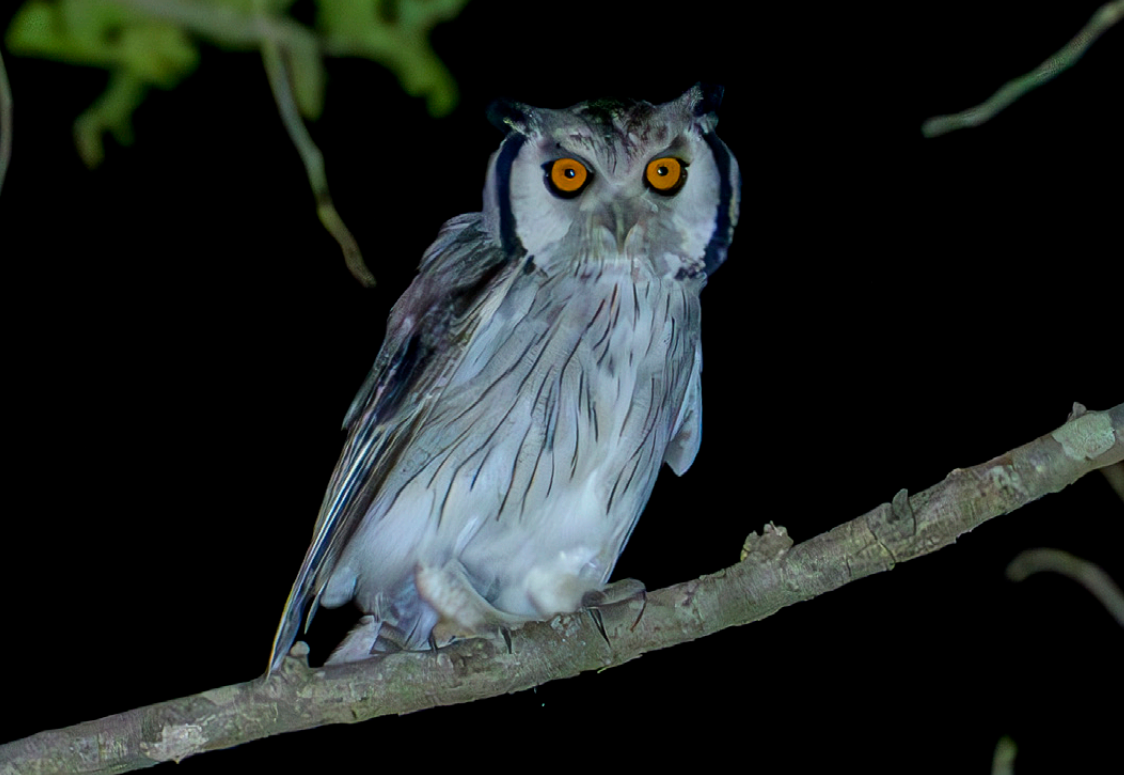
Southern White-faced Owl and Splendid Daggar-toothed Tree Snake