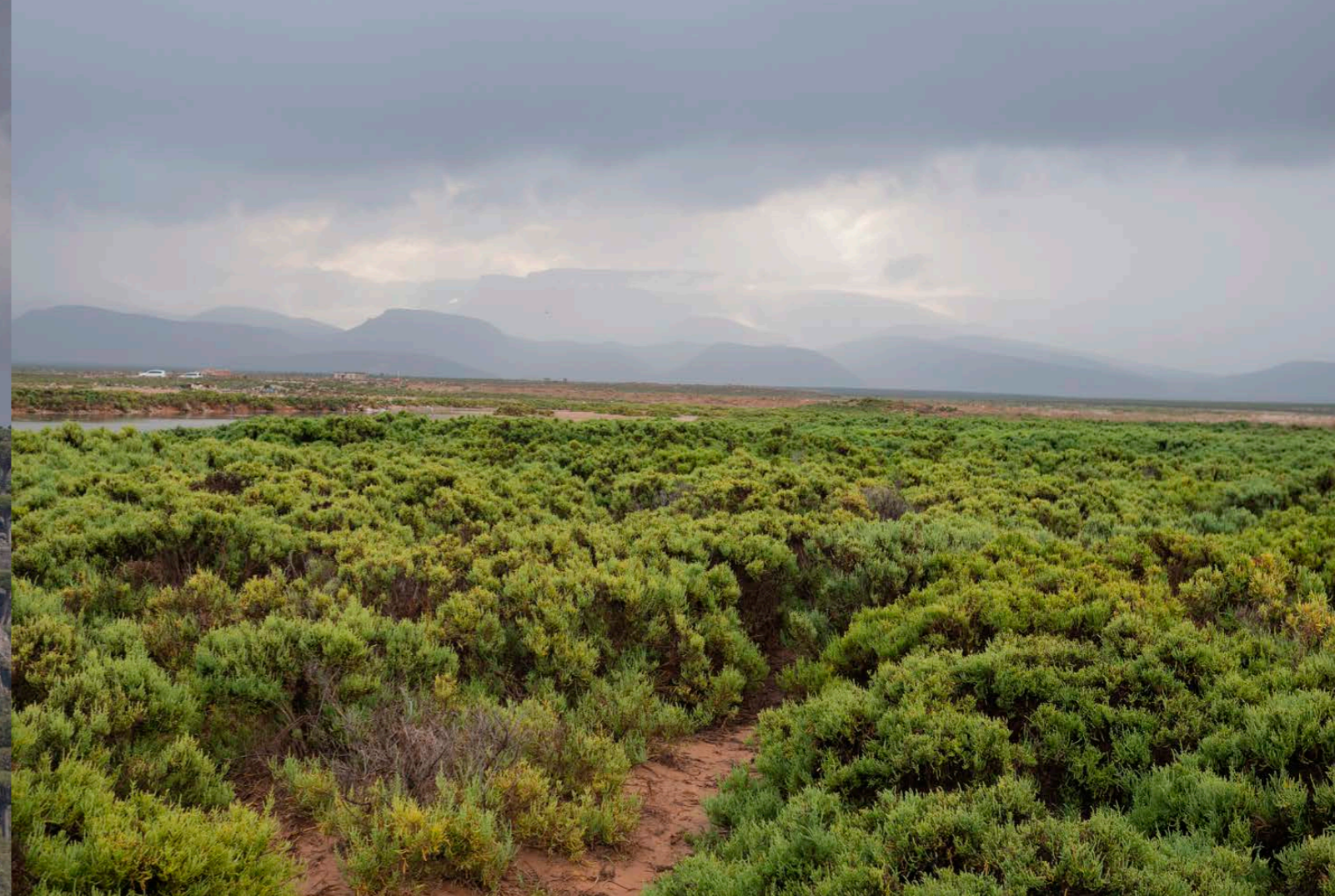
Coastal salt bushes (above) and spectacular scenery on the Diksam plateau (below)