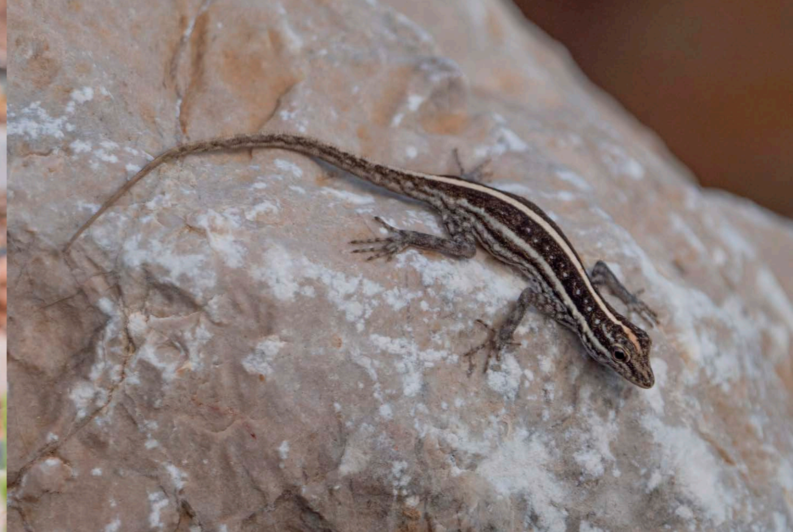
Socotra Rock Gecko Pristurus sokotranus (above) and Socotra Skink Trachylepis socotrana (below)