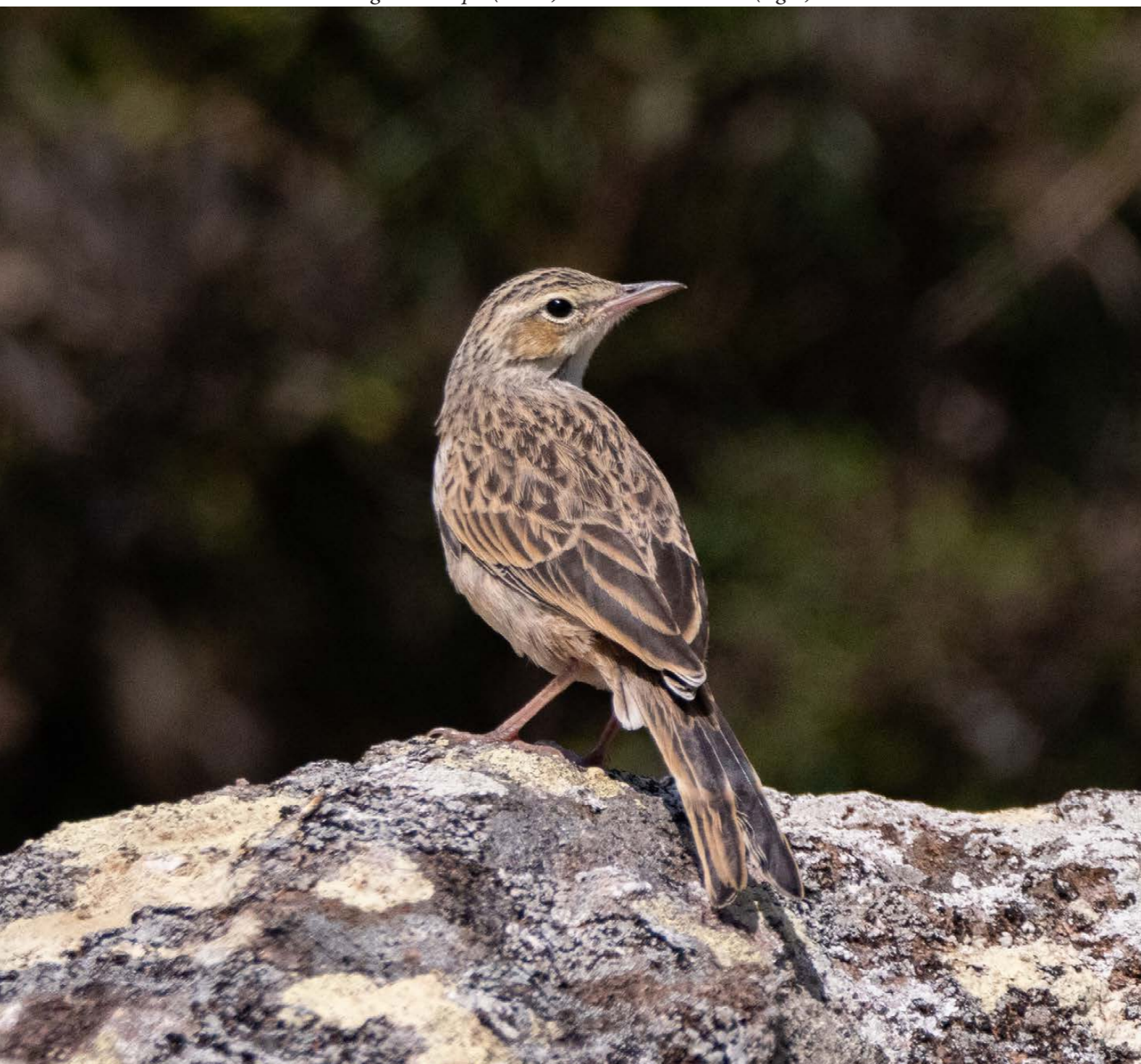
Long-billed Pipit (below) and Socotra Sunbird (right)

Endemic species. Two pairs and a single bird showed well on the Diksam Plateau on 14/12.