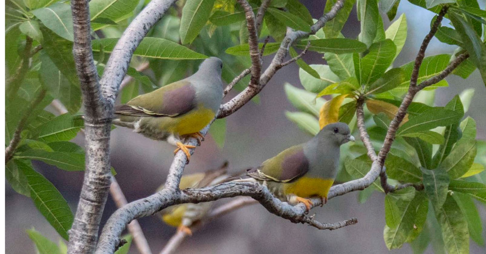
Bruce's Green Pigeon