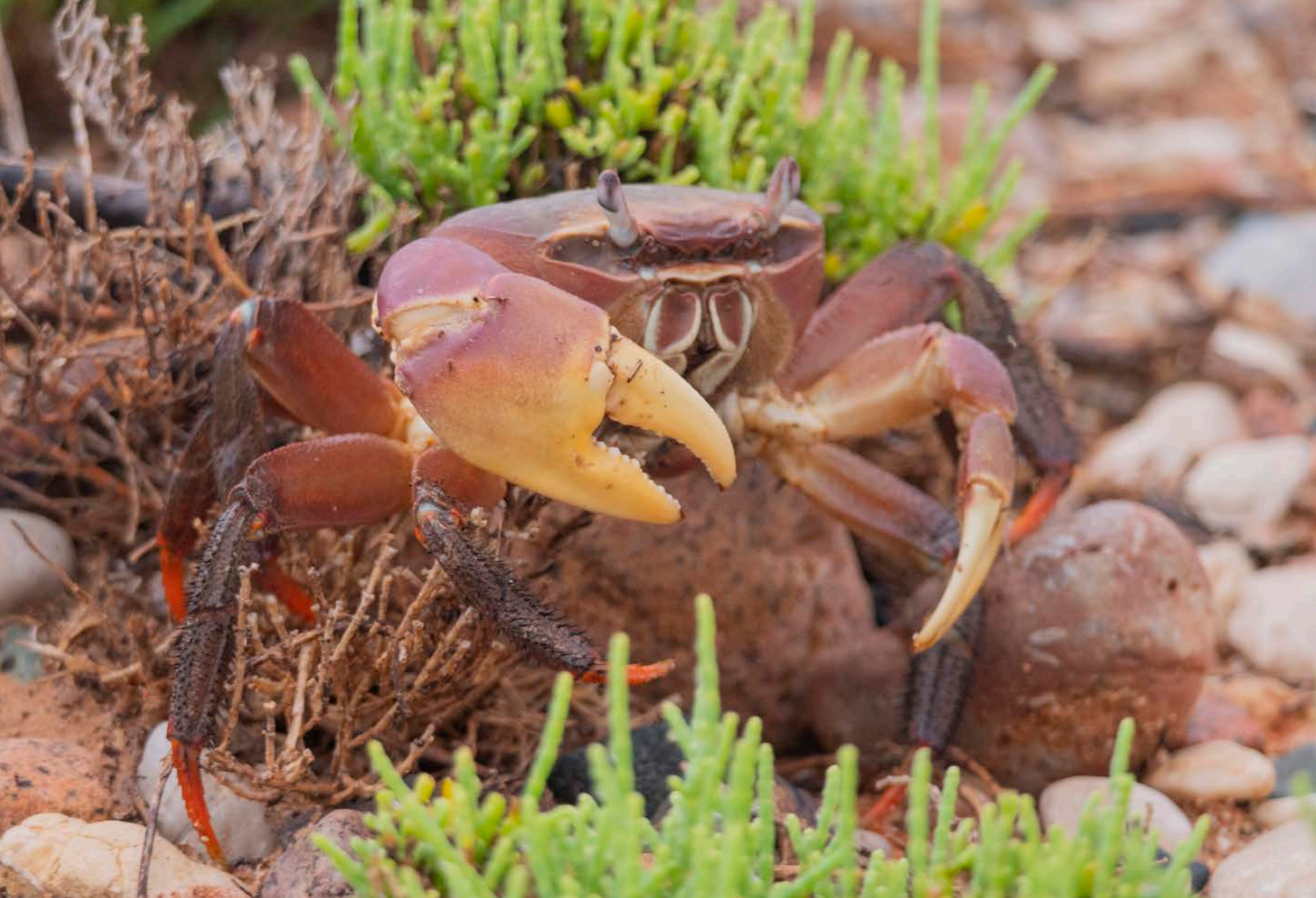
Fiddler crab and some of the striking plant life