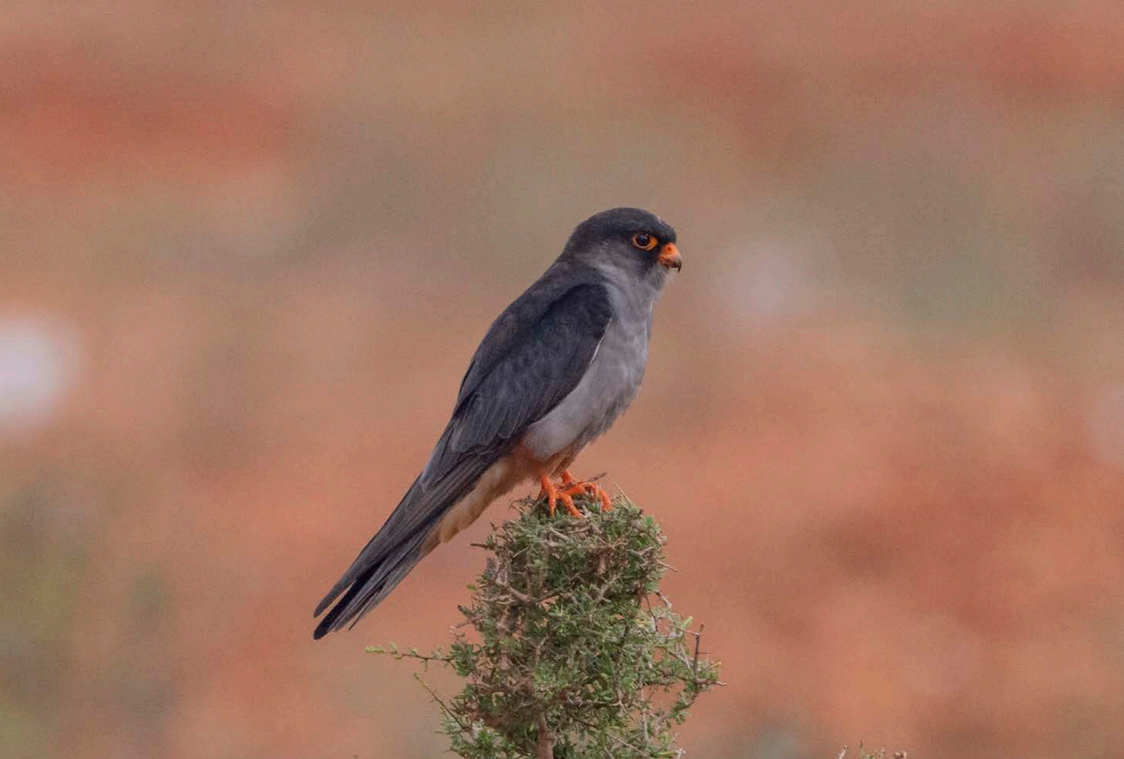
Amur Falcon male (above) and female (below)