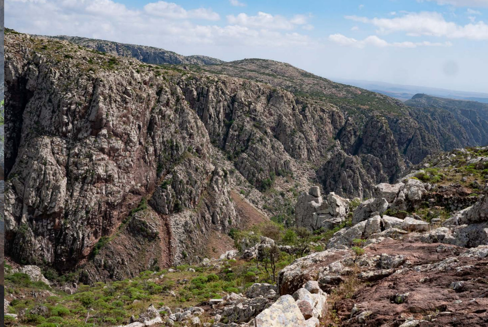
Spectacular mountains on the Diksam plateau