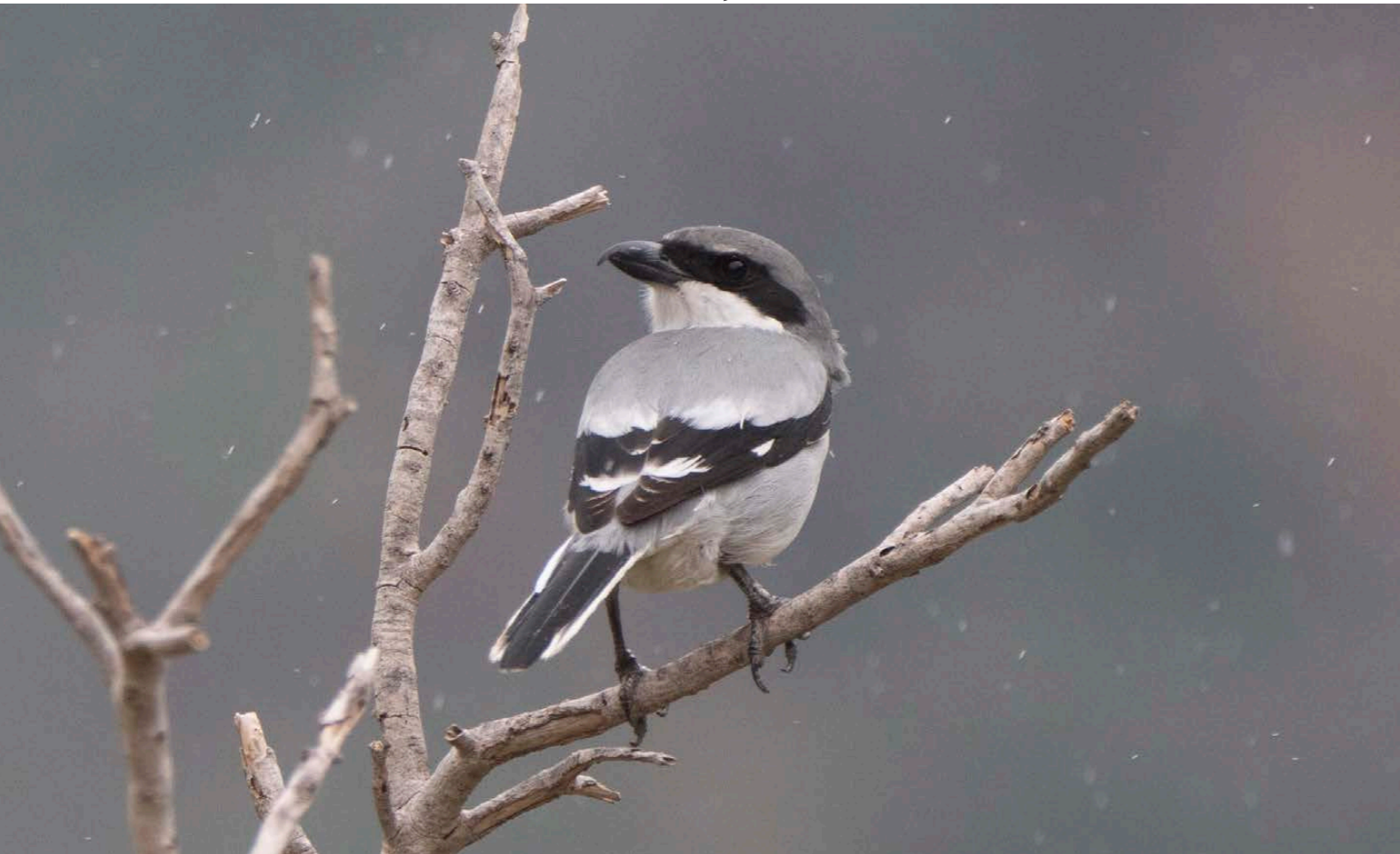
Socotra Grey Shrike

Common throughout, usually in pairs or small groups, with up to 50 birds per day.