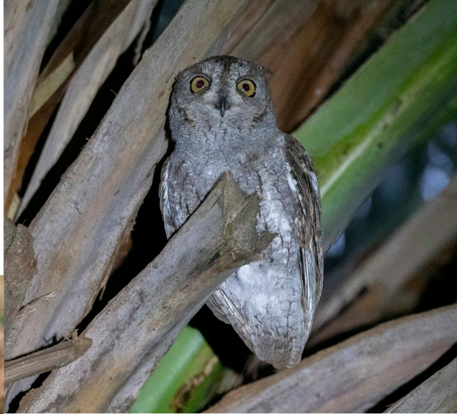
Socotra Scops Owl