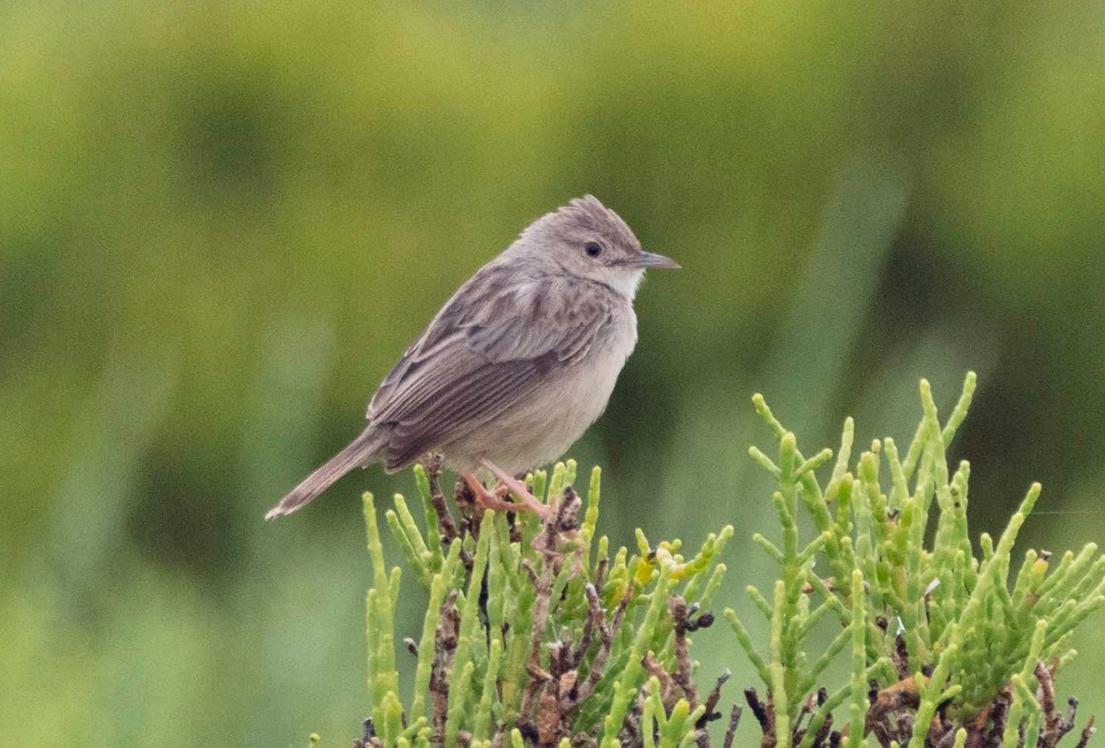
Socotra Cisticola (above) and Socotra Warbler (below)