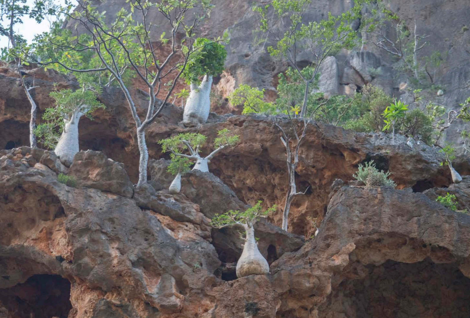
Bottle trees of various species (above) and a boy in the top of a Dragon's Blood Tree (below)