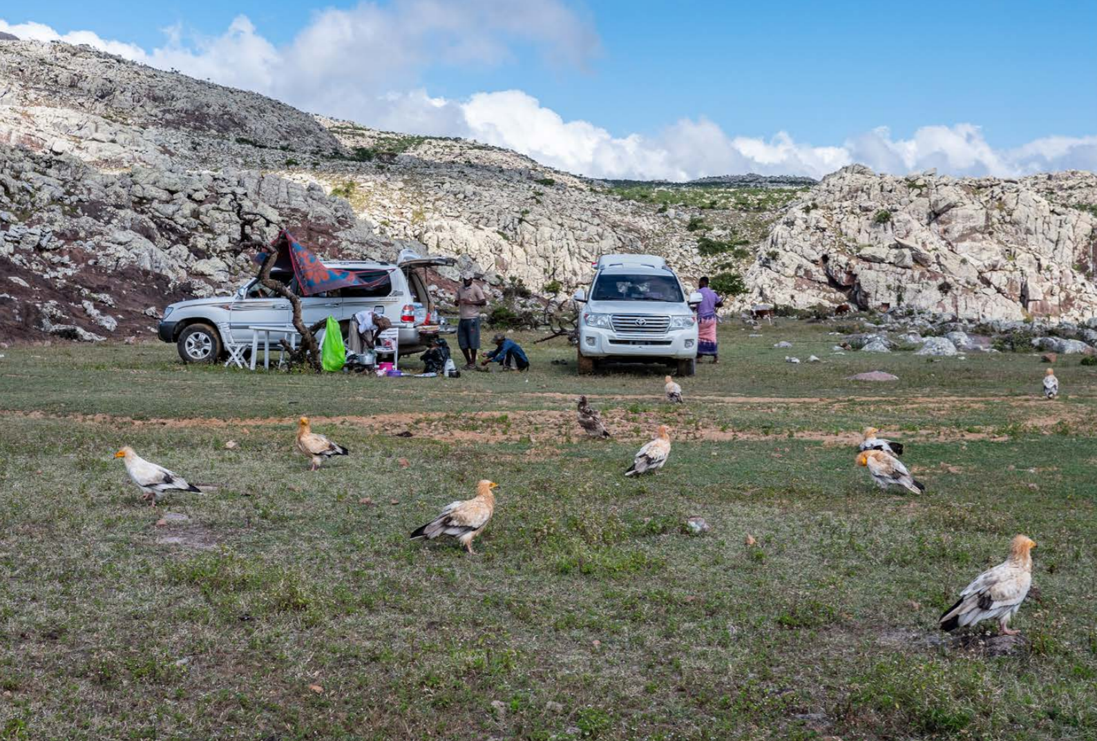
Picnic lunch with Egyptian Vultures (above) and a spectacular mountain pass on the east of the island (below)