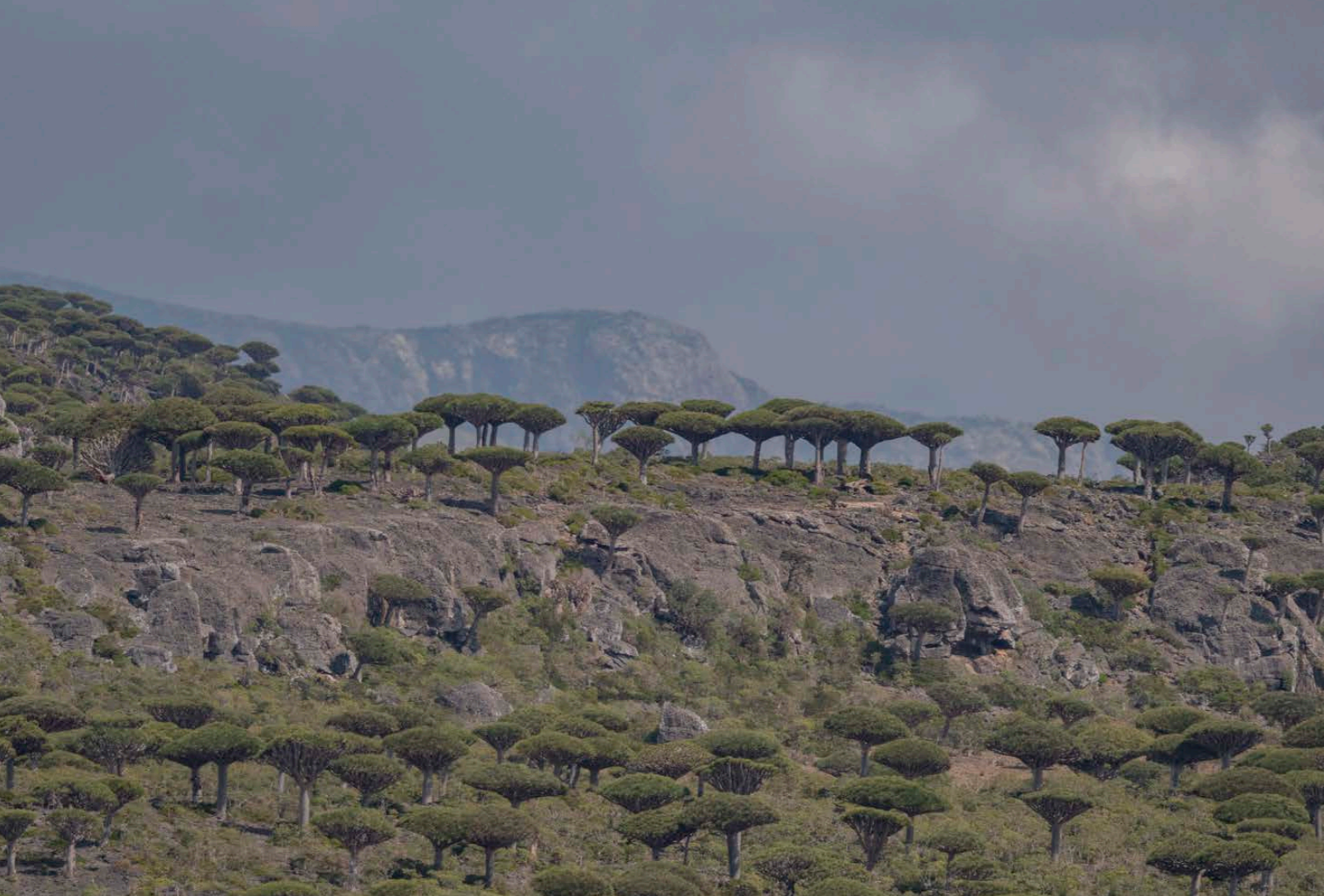
A Dragon's Blood Tree forest (above) and scenery along the north-west coast (below)