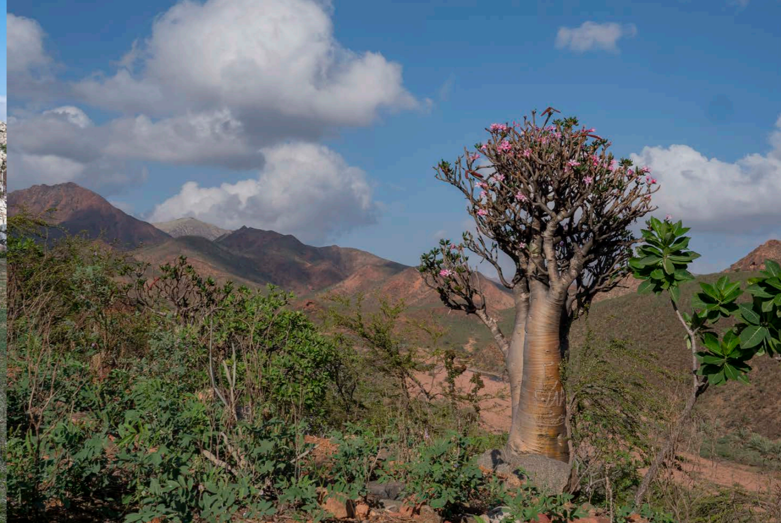
Unusual plants and rugged scenery are some of the highlights of Socotra