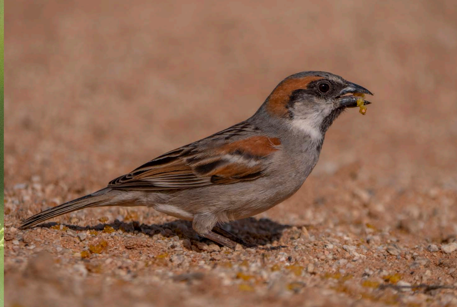
Male Socotra Sparrow (above) and female Somali Starling (below)