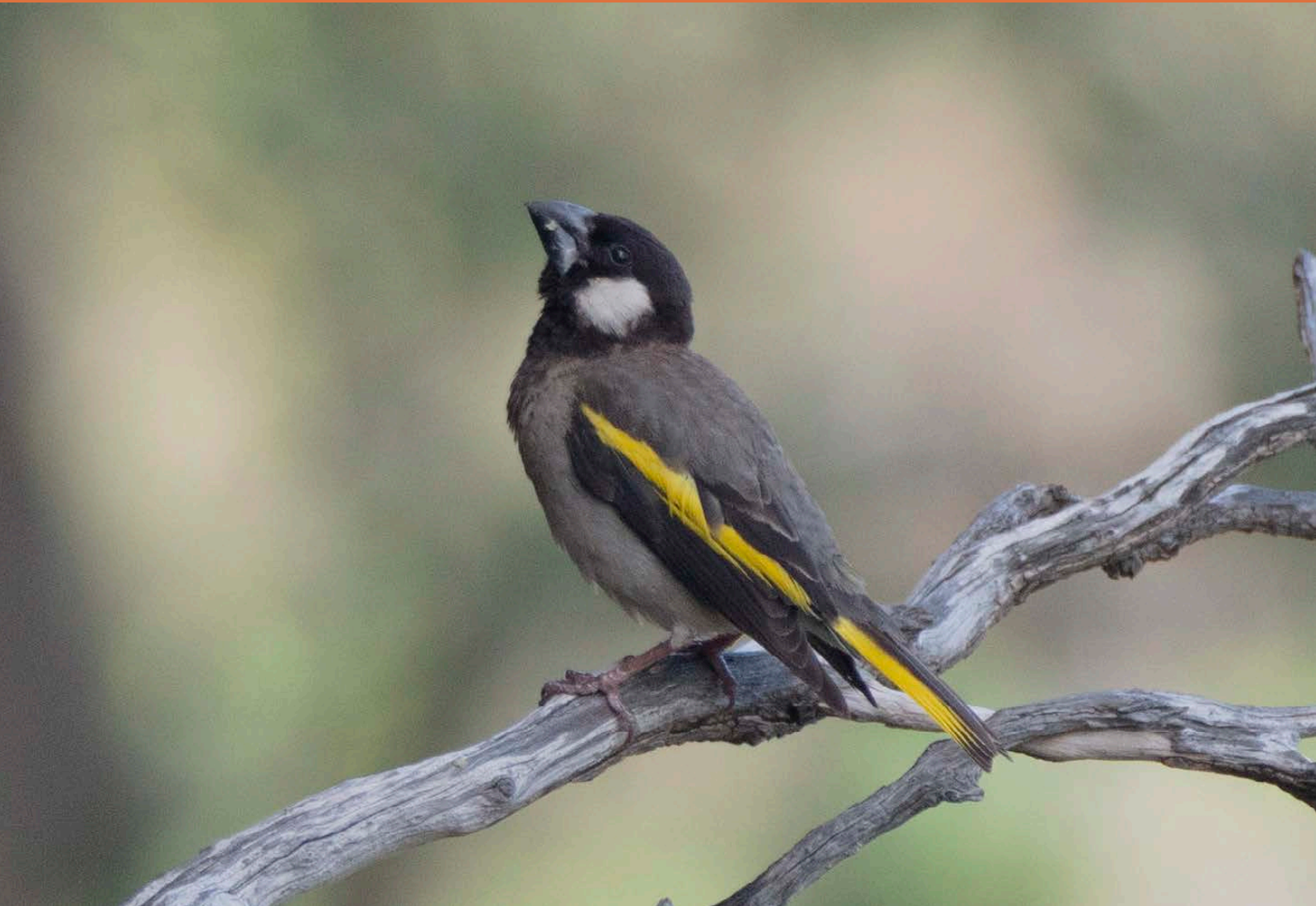
Socotra Golden-winged Grosbeak