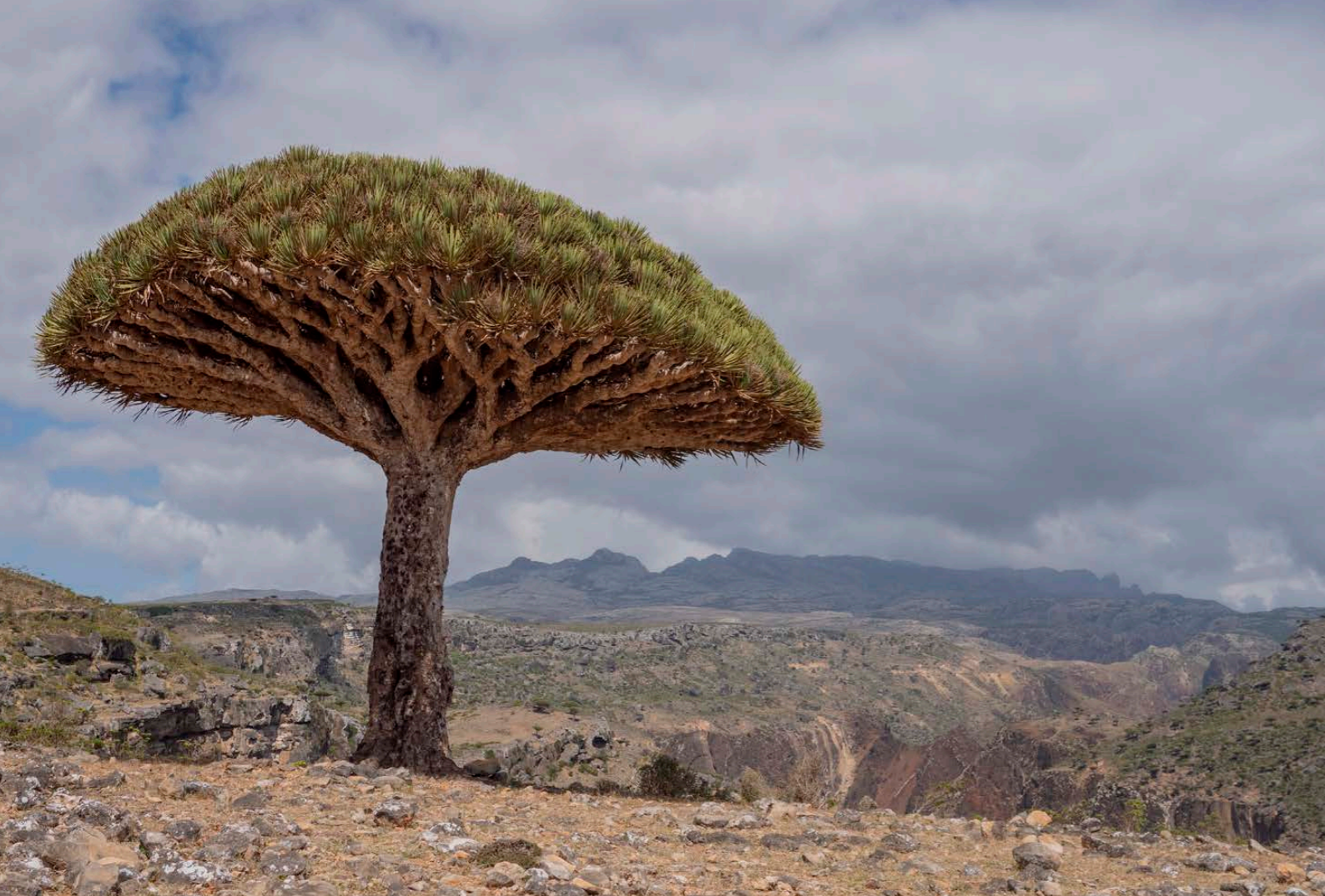
Dragon's Blood Trees (above and right) and enjoying the scenery of Socotra (below)