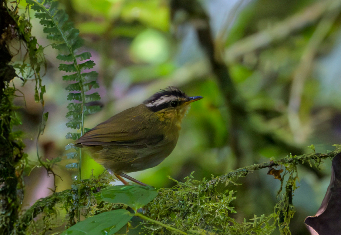
Neumann's Short-tailed Warbler and Olive-breasted Mountain Greenbul © Michael Mills