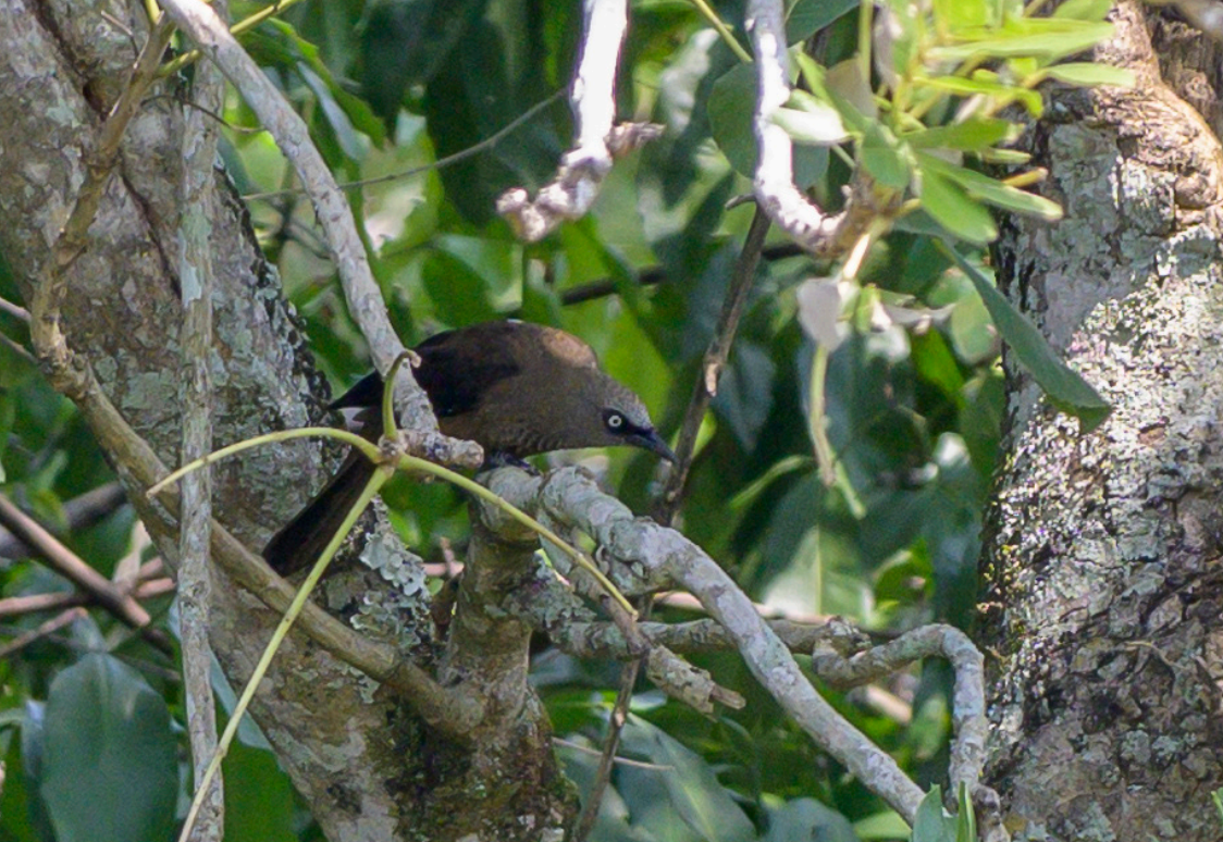
Dusky Babbler and Black-and-white Flycatcher © Michael Mills