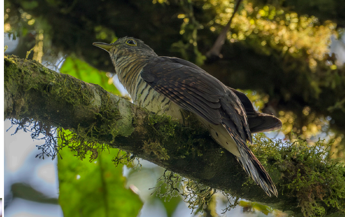
Olive Long-tailed Cuckoo © Michael Mills

This year the forests at Buhoma were hard work, and a full two days along the main forest track turned out to be useful. On the first day in particular bird activity