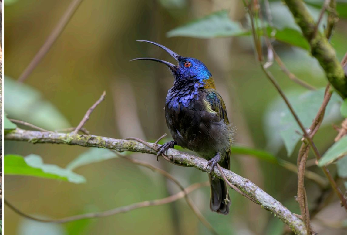
Rwenzori Blue-headed Sunbird and Chestnut-throated Apalis