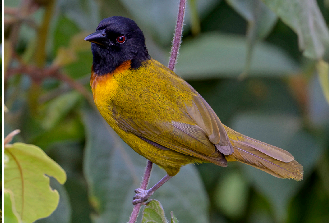
Strange Weaver and Mountain Masked Apalis