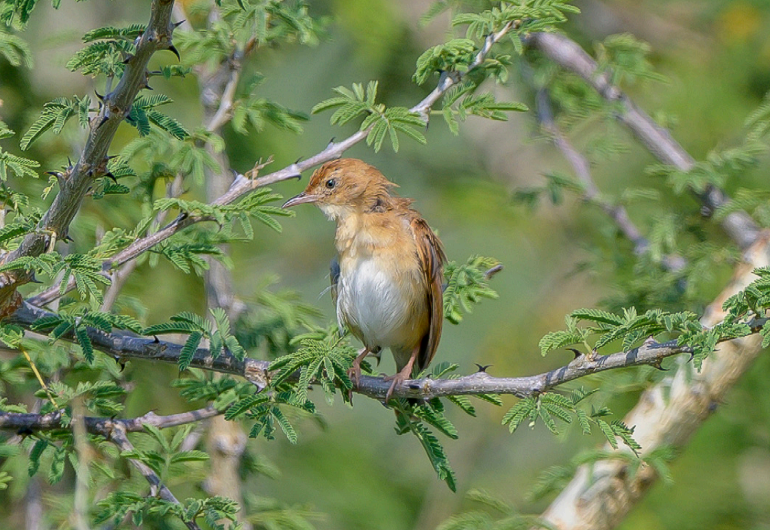
Foxy Cisticola and Golden-backed Weaver