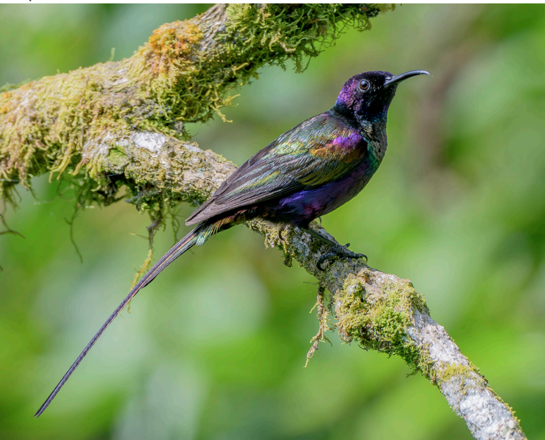
Purple-breasted Sunbird

Our return to Kigali was rather quicker than the trip to Nyungwe, as we made use of an internal flight. By late morning we were enjoying good views of White-collared Oliveback at a wetland reserve near Kigali's International Airport. Grey-backed Fiscal, Black-lored Babbler, Long-crested Eagle and various other widespread species entertained us before and after lunch, after which we drove to Akagera National Park. The lodge grounds were rather quiet, but did turn up a few new species, including Orange-breasted Bushshrike, Black-cheeked Waxbill and Black Cuckooshrike.