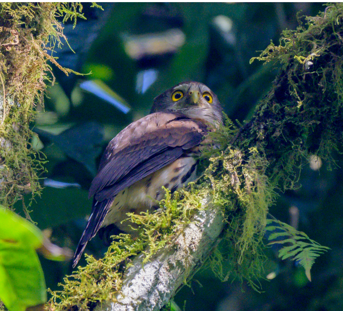
Red-chested Owlet

With pitta having relented easily this year, we had a full day to spend at the very birdy Bigodi Wetland Community Reserve, which proved highly worthwhile. Our two visits were split by lunch and a break in the early afternoon. Top birds of the walk included a very showy male White-spotted Flufftail, the scarce Orange-tufted Sunbird, striking Papyrus Gonolek and Red-headed Bluebill, and a large flock of Magpie Mannikin. Other noteworthy sightings included Great Blue Turaco, another Speckle-breasted Woodpecker, Purple-headed Starling, Grey Parrot, Eastern Yellow-billed Barbet, Ross's Turaco and Brown Illadopsis.