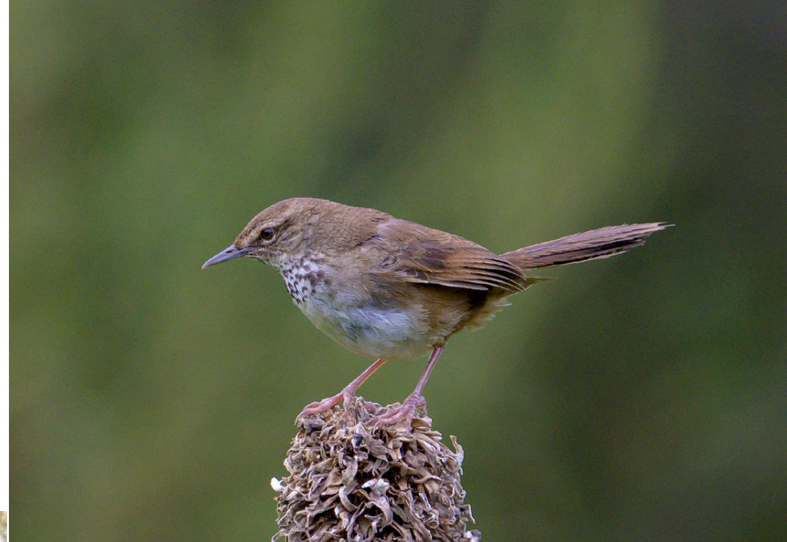
Grauer's Rush Warbler

did at least find some species of interest: Highland Rush Warbler displayed in some tall reeds, and other species included Western Citril, breeding-plumaged Southern Red Bishop (potentially split as Central Red Bishop), Winding Cisticola, Swamp Flycatcher, Baglaffeht Weaver, Fawn-breasted Waxbill, Cape Wagtail, Grey-capped Warbler, Blue-billed Teal, Black-headed Gonolek, Black Sparrowhawk, White-headed Saw-wing, Black-headed Weaver, Red-throated Wryneck and Long-toed Lapwing. Moving on we found a record number of Ruaha Chats on our way to our picnic lunch stop, which was followed by a short birding walk in the adjacent savanna habitat. Northern Red-headed Weaver, Trilling Cisticola, Ayres's Hawk-Eagle, Yellow-fronted Tinkerbird, Southern Black Flycatcher, White-eyed Slaty Flycatcher and Black-backed Puffback all put in appearances, and we heard Crested Barbet.