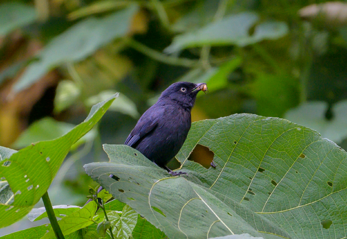
Yellow-eyed Black Flycatcher, Yellow-billed Oxpecker and White-winged Swamp Warbler