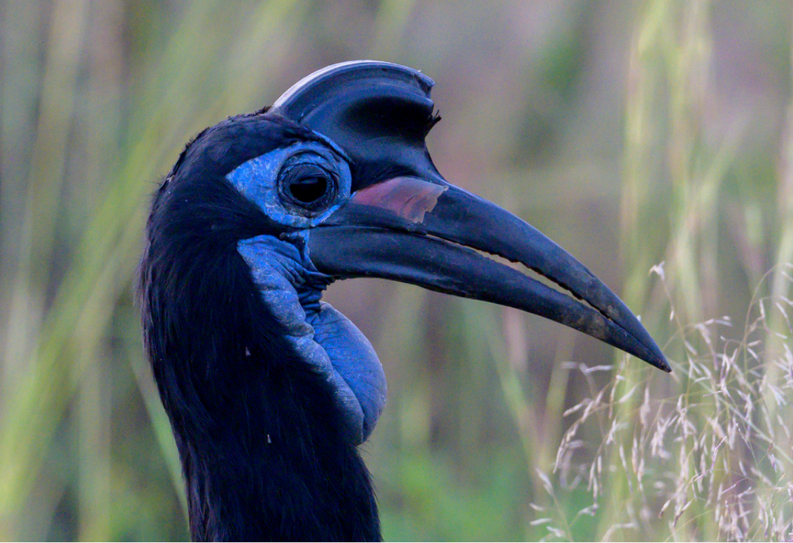
Abyssinian Ground Hornbill, African Broadbill and Black Bishop