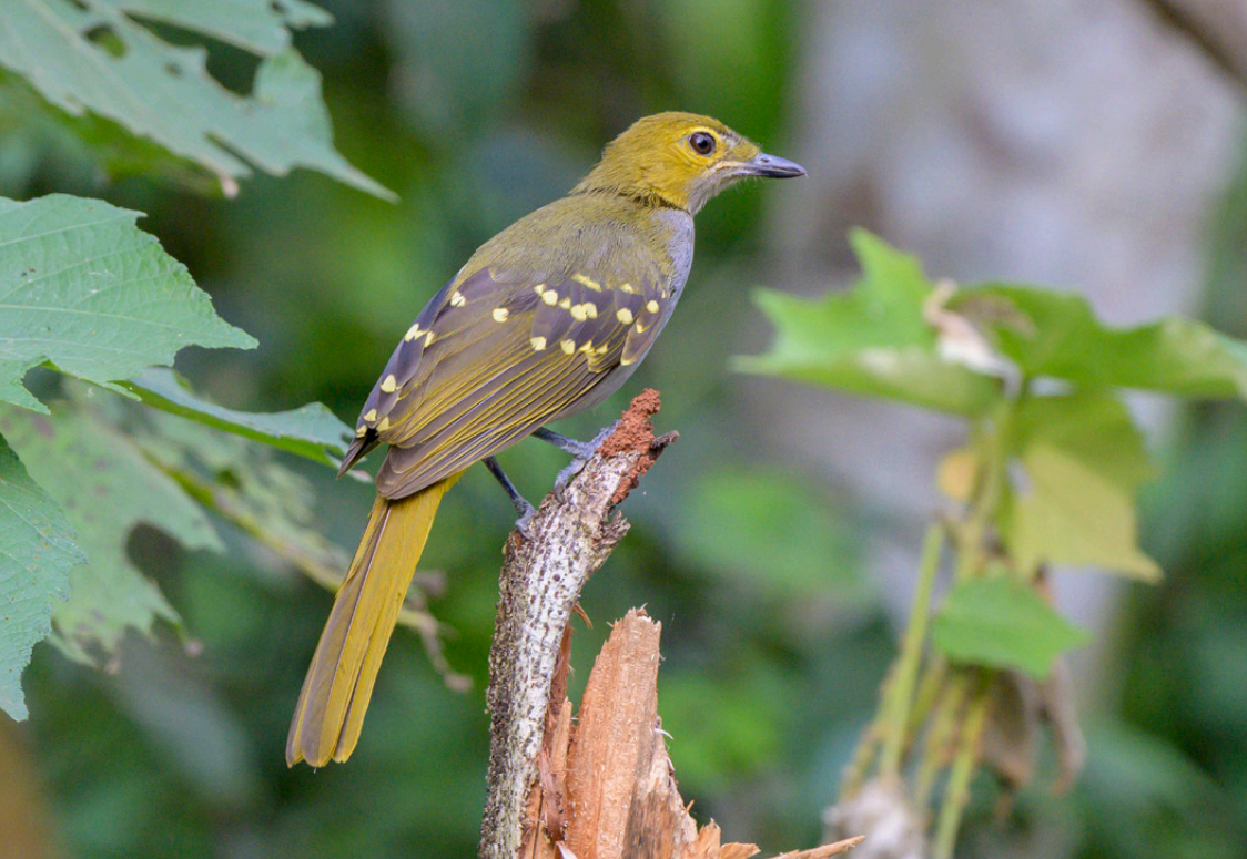
Western Nicator and Joyful Greenbul