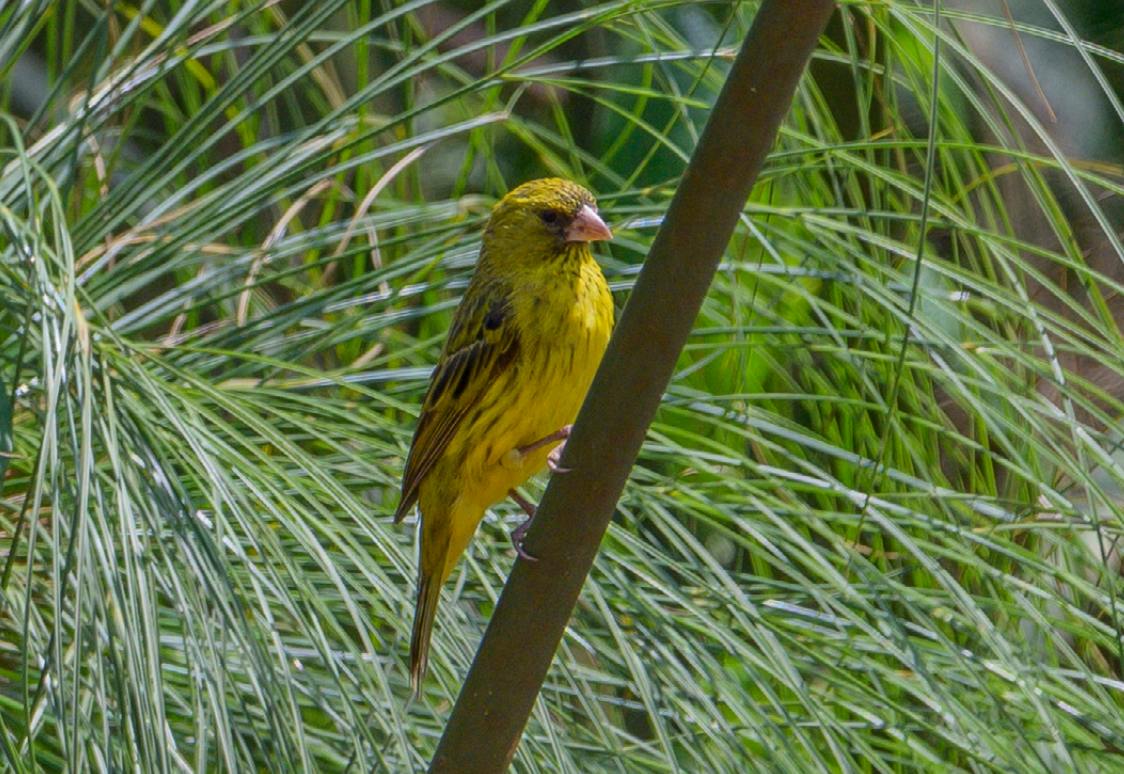
Papyrus Canary, White-spotted Flufftail and Doherty's Bushshrike