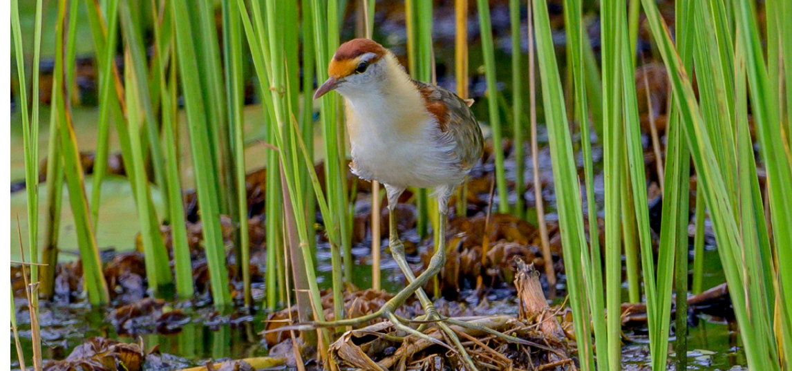
Lesser Jacana

The next morning we set off early to enjoy the better part of the day on the north side of the Nile. Early on, thorn thickets held Shelley's Rufous Sparrow and Speckle-fronted Weaver. Wooded areas were home to Black-billed Wood Doves, Swallow-tailed Bee-eater, White-browed Sparrow-Weaver, Chestnut-crowned Sparrow-Weaver, Beautiful Sunbird, Grey-headed Kingfisher, Black Scimitarbill, Jacobin Cuckoo, Black-billed Barbet and Northern Carmine Bee-eater, and in more open areas we enjoyed Abyssinian Ground Hornbill, Black-headed Lapwing and Piapiac. The numbers of large mammals was impressive, and at times we were surrounded by Sudan Oribo, Uganda Kob and Jackson's Hartebeest. A scan through the delta failed to turn up Shoebill, before we returned to Paraa where a productive little session rewarded us with Dusky Babbler and White-crested Turaco. The rest of the afternoon was enjoyed on the Nile River as we cruised upstream to admire the falls, seeing African Skimmer, Goliath Heron, Water Thick-knee and Saddle-billed Stork along the way. Water levels were high, which meant the Rock Pratincoles had to make use of some exposed tree branches; an odd sight.