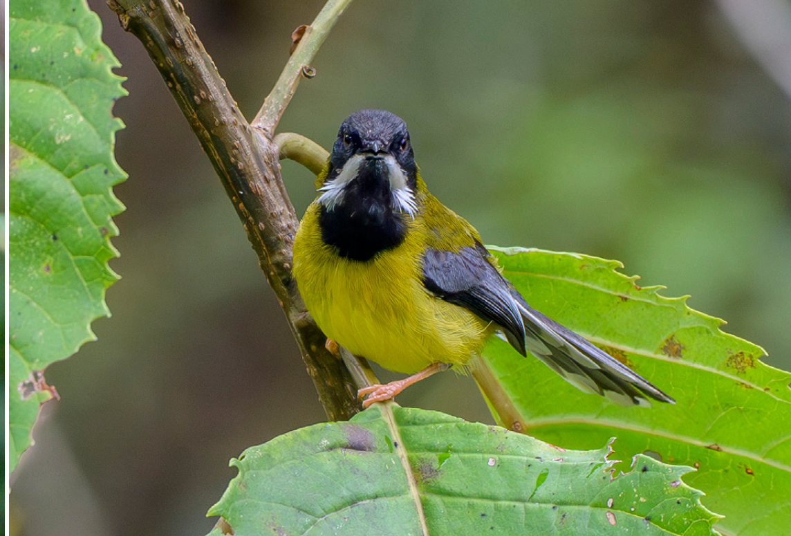
Black-throated Apalis and Fox's Weaver © Michael Mills