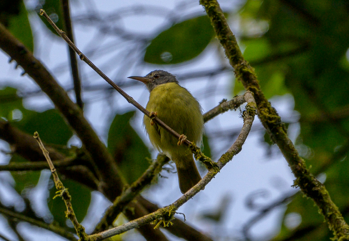
Grey-headed Sunbird and Great Blue Turaco