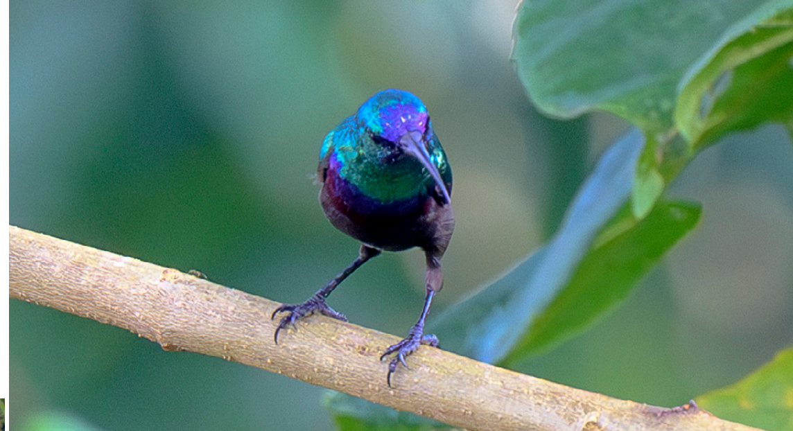
Orange-tufted Sunbird

created a spectacular cacophony, but unfortunately they somehow eluded us before the paying chimp trekkers arrived, at which we returned to the main track that leads through the forest, and spent the rest of the morning seeing Red-chested Owlet, Red-chested Cuckoo and Western Black-headed Oriole. After lunch and some down time we utilised the latter part of the afternoon to bird along the main road, before some over-zealous military officials decided it was unsafe for us to be there despite it having been cleared with park officials. Still, before we were moved on, we did manage to see Western Nicator and Sabine's Spinetail.