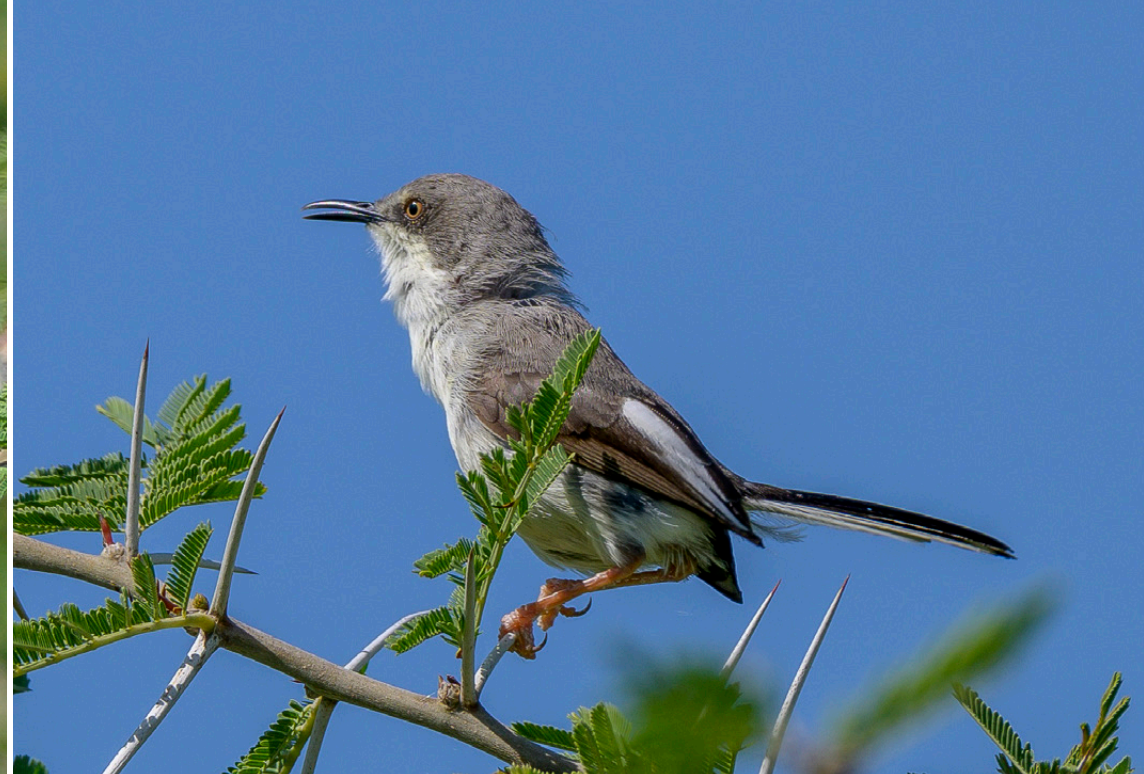
Karamoja Apalis and Many-coloured Bushshrike