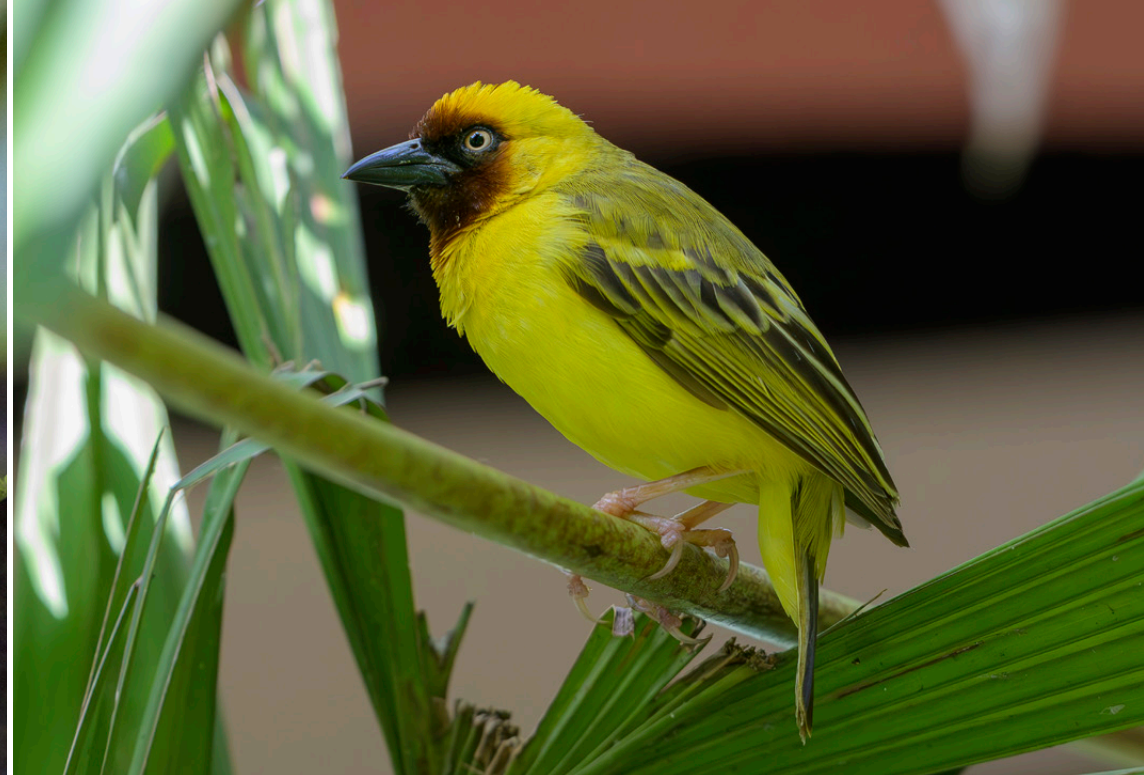
Northern Brown-throated Weaver and Papyrus Yellow Warbler