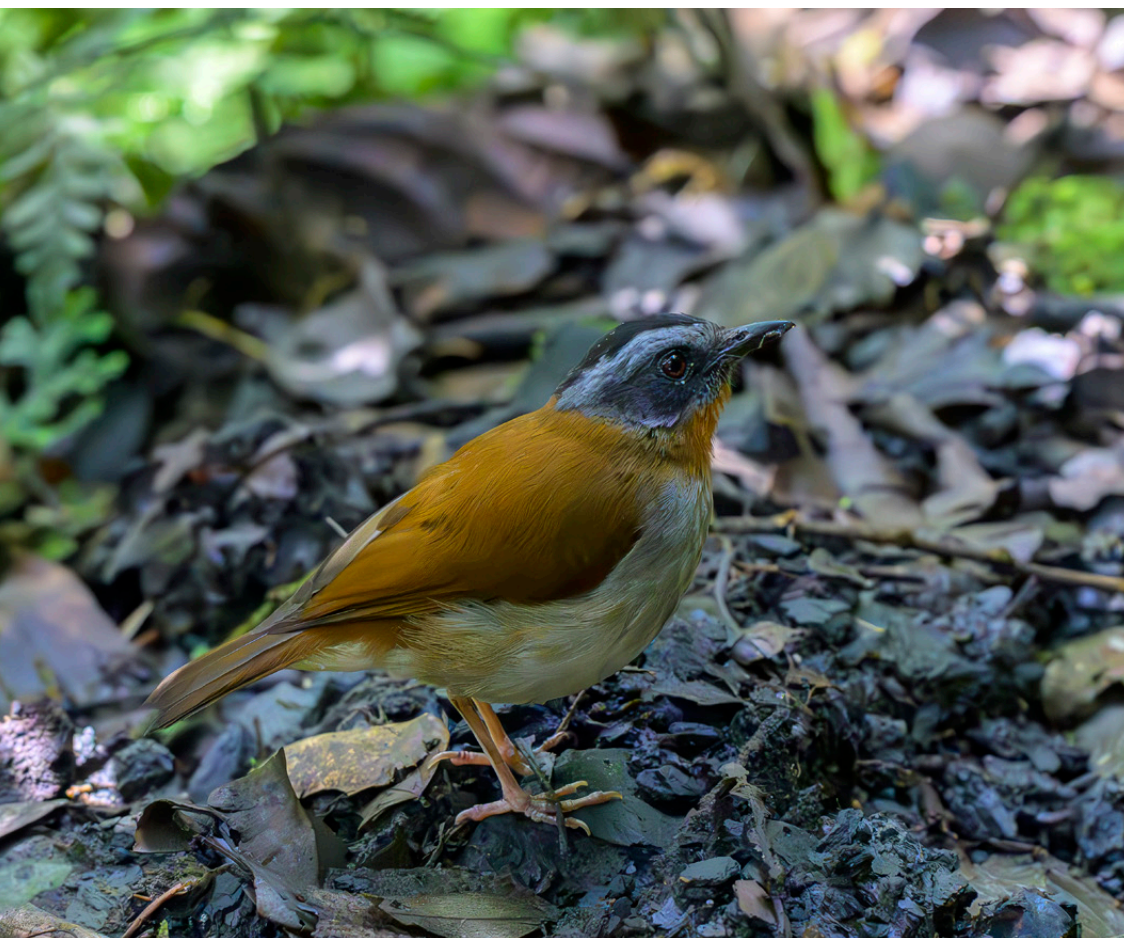
Red-throated Alethe

was very slow. Highlights included the localised Chapin's Flycatcher, plus Lühder's Bushshrike, Many-coloured Bushshrike, singing Willcocks's Honeyguide and Toro Olive Greenbul. Both Olive Long-tailed Cuckoo and Dusky Long-tailed Cuckoo were found and admired through the scope. The second day got off to a better start, with Grey-winged Robin-Chat, Blue-shouldered Robin-Chat and Scaly-breasted Illadopsis seen rather quickly. African Broadbill, a male Jameson's Antpecker, and Grey-headed Sunbird followed over the course of the morning, and other highlights included Grey-throated Tit-Flycatcher, Green-throated Sunbird, Western Bronze-naped Pigeon, Hairy-breasted Barbet, Eastern Grey-throated Barbet, African Shrike-Flycatcher, Yellow-throated Tinkerbird, Red-tailed Bristlebill, Narrow-tailed Starling, Sooty Flycatcher and White-tailed Ant Thrush.