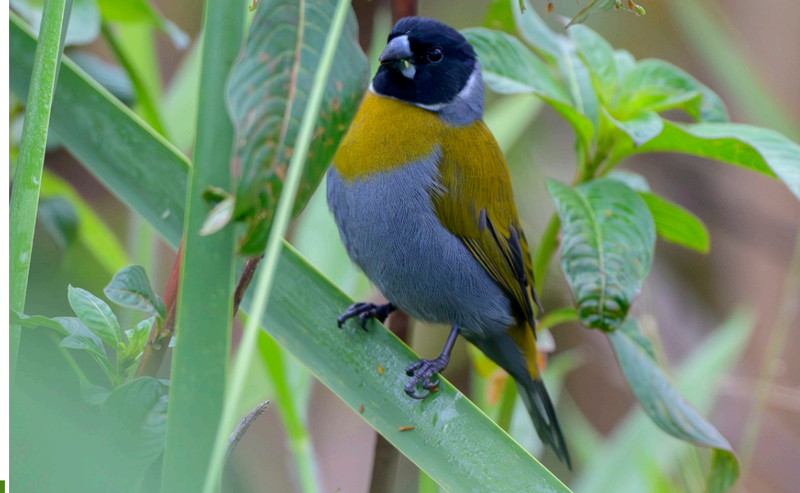
White-collared Oliveback

Warbler, Lagden's Bushshrike and Barred Long-tailed Cuckoo were all seen well. Red-chested Owlet was seen a couple of times, and other highlights included Bar-tailed Trogon, Cassin's Hawk-Eagle, Black-faced Rufous Warbler, Black-faced Prinia, Many-coloured Bushshrike (rare buff morph), Brown-capped Weaver, Cabanis's Greenbul, Black-billed Weaver, Chubb's Cisticola, African Olive Pigeon, Pink-footed Puffback, Yellow-eyed Black Flycatcher, White-tailed Blue Flycatcher, Dusky Tit, Rwenzori Hill Babbler, Stuhlmann's Starling, Waller's Starling, Sharpe's Starling, Yellow-streaked Greenbul, Elliot's Woodpecker, Scarce Swift, Equatorial Akalat, White-browed Crombec, Eastern Yellow-bellied Wattle-eye and White-bellied Robin-Chat. After dark Rwenzori Nightjar and African Wood Owl were seen exceptionally well.