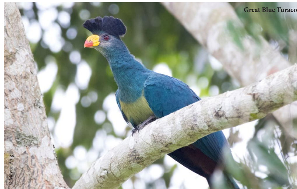
Great Blue Turaco

The final morning saw us visiting Mabamba Swamp. As we set off on our boat trip under sunny skies we spotted the first of several Northern Brown-throated Weaver . Next to follow was a pair of Lesser Jacana seen in good light. Open waters held Yellow-billed Duck , good numbers of White-winged Tern with some in breeding plumage, Grey-headed Gull and Reed Cormorant , while African Marsh