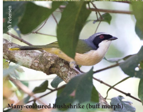
Many-coloured Bushshrike (buff morph)