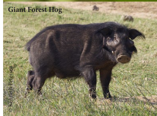
Giant Forest Hog