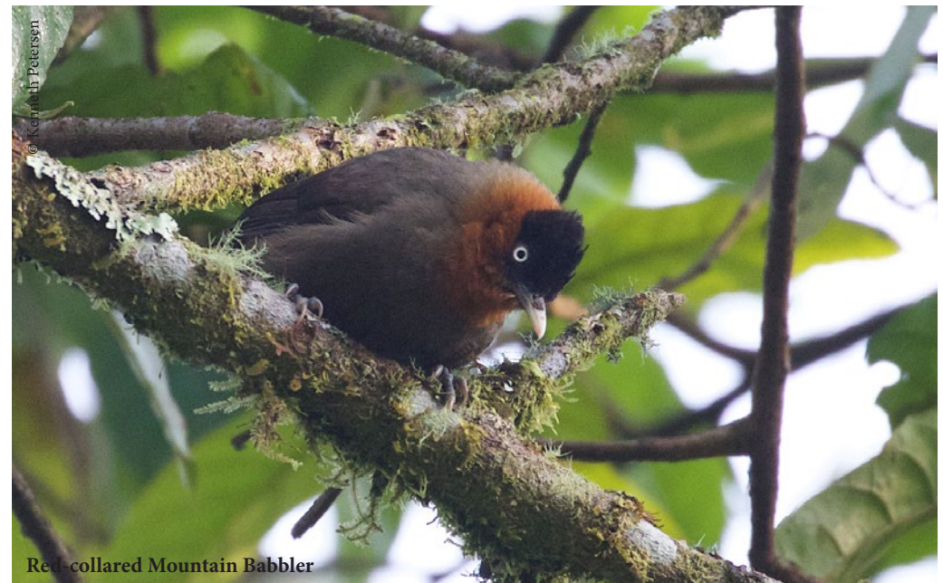
Red-collared Mountain Babbler