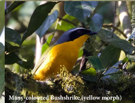
Many-coloured Bushshrike (yellow morph)