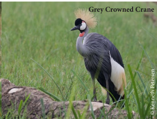
Grey Crowned Crane