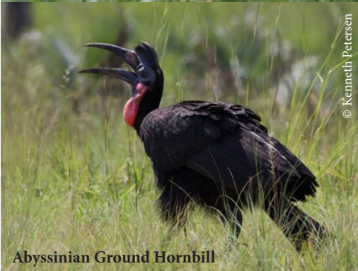
Abyssinian Ground Hornbill