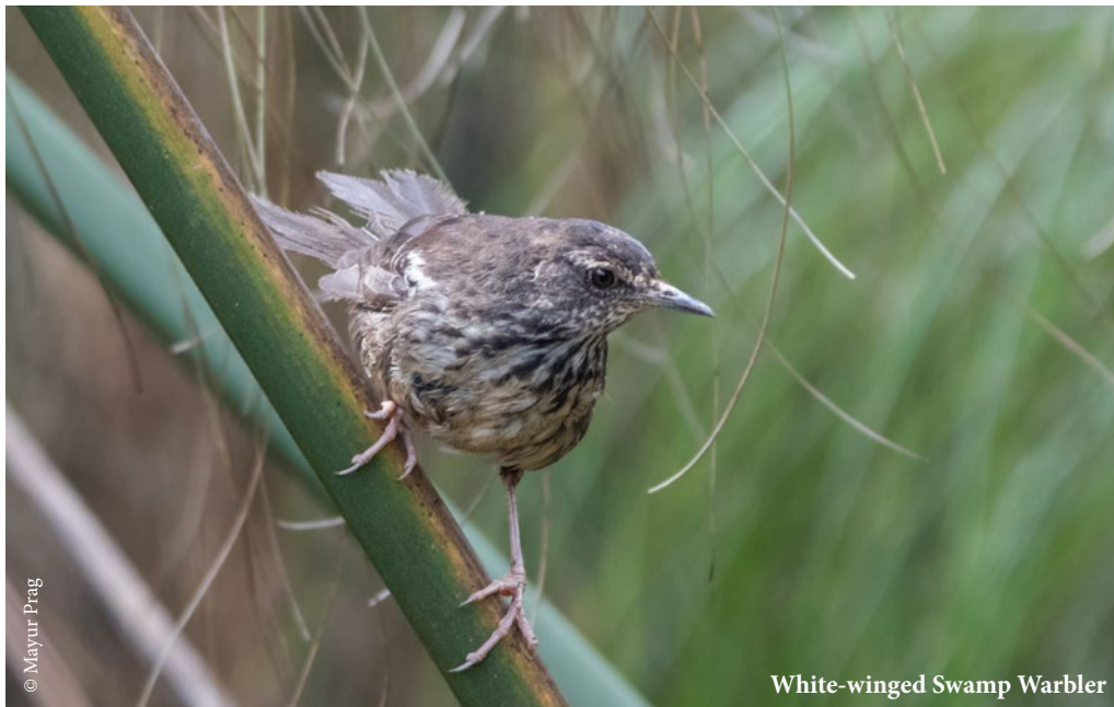
White-winged Swamp Warbler

Leaving Buhoma it was now time for some open-country birding as we first travelled through farmlands to the Kihikihi area. A sunset session produced several distant Pennant-winged Nightjars and a very agitated Black-shouldered Nightjar , and African Wood Owl after dinner. The next morning we found Swamp Nightjar pre-dawn, and once it was light Grey-backed Fiscal, Yellow-throated Leaflove, Rüppell's Starling, Levaillant's Cuckoo, Sooty Chat, Copper Sunbird, Black Cuckooshrike and Black-lored Babbler . Entering the open savannas and grasslands of Queen Elizabeth National Park we drove towards Mweya, pausing along the way to see White-headed Barbet, Ayres's Hawk-Eagle, Palm-nut Vulture, Western Banded Snake Eagle, African Grey Woodpecker, Brubru and Stout Cisticola near the roadside, before an afternoon boat trip on the Kazinga Channel impressed with its sheer number of birds and wildlife: several hundred African Skimmers , more than a thousand Pied Kingfisher, African Spoonbill, Squacco Heron, Water Thick-knee , plenty of Pink-backed Pelican and Great White Pelican , a surprise Red-throated Bee-eater, Olive Bee-eater , and African Pygmy Kingfisher , while the shores were lined with African Buffalo, Savanna