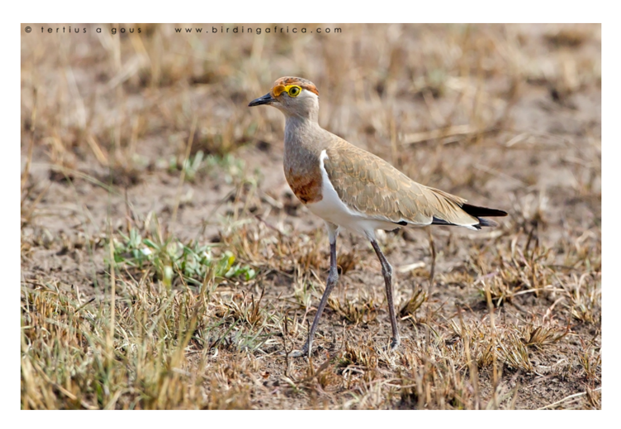
Wryneck, White-headed Barbet and more Brown-chested Lapwings were enjoyed before nightfall, and Swamp Nightjar and African Wood Owl after dark!

It was now time to turn our attention back to forests...this time at Bwindi Impenetrable National Park, starting at "The Neck". Here birding started off slowly, but the pace picked up as it warmed up. Ansorge's Greenbul was again seen here, excellent views were obtained of the localised Grey-headed Sunbird and we enjoyed good looks at Many-coloured Bushshrike. Other goodies included Scarce Swift, Red-tailed Greenbul, Grey Apalis, Black-throated Apalis, Olive-green Camaroptera, Dusky-blue Flycatcher, Black Sparrowhawk and a splash of colour was added by more Black Bee-eaters. After a productive stint at "The Neck" we climbed to the higher altitudes of the Ruhija sector, arriving in time for an introductory birding stroll in late afternoon. Conditions were perfect – sunny and still – and we enjoyed an excellent hour with Ruwenzori Apalis, Mountain Masked Apalis, Red-faced Woodland Warblers, Yellow-streaked Greenbul, Grauer's Warbler, White-tailed Blue Flycatcher, White-eyed Slaty Flycatcher, Stripe-breasted Tit, Ruwenzori Batis, Grey Cuckooshrike, Mountain Illadopsis and lovely Regal Sunbird, species with which we would become well acquainted over the following week.