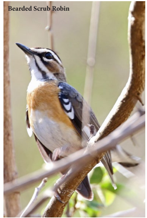
Bearded Scrub Robin