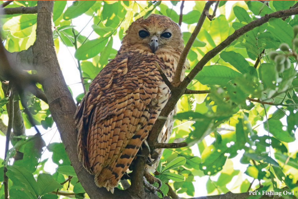
Pel's Fishing Owl