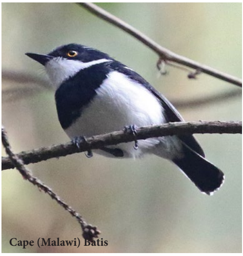
Cape (Malawi) Batis