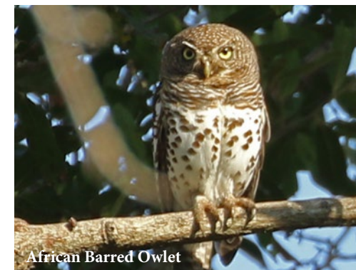
African Barred Owlet