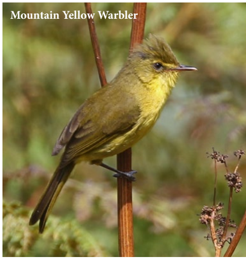
Mountain Yellow Warbler