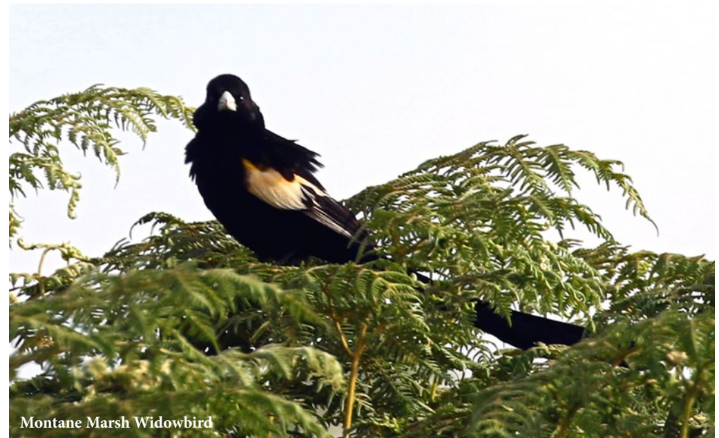
Montane Marsh Widowbird

The next morning we were up just before sunrise, listening to the buzz of an African Broadbill. As the sky lightened we spotted a Southern Mountain Greenbul/Black-browed Greenbul nearby and enjoyed some good views. After some toing and froing we finally found African Broadbill displaying, and on the edge of a Eucalyptus plantation also found Placid Greenbul , Southern Citril , Red-throated Twinspot , Forest Double-collared Sunbird and White-starred Robin . Around the nearby wetland birds were in the full swing of breeding, with Lesser Swamp Warbler , African Yellow Warbler and Broad-tailed Warbler/Fan-tailed Grassbird showing well. African Black Duck swam on the dam and after a little bit of patience we enjoyed terrific views of a male Red-chested Flufftail and a brief sighting of African Rail , before returning to the lodge for a hearty breakfast. We were sorry that our time at Luwawa had already come to an end and it was time to continue to Nyika.