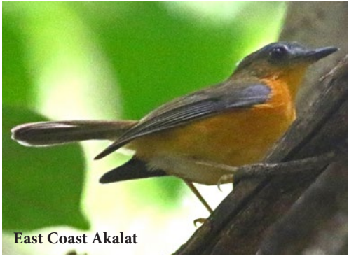
East Coast Akalat