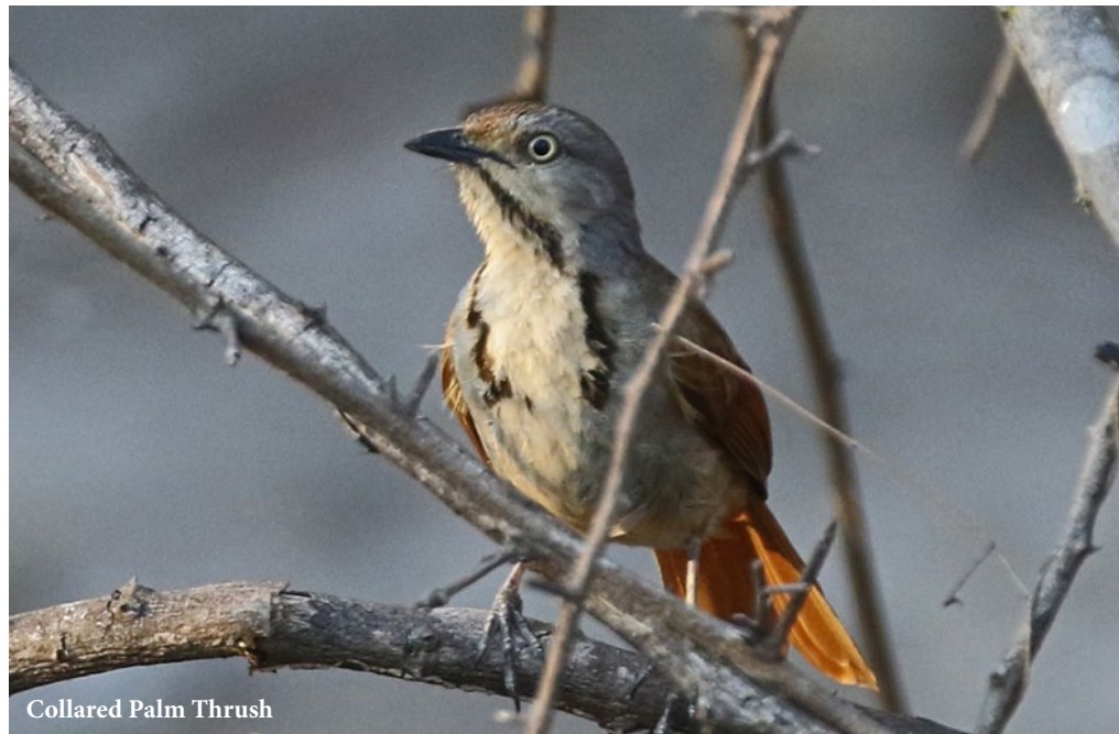
Collared Palm Thrush