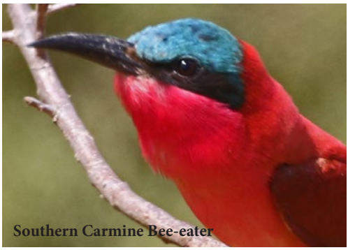
Southern Carmine Bee-eater