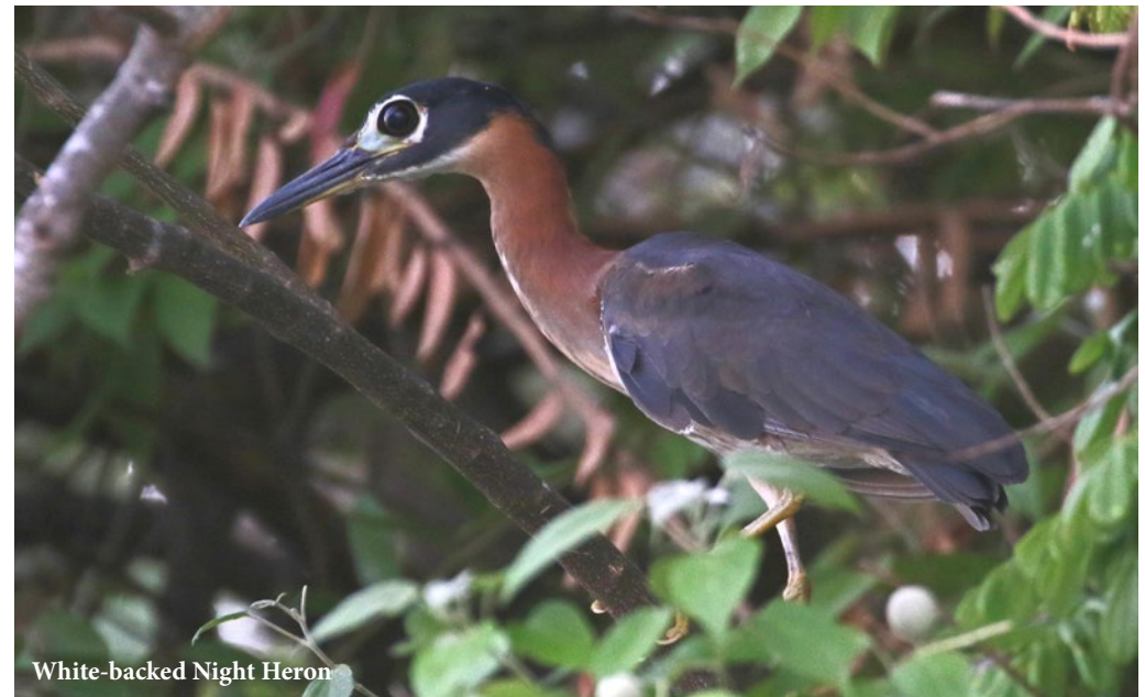
White-backed Night Heron

Continuing south we paused for lunch surrounded by some rocky hillsides with Mocking Cliff Chat , with the final stop of the day at Mukwadzi Forest, where we were treated to some superb views of East Coast Akalat and managed to lure Green Malkoha/Green Yellowbill from its tangles. Black Sparrowhawk was seen here too. From there it was a longish drive to our overnight accommodation on Lake Malawi, where the wind was now blowing a gale and even moving between our rooms and the restaurant was unpleasant due to beach sand being blown into our eyes.