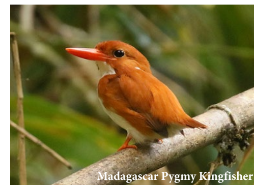
Madagascar Pygmy Kingfisher

23 Nov: Outing to Anakao and Nosy Ve, before flight to Antananarivo.