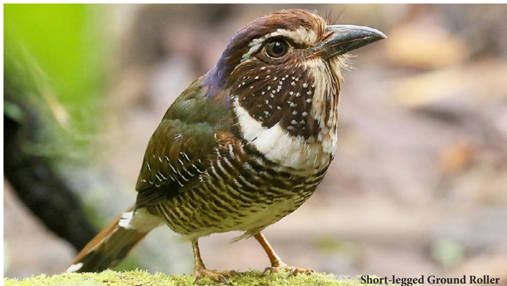
Short-legged Ground Roller

Our comprehensive 2017 Madagascar Tour once again showcased Madagascar's best birds and wildlife in just 15 days, with an optional week spent at Masoala at the start. During this time we enjoyed good views of almost all available endemic birds. Among the 189 species logged were all five species of ground roller, all three mesites, all species of vanga and all ten couas.