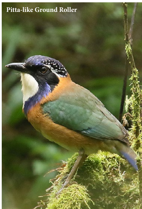
Pitta-like Ground Roller

rainforest introduction. During lunch we watched Chabert Vanga , Ward's Vanga and Madagascar Starling , followed by a short but productive walk in the reserve to admire Collared Nightjar on its day roost, plus Nuthatch Vanga , Indri and Eastern Woolly Lemur . After gate closing we found Madagascar Long-eared Owl and Rainforest Scops Owl on their day roosts before the rain set in and we headed for our lodge.