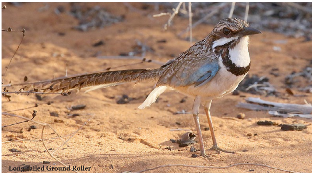
Long-tailed Ground Roller

Madagascar Wagtail Motacilla flaviventris – Common and widespread