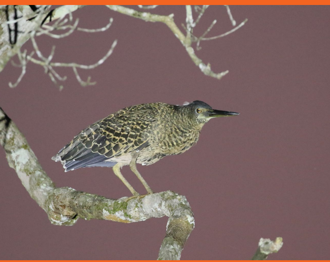
White-crested Tiger Heron