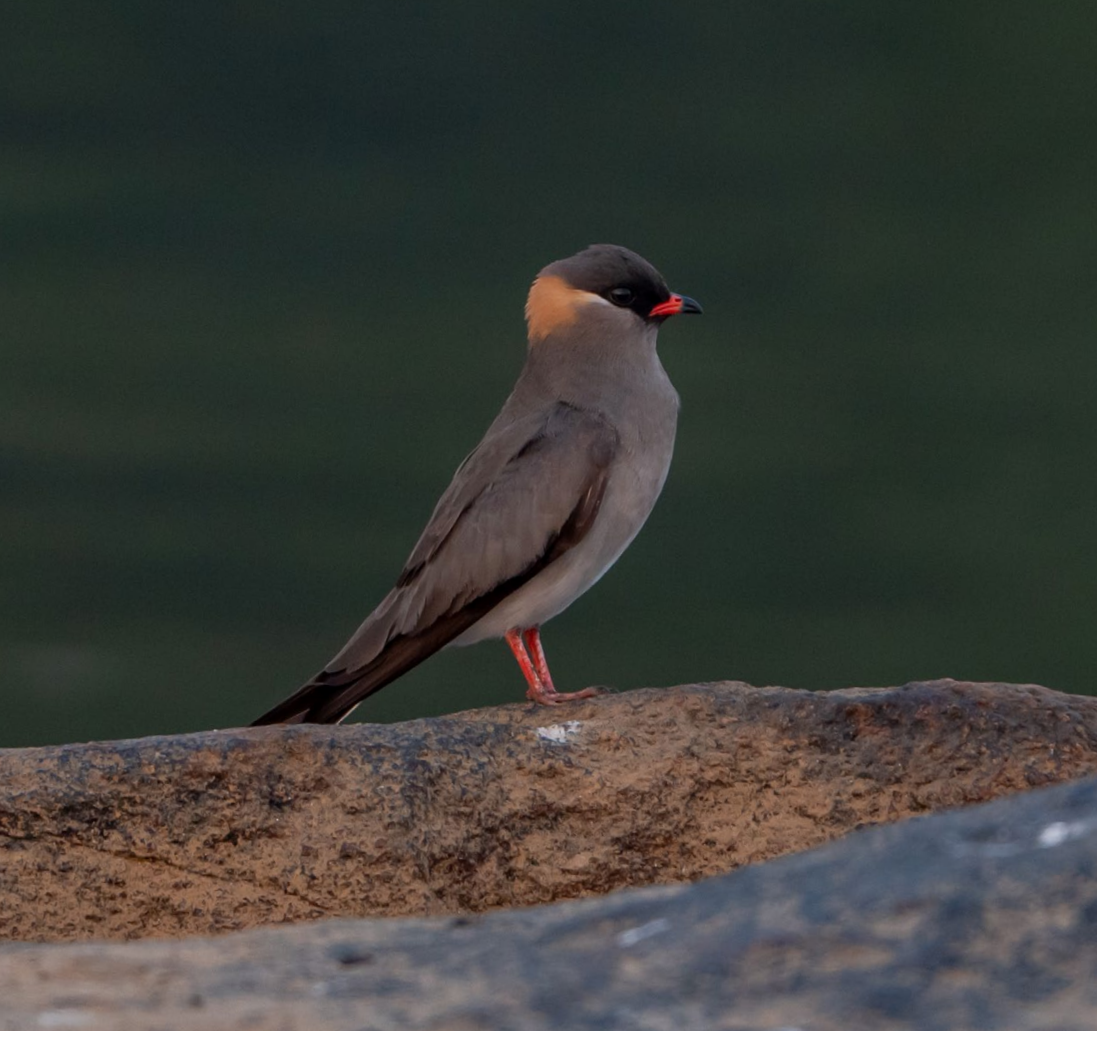
Rock Pratincole

Willcocks's Honeyguide, Brown-cheeked Hornbill, Rufous-winged Illadopsis, Timneh Parrot and an incredible Latham's Forest Francolin on its roost.