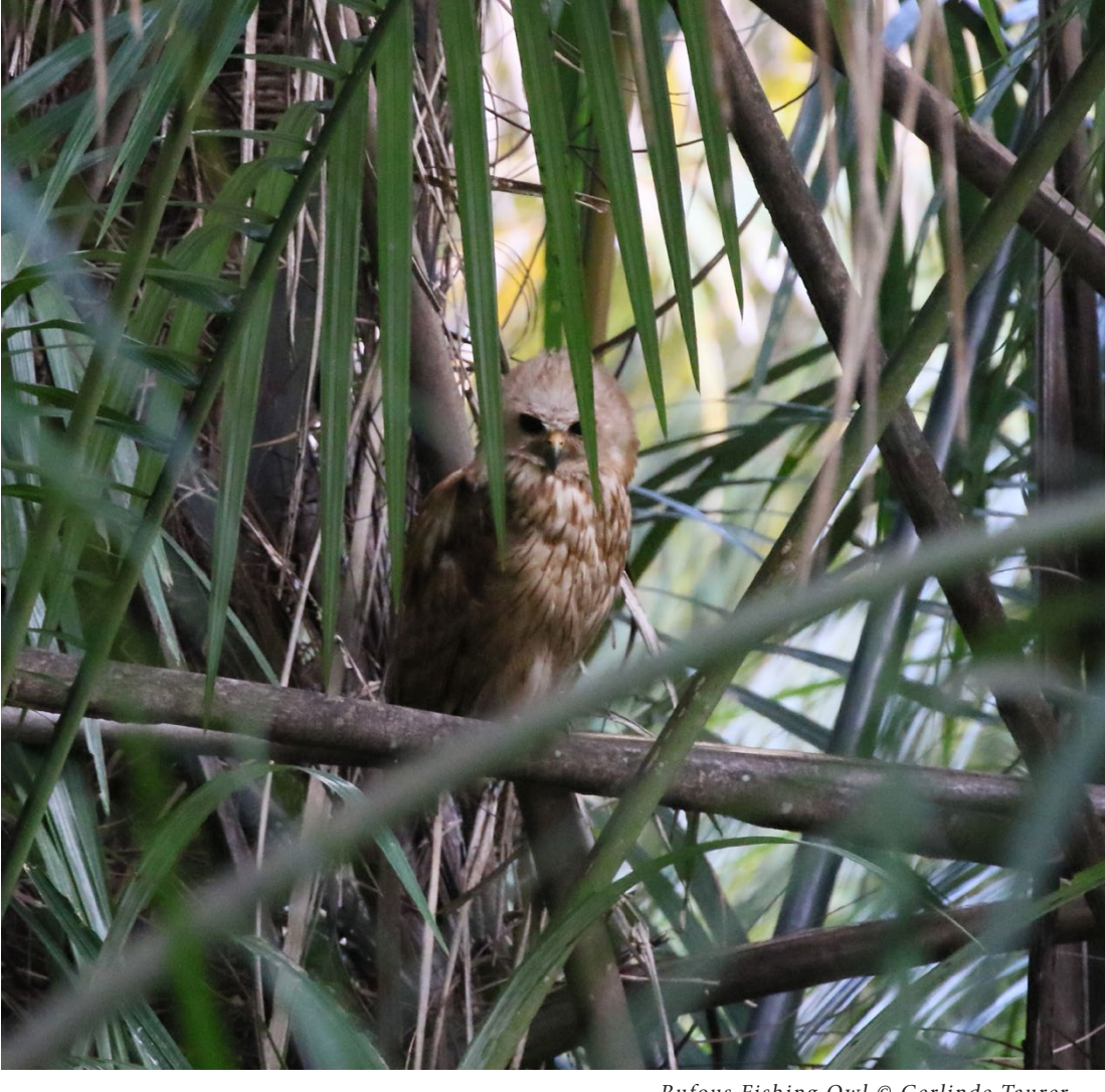
Rufous Fishing Owl

faced Quail-Finch, Black-backed Cisticola, Forbes's Plover and Grasshopper Buzzard.