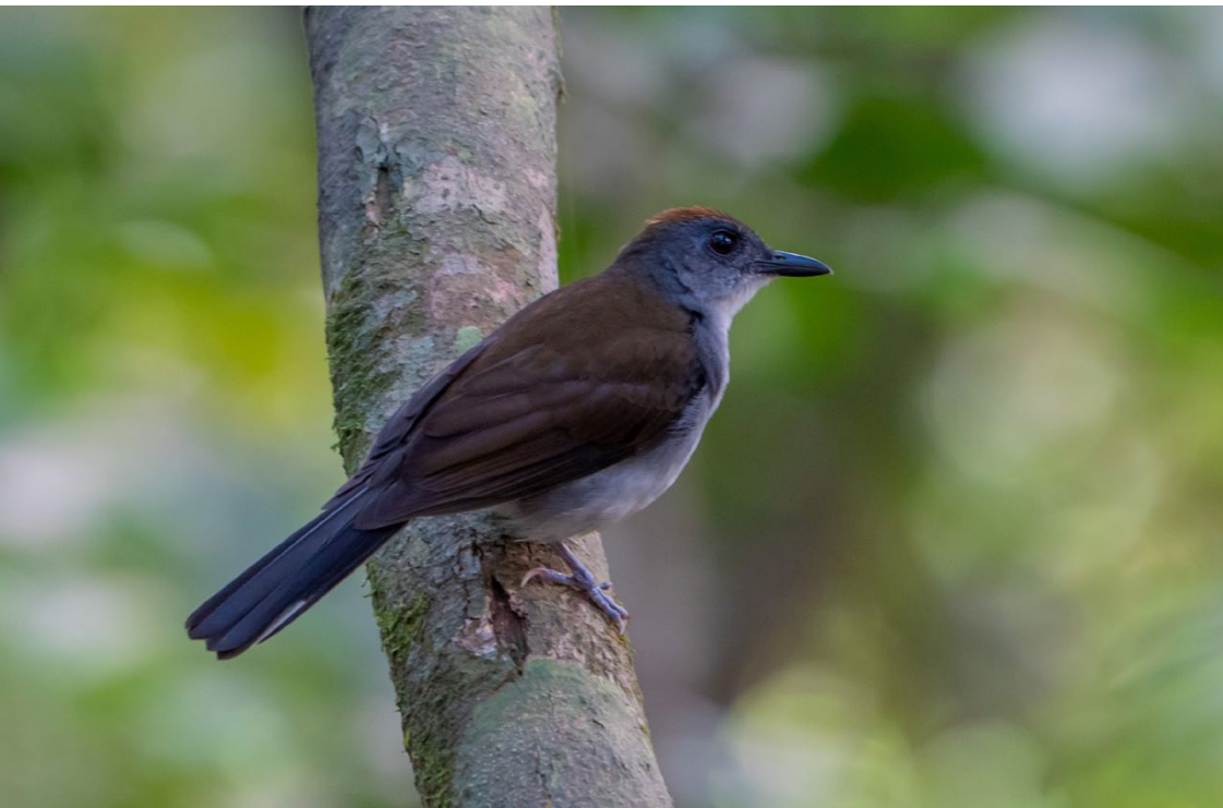
Blackcap Illadopsis and Rufous-winged Illadopsis