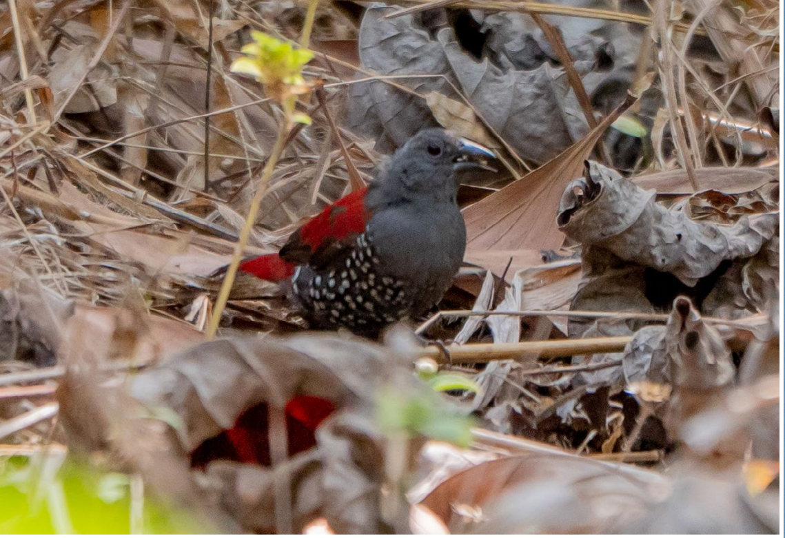
Dybowski's Twinspot, Western Bearded Greenbul and Black Spinetail