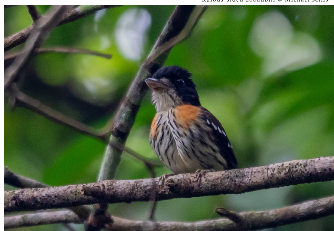
Rufous-sided Broadbill

moustached Bee-eater, West African Batis, Double-toothed Barbet, Black Bee-eater, Cassin's Honeybird, Fire-bellied Woodpecker, Melancholy Woodpecker, Rufous-sided Broadbill, Fiery-breasted Bushshrike, Manycoloured Bushshrike, Sabine's Puffback, Red-billed Helmetshrike, Purple-throated Cuckooshrike, Blue Cuckooshrike, Western Square-tailed Drongo, Western Bearded Greenbul, Yellow-bearded Greenbul, Lemon-bellied Crombec, Chestnut-capped Flycatcher, Tit Hylia, Black-capped Apalis, Sharpe's Apalis, Rufous-crowned Eremomela, Compact Weaver, Black-capped Apalis, Vieillot's Barbet, Ussher's Flycatcher, Yellowchinned Sunbird, Johanna's Sunbird, Kemp's Longbill, Red-vented Malimbe, an excellent encounter with Yellow-footed Honeyguide, Western Least Honeyguide, and Long-billed Pipit, before it was time to head back to Monrovia for the end of the tour. A wetland not far from the city held quite a few African Pygmy Goose, plus Allen's Gallinule and Orange Weaver, before we bade our farewells to West Africa.