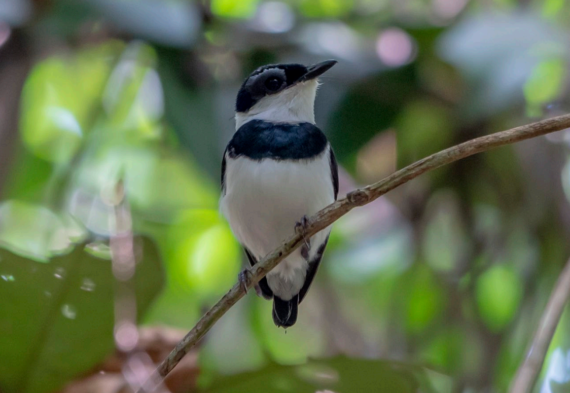
West African Wattle-eye (above) and Oriole Warbler (below)