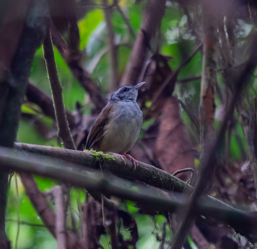
Blackcap Illadopsis

The next day we easily crossed the land border into Sierra Leone, and by the late afternoon we were settled into our accommodation on Tiwai island and found ourselves out on canoes on the Moa River. It didn't take long before we came face-to-face with our main target, the fantastic Rufous Fishing Owl, on its roost in a dense grove of palm trees. The pressure was off, and we could now enjoy the great variety of birds that were on offer. After dark we struck out on the various trails, finding Nkulengu Rail on its roost, followed by an incredible