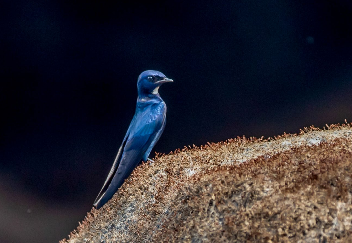
White-throated Blue Swallow and Hairy-breasted Barbet © Don MacGilliray