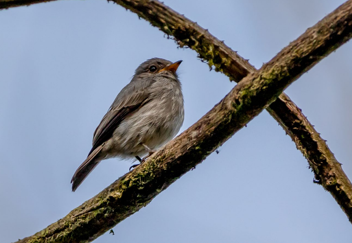
Little Grey Flycatcher, Olive-bellied Sunbird and Nimba Flycatcher