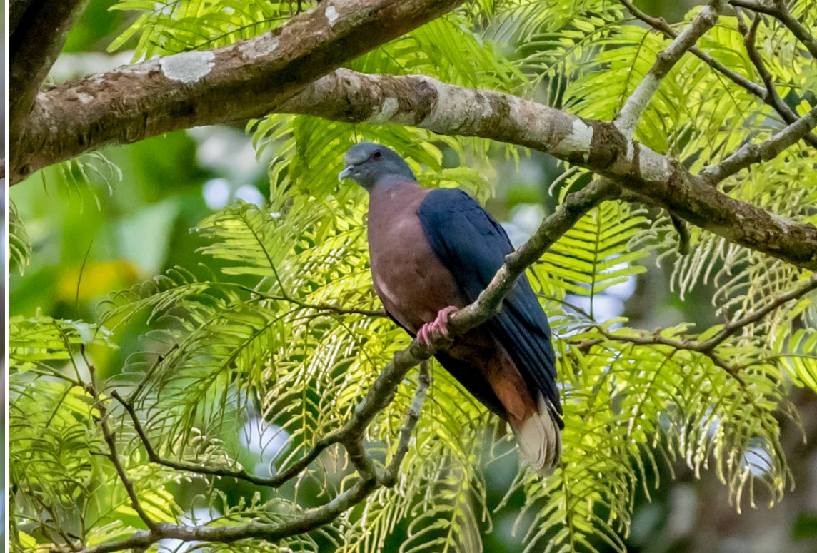
Western Bronze-naped Pigeon and Egyptian Plover