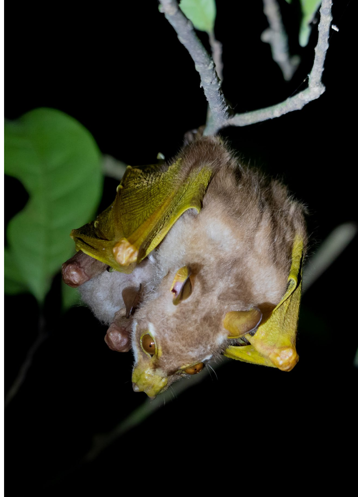
Black-backed Cisticola (above) and Pohle's Fruit Bat (right)

Red-winged Warbler and Gosling's Bunting, before moving onto Freetown for the end of the tour, finding Black-faced Quail-Finch, Grasshopper Buzzard and Turati's Boubou at roadside stops. At Freetown the golf