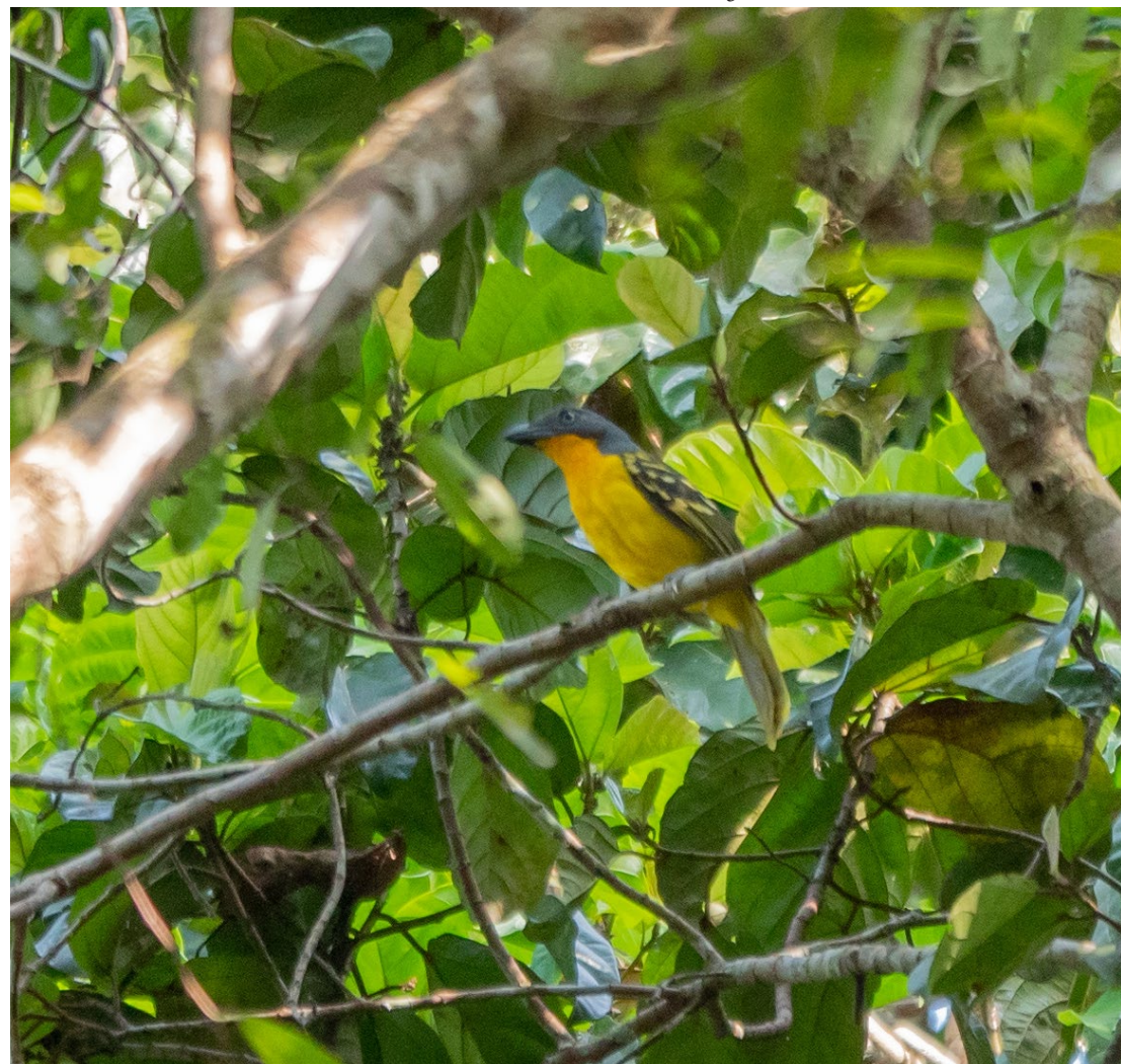
Lagden's Bushshrike

Birding the next day at Bumbuna was very productive, with more Cameroon Indigobirds, a single male Jambandu Indigobird, full-plumaged Togo Paradise Whydah and Emerald Starling among the highlights. Here too we found Yellow-winged Pytilia, Fanti Saw-wing, Melodious Warbler,