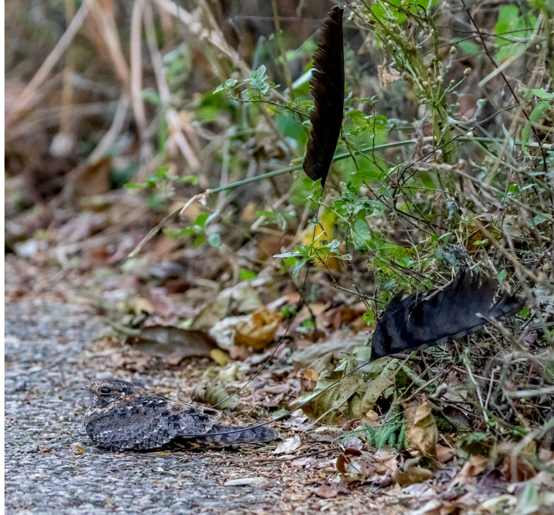
Standard-winged Nightjar

A strong supporting cast of other birds at Nimba included Forest Wood Hoopoe, Buff-throated Sunbird, Standard-winged Nightjar, Cassin's Hawk-Eagle, Long-tailed Hawk, Western Bronze-naped Pigeon, Blue-headed Wood Dove, Brown-cheeked Hornbill, Blue-moustached Bee-eater,