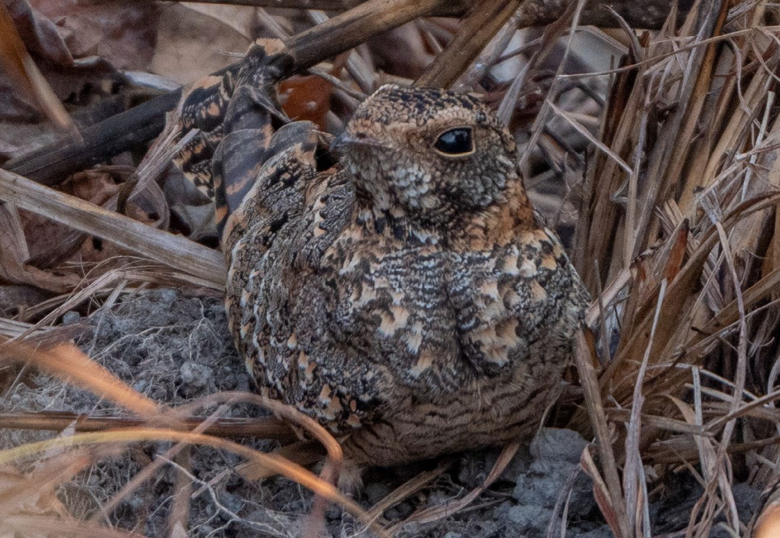
Standard-winged Nightjar (above) and Jambandu Indigobird (below)