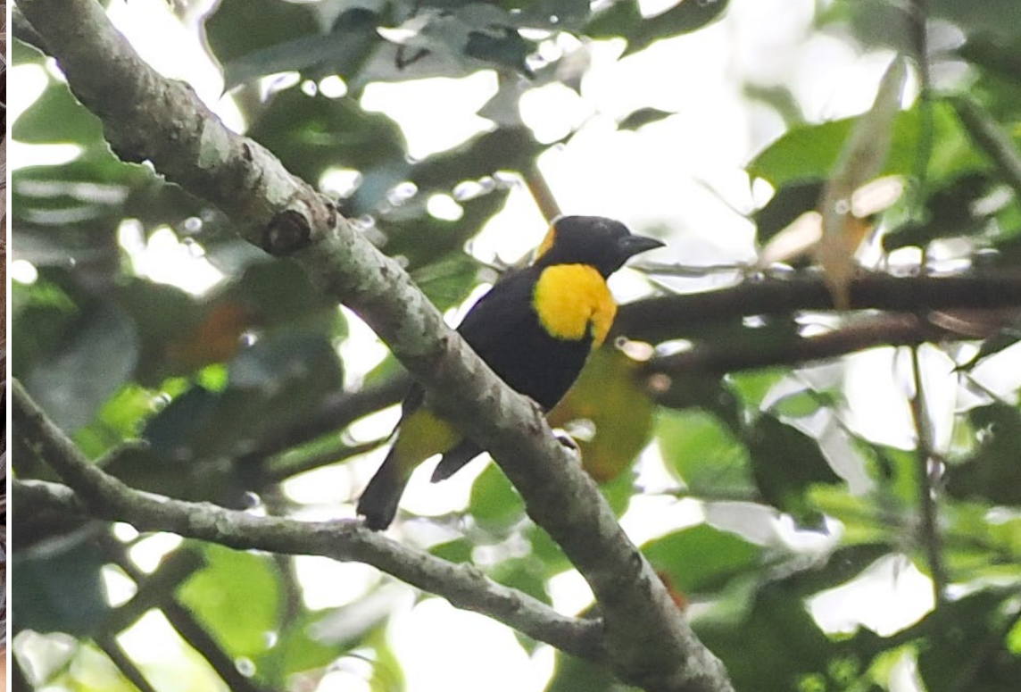
Gola Malimbe (above) and Turati's Boubou (below)