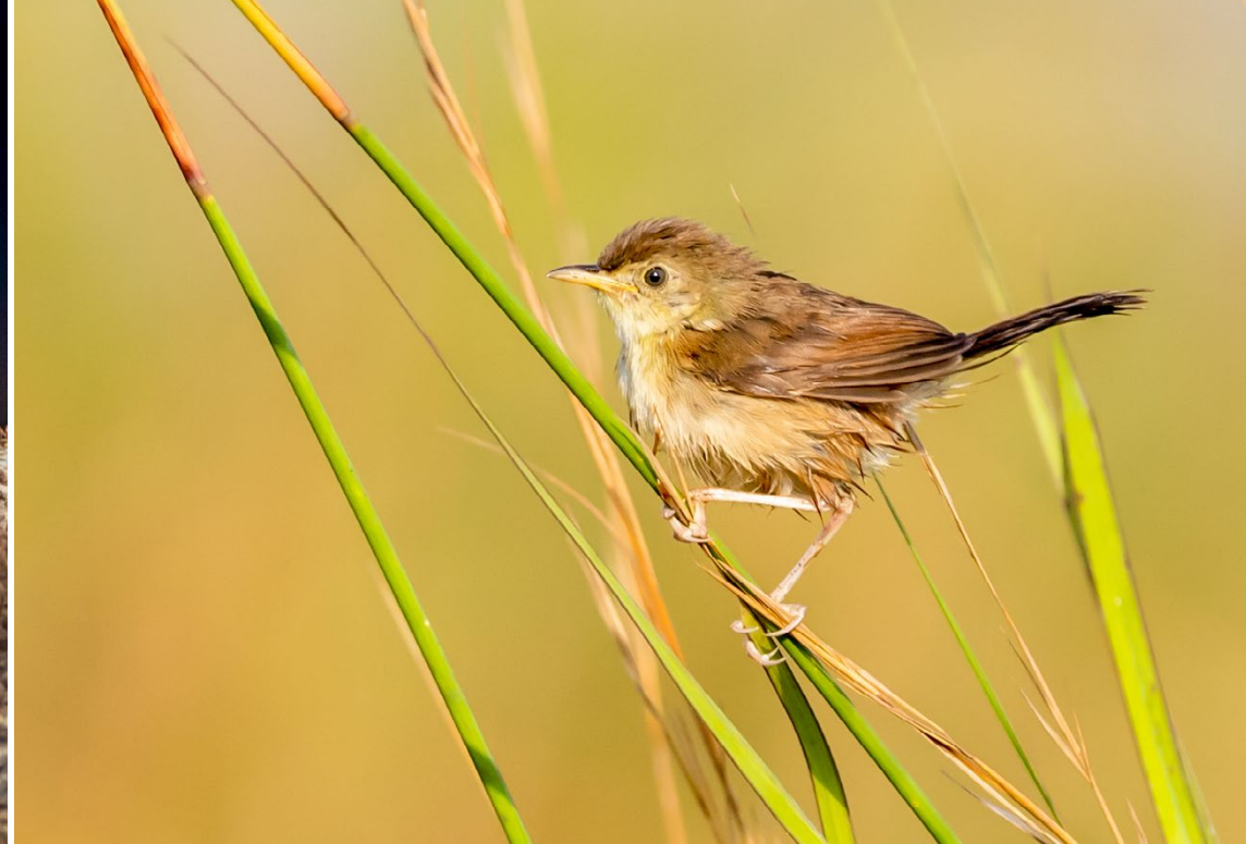
Short-winged Cisticola and Blue-moustached Bee-eater