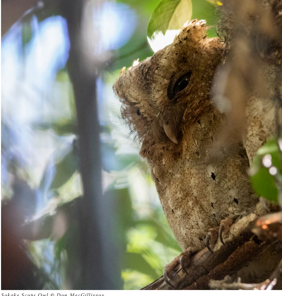
Sokoke Scops Owl

Mammals recorded are as follows: Golden-rumped Elephant Shrew, Southern Tree Hyrax, Bush Hyrax, Savanna Elephant, Senegal Lesser Galago, Smalleared Bushbaby (heard only), Sykes's Monkey, Vervet Monkey, Olive Baboon, Yellow Baboon, Black-and-white Colobus, Unstriped Ground Squirrel, Ochre Bush Squirrel, Red Bush Squirrel, Cheetah, Caracal, Lion, Common Genet, Common Dwarf Mongoose, White-tailed Mongoose, Spotted Hyaena, Black-backed Jackal, African Wild Dog, Bat-eared Fox, Honey Badger, Plains Zebra, White