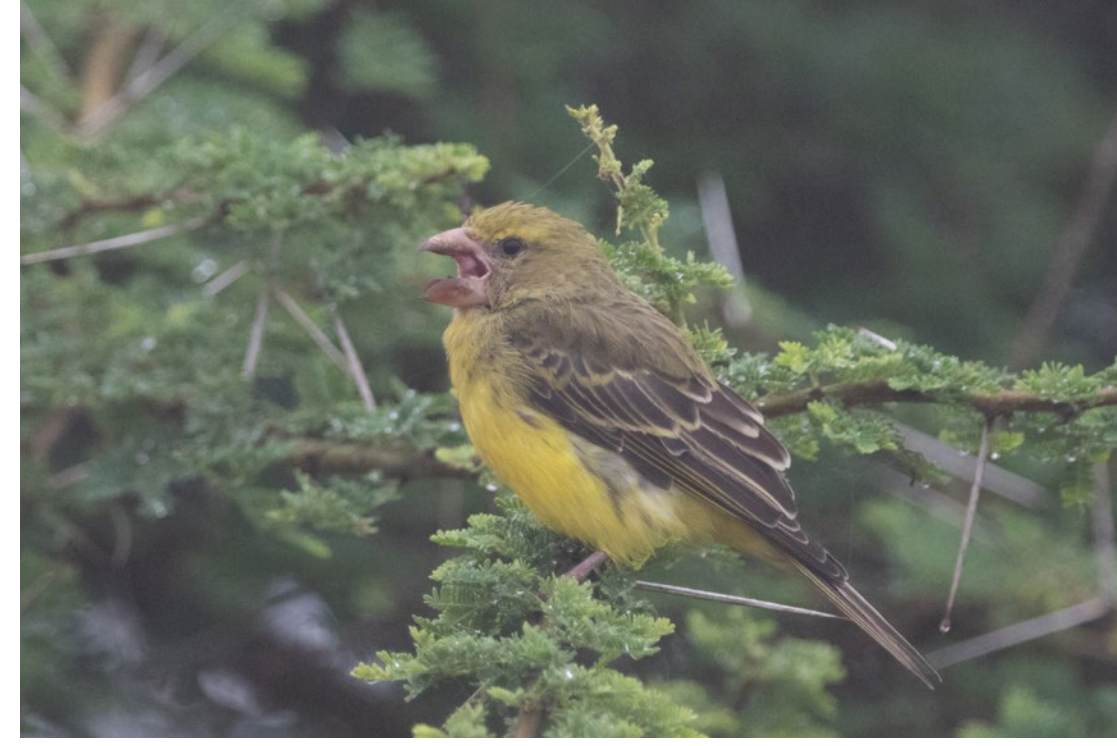
Southern Grosbeak-Canary

White-bellied Tit and Red-faced Crombec as the best sightings.