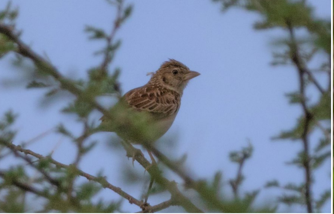
Friedmann's Lark (above)