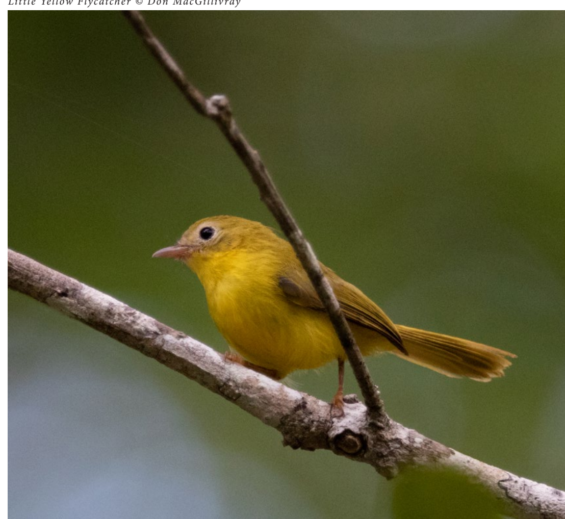
Little Yellow Flycatcher

sunny morning in the forest. New birds came thick and fast, and included Scaly Francolin, Kikuyu White-eye, White-eyed Slaty Flycatcher, Hartlaub's Turaco, Olive-breasted Mountain Greenbul, Yellow-whiskered Greenbul, Placid Greenbul, Grev Cuckooshrike, Black-fronted Bushshrike, African Hill Babbler, Grey Apalis, Chestnut-throated Apalis, Black-throated Apalis, Black-collared Apalis, Thick-billed Seedeater, Eastern Double-collared Sunbird, Northern Double-collared Sunbird, White-browed Crombec, Mountain Oriole, Evergreen Forest Warbler, Brown Woodland Warbler, White-tailed Crested Flycatcher, Fine-banded Woodpecker, and a lovely male Bar-tailed Trogon. Moustached Green Tinkerbird was hard to spot against the pale sky.