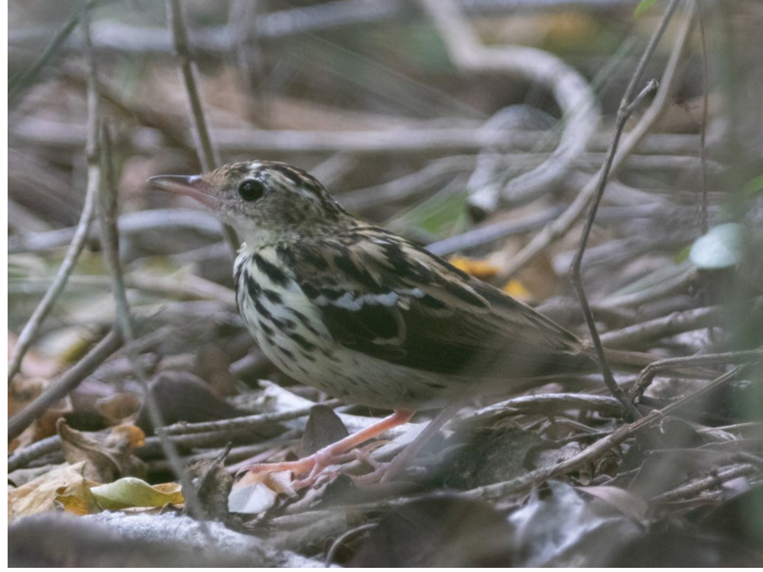
Sokoke Pipit