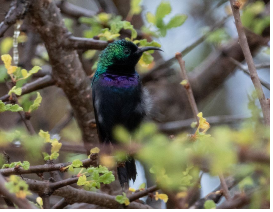
Tsavo Sunbird

The next two days we concentrated our efforts on the numerous forest birds for which Sokoke is famous. On the first morning we started off briskly with good views of Amani Sunbird, Little Yellow Flycatcher, Forest Batis, fly-over Sokoke Pipit, Black-headed Apalis and Chestnut-fronted Helmetshrike. A single Kenya Crested Guineafowl briefly crossed the track. Several flocks of Kilifi Weaver passed overhead, but it was only later in the morning that we managed to track down a fast-moving foraging flock of weavers. It took quite some time, but eventually we all obtained good views of a loose flock of weavers foraging among a much bigger bird party, including several males in breeding plumage. Other good birds over the morning included Mombasa Woodpecker (notable for being Matthew's 1600th African tick), Retz's Helmetshrike, Eastern Green Tinkerbird, Green Barbet, Southern Banded Snake Eagle, Fischer's Greenbul and Pale Batis. A quiet afternoon session