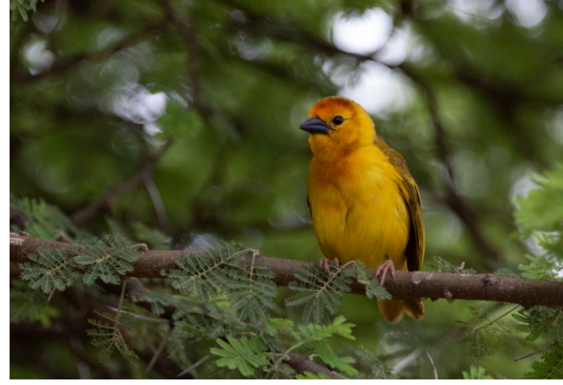
Taveta Golden Weaver

and arriving at Tsavo East it was apparent that the good rains received in Tsavo West had not made it across the Taita Hills; most of the area was parched! Birding was much slower than at Tsavo West, and for much of the time it was quite windy, but with patience and persistence we added several sought-after birds to our tally. Top of the list was several groups of Somali Bee-eater, with other highlights including Somali Courser, Yellow-vented Eremomela, Black-headed Lapwing, Acacia Tit, Golden Pipit, a male Fire-fronted Bishop coming into breeding plumage, Goldenbreasted Starlings, Chestnut-headed Sparrow-Lark, Singing Bush Lark, Parrot-billed Sparrow, Eastern Crombec, Taita Fiscal, African Silverbill, Somali Ostrich and more Pangani Longclaws. The biggest surprise of the trip came here in the form of a male Violet-breasted Sunbird, which seemed a bit out of range although birds have been recorded to wander. Our first sighting of the sunbird was in the late afternoon, but it didn't sit well with me so we returned the next morning to confirm all the salient features, and good views were obtained to rule our other possibilities.