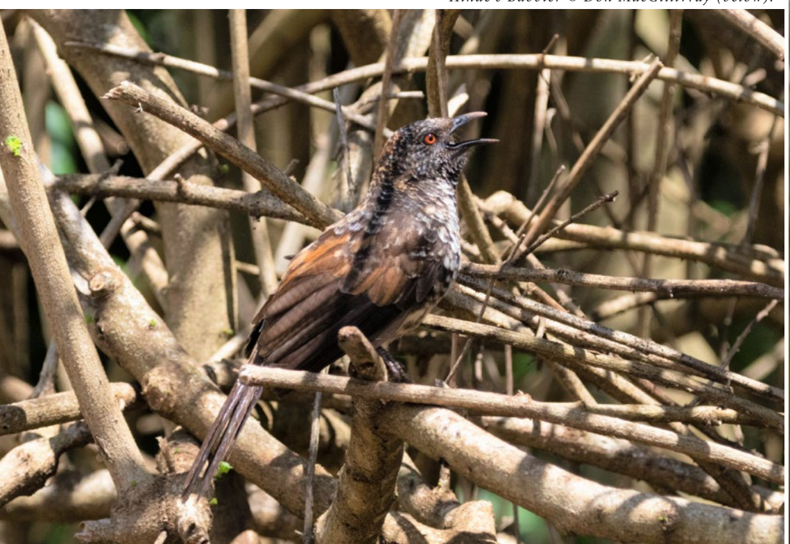
Hinde's Babbler (below).