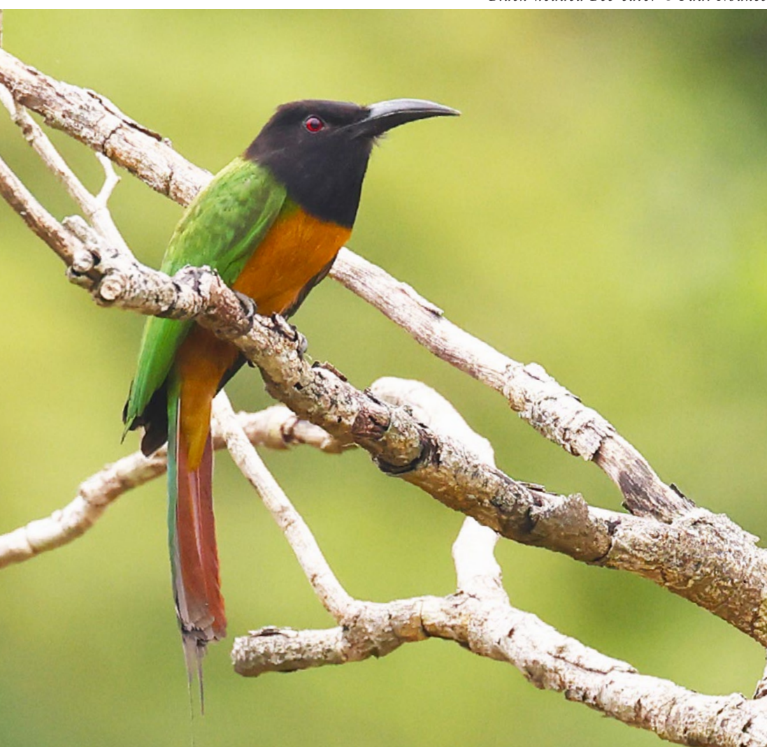
Black-headed Bee-eater

rain abated. Carmelite Sunbird was seen in the trees lining the beach, Ruddy Turnstone fed on the rocky shore and African Royal Tern fed offshore. After lunch we headed to some nearby patches of forest. The Congo Serpent Eagle I'd seen the day before didn't materialise, but we did find Rosy Bee-eater, Thick-billed Honeyguide, Blue-throated Roller, Hairy-breasted Barbet, Red-headed Quelea, Orange-cheeked Waxbill, Chattering Cisticola, and a variety of more widespread species, before heading back to town for dinner.