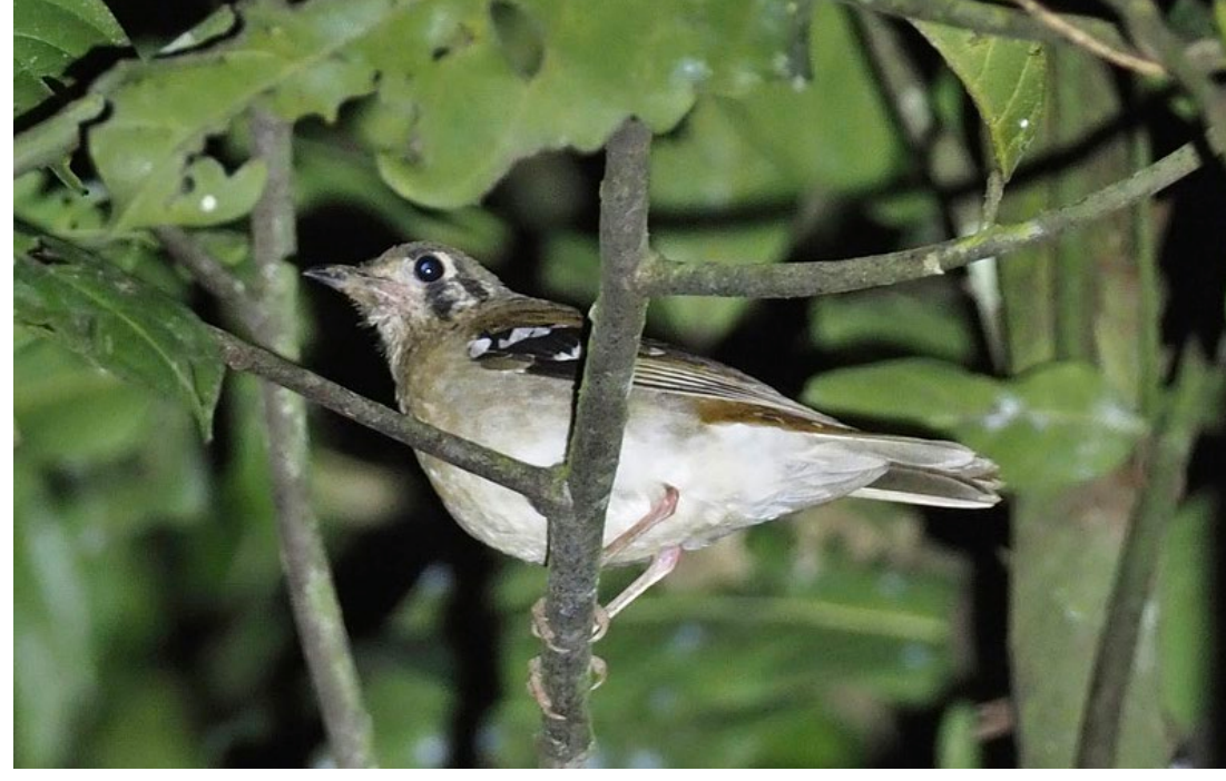
Roosting Grey Ground Thrush

Our next major focus was Ipassa Research Station in the Ivindo National Park, with Forbes's Plover, Black-faced Canary and Little Grey Flycatcher along the way. At Ipassa we immersed ourselves in forest birding, amassing a remarkable list that included six of our top ten, plus Rachel's Malimbe, Yellow-footed Flycatcher, Yellow-throated Cuckoo, African Piculet, Woodhouse's Antpecker, Rufous-sided Broadbill, Blue-headed Wood Dove, Gosling's Apalis, Sjöstedt's Honeyguide Greenbul, Gabon Batis, White-spotted Wattle-eye, Rufoussided Broadbill, Akun Eagle-Owl, Brown Nightjar and Fraser's Eagle-Owl, with Spot-breasted Ibis and African Olive Ibis seen briefly. Next was Lope National Park where we quickly located the localised Dja River Warbler and enjoyed Fiery-breasted Bushshrike and Rufous-bellied Helmetshrike. To end, we made our way to Loango National Park on the coast, seeing Grey Pratincole on route and finding Latham's Forest Francolin, Loango Weaver, Rosy Bee-eater, Hartlaub's Duck, White-backed Night Heron, Congo Serpent Eagle, White-crested Hornbill, Spotted Honeyguide, Black Coucal, Damara Tern, White-throated Blue Swallow, Thick-billed Cuckoo and Violet-tailed Sunbird.