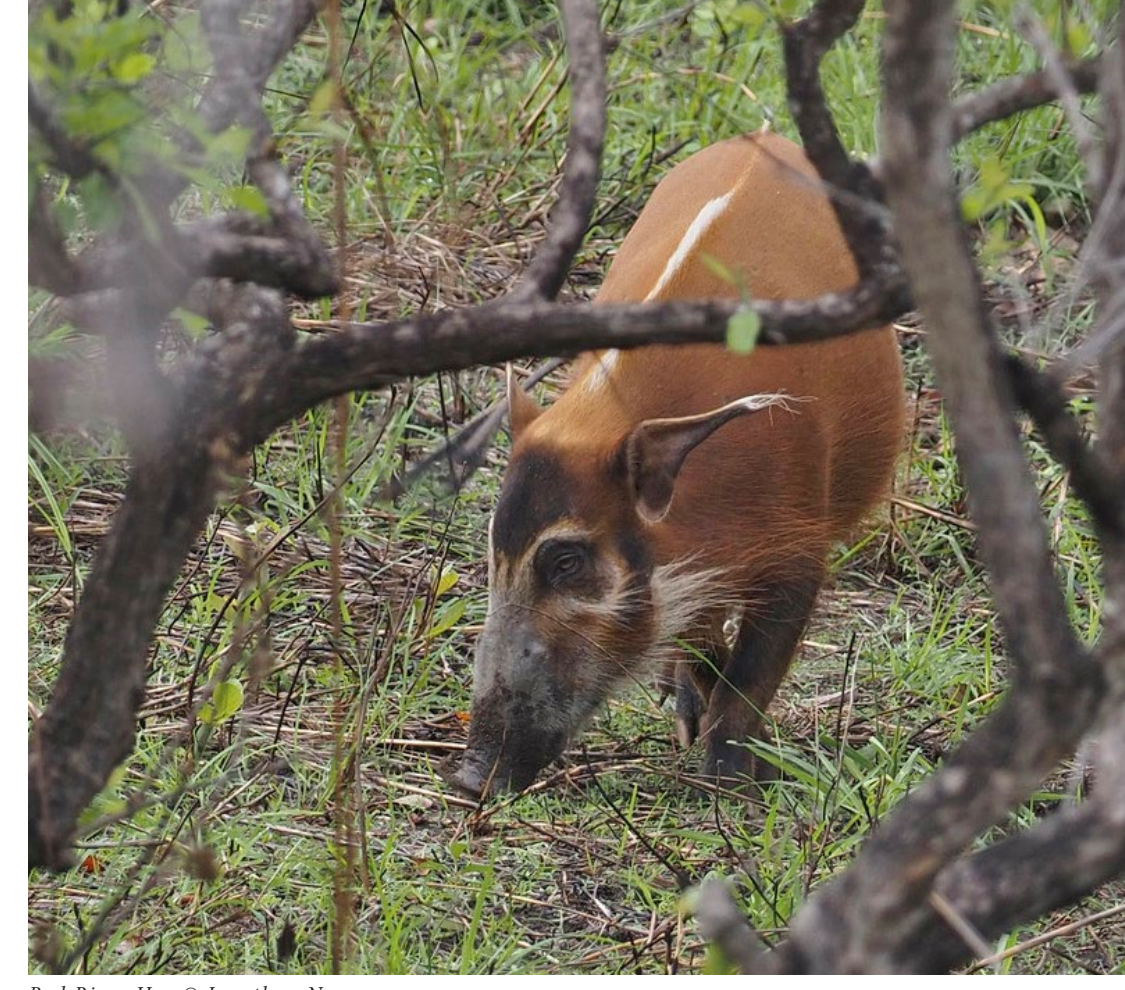
Red River Hog

on the train to Lope for a 90-minute ride, and finishing our night in the comfortable Lope Hotel. After a slightly later start than usual we made our first foray into the park, driving through the rolling, grass-covered hills with scattered forest patches, pausing for Forest Elephant, Red River Hog and Forest Buffalo adorned with Yellow-billed Oxpecker. Our destination was a small swamp in the forest, where the scarce Dja River Warbler was seen well shortly after getting there. In the surrounding grasslands we found Broad-tailed Warbler, Blue-breasted Bee-eater and African Pygmy Kingfisher, and in the forests a Fierybreasted Bushshrike remained well hidden. We returned to town for lunch and a much-deserved siesta, before heading out in the late afternoon.