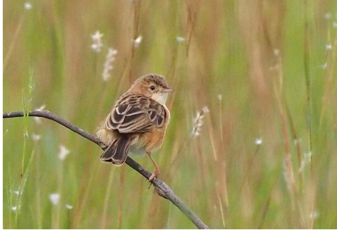
Dambo Cisticola

The next morning we spent in grasslands and stunted woodlands, and around dense forest patches. The weather was gloomy and rain sent us back to town for an earlier-than-anticipated breakfast, but we managed to lose very little birding time. The undoubted highlights of the morning were a pair of Black-chinned Weavers near their nest, several Short-tailed Pipits, and, after much persistence, a showy Gorgeous Bushshrike. Breeding-plumaged Yellow-mantled Widowbird was found, as were Western Blackheaded Batis, Black Saw-wing, Salvadori's Eremomela, Long-legged Pipit, Sooty Chat, Flappet Lark and Cabanis's Bunting. After lunch we headed further afield, in a different direction, to search for Dambo Cisticola, which we were pleased to find pretty quickly. Other birds seen during the afternoon included Temminck's Courser, Whitewinged Black Tit, Yellow-bellied Hyliota, Rufousnaped Lark, Double-toothed Barbet, White-bellied Bustard, Banded Martin and Senegal Lapwing. At the forest edge we enticed an Olive Long-tailed Cuckoo out for several good flight views, and spotted a Johanna's Sunbird feeding down at eye