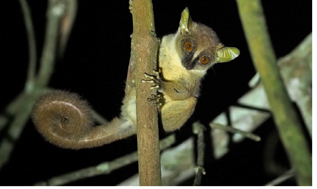
Demidoff's Galago

The next morning we enjoyed a little bit of a lie in before making the bumpy journey to Makokou. While we waited for the drivers to get organised, we watched Black-faced Canary and Senegal Coucal in the hotel gardens, and Forbes's Plover on a nearby football field. To make the drive to Makokou more comfortable we made regular roadside stops, seeing Black-casqued Hornbill, Eastern Piping Hornbill, Black-headed Waxbill, Little Grey Flycatcher, Purple-throated Cuckooshrike and Lowland Masked Apalis. We arrived in Makokou to discover that our hotel rooms had been given away, and that all other decent hotels in town were fully booked due to a Gabon Parcs conference. Instead of staying in Makokou overnight, we had an early dinner in town before heading to nearby Ipassa Research Station one night early. We decided to make the most of a trying day, heading out for a short night walk. Not far down the track a young bird was spotted roosting above the path. The size, shape and white wing bars led us to believe that it was a ground thrush, an exciting find. We searched around nearby and also found an adult, confirming that it was indeed a Grey Ground Thrush! We manoeuvred ourselves into a good position and all enjoyed incredible views of this major rarity;