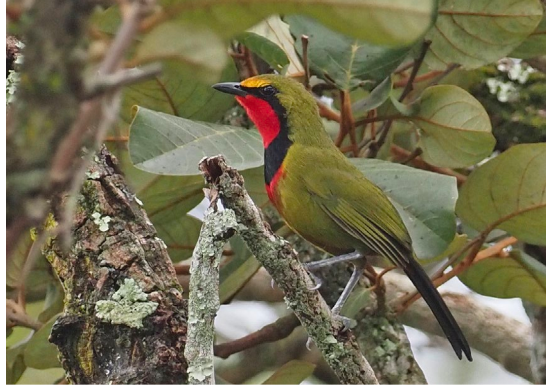
Gorgeous Bushshrike

Before breakfast the next day we enjoyed excellent views of Reichenbach's Sunbird in the hotel gardens. Shortly after breakfast we were back at the airport, this time to board an internal flight to Franceville in the south-east of the country. As we descended over the forest-savanna mosaics to land. it felt as though we were now well and truly in Gabon. We transferred to our comfortable hotel in town for lunch, before heading out to some nearby forest patches for a stint of afternoon birding. Bird activity was pretty good; we found our only Bristle-nosed Barbets of the trip at our first stop, followed by Black-shouldered Puffback, Squaretailed Saw-wing, Eastern Yellow-billed Barbet and Red-throated Cliff Swallow. The greatest interest was provided by a red-and-black finch feeding in tall grass on the verge of the road. The full red head immediately led me to identify the bird as a male Black-bellied Seedcracker, and I put the bird in the scope and stepped back for everyone to enjoy the views. It was partially obscured, but as it moved about my intrigue grew as I noticed that the tail appeared to be black. The tail of Black-bellied