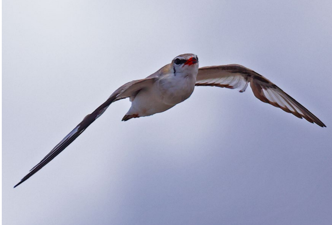
Grey Pratincole (above) and Loango Weaver