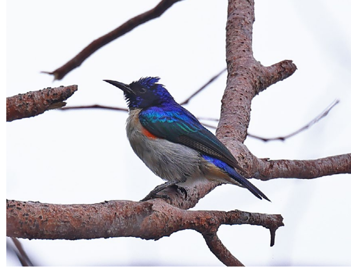
Violet-tailed Sunbird

The next three and a half days were spent exploring the waterways, savannas and forests of this spectacular area, which impressed with both birds and mammals. From the deck of our lodge we spotted Thick-billed Cuckoo, Violet-tailed Sunbird, many Rosy Bee-eater and a pair of mating African River Martins. The waterways produced numbers of Hartlaub's Duck, Sabine's Spinetail, African Finfoot, Shining-blue Kingfisher, Whitebacked Night Heron, Goliath Heron, Great White Pelican, Pink-backed Pelican, Western Osprey, White-throated Blue Swallow, Cassin's Flycatcher, White-browed Forest Flycatcher, Rosy Bee-eater, Violet-tailed Sunbird and Red-capped Mangabey, and good views of Red-tailed Leaflove and Western Sitatunga. Ten Damara Tern were spotted along the coast, alongside a single Gull-billed Tern. However, the undoubted highlights were incredible views of the secretive White-crested Tiger Heron, a baby and mother Water Chevrotain, Slender-snouted