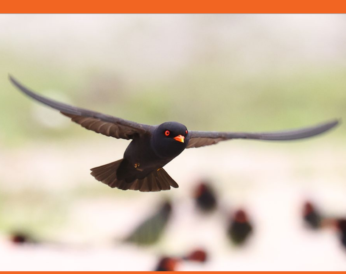
African River Martin