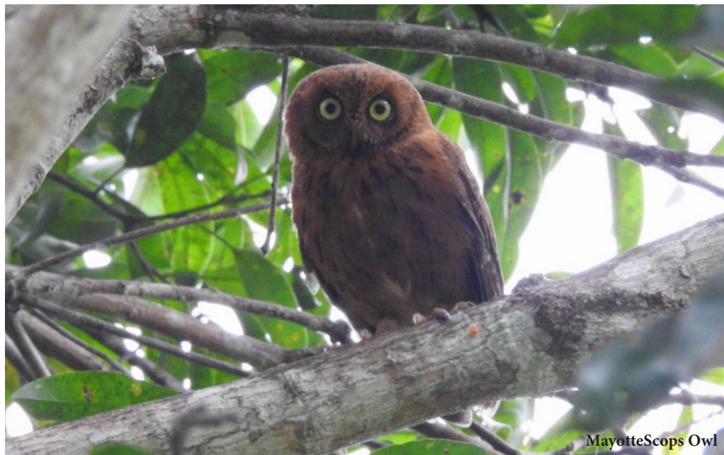
Mayotte Scops Owl

Our first tour to the fascinating islands of Comoros was a resounding success. With airlines behaving well we had no trouble finding all the endemic birds, which included four terrific scops owls.