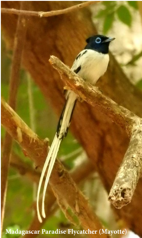
Madagascar Paradise Flycatcher (Mayotte)