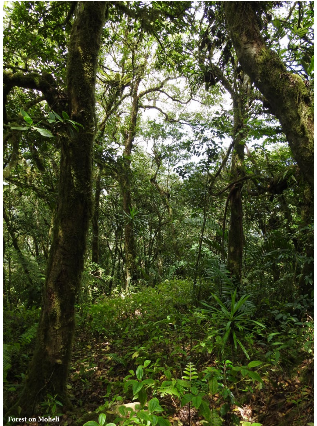
Forest on Moheli