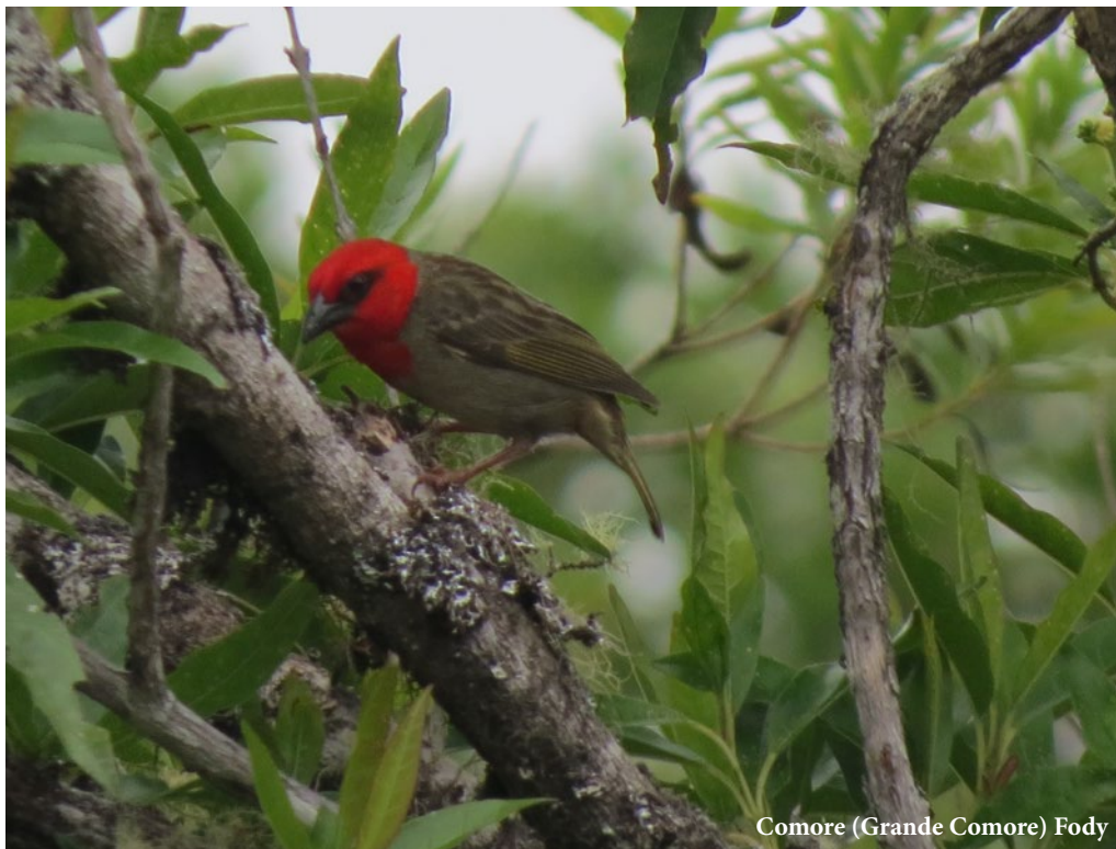
Comore (Grande Comore) Fody

eight Madagascar Pond Herons . After breakfast Pointe Mahabo turned up a single male Comoro Fody , plus improved sightings of Mayotte Sunbird and Mayotte White-eye . Two white-phase male Madagascar Paradise Flycatchers were seen too, and Madagascar Turtle Dove showed well. Then it was back to Pic Combani for a relaxed afternoon with repeat views of most of the endemics and a perched male Cuckoo Roller .