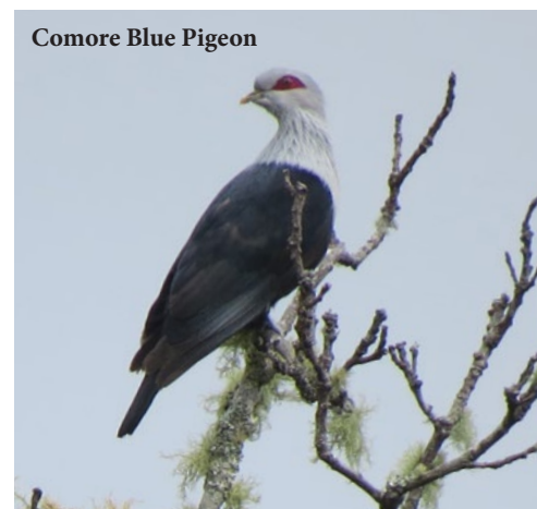
Comore Blue Pigeon

Comoros Fody E Foudia eminentissima anjuanensis ESS – a few good sightings of males in the highlands of Anjouan