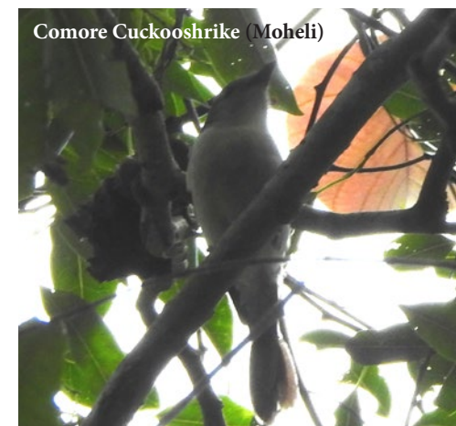
Comore Cuckooshrike (Moheli)