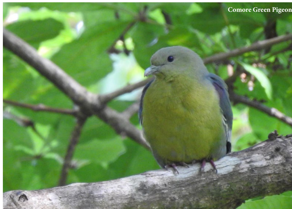
Comore Green Pigeon

Arriving in the Salimani area, the first endemics were evident around us as soon as we stepped out of the car. Both the attractive Comoro Blue Pigeon and Comoro Olive Pigeon were studied in the scope within a few minutes, and a noisy Lesser Vasa Parrot , much browner and smaller and sounding quite different from its Madagascan counterpart, was watched feeding on some fruit. Madagascar Paradise Flycatcher put in its first appearance, and a Grande Comore Brush Warbler was seen briefly in some dense thickets. Both Kirk's White-eye and Humblot's Sunbird were common, and we enjoyed good views of Madagascar Green Sunbird and Greater Vasa Parrot too. Exploring further afield we finally found Grande Comore Drongo on three occasions, and enjoyed some excellent views of this rare species. By now it was starting to warm up, so we decided to head back to the hotel to catch up on sleep before making an afternoon outing above Moroni in some degraded forest and farmland, which turned up Cuckoo Roller and Frances's Sparrowhawk .