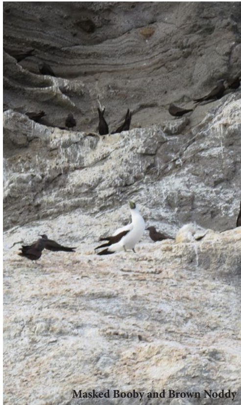
Masked Booby and Brown Noddy