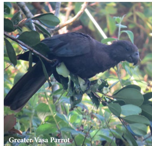
Greater Vasa Parrot

Comoro Bulbuls were seen, and lower down two parties of Humblot's Flycatchers and Comoro Thrush . Arriving back in camp we had a short rest before watching Madagascar Spinetail flit around the treetops, and once it was dark a short walk up the road produced excellent views of Karthala Scops Owl , our final endemic of the trip! Camping was reasonably comfortable and the next morning we again tracked down Humblot's Flycatcher , Madagascar Paradise Flycatcher , Lesser Vasa Parrot and Comoro Cuckooshrike , before walking back down to the vehicle. A double flat tyre delayed our return to Moroni slightly, but a quick phone call sent another taxi and we were soon back in our hotel resting up for our flight home.