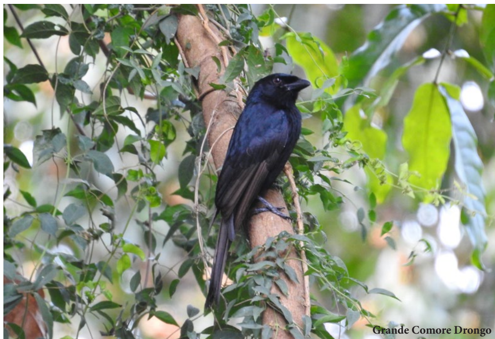
Grande Comore Drongo

Our flight from Nairobi deposited us on Grande Comore Island in the wee hours of the morning, and we headed straight to our comfortable hotel to grab a few hours of sleep. After a later-than-normal start the next day we headed off to some lower-altitude forests in the Salimani area at the south-western foot of Mt Karthala, where our main aim was the rare Grande Comore Drongo, the only Grande Comore endemic not usually seen on Mt Karthala. En route we passed by some coastal wetlands where we were surprised to see Great Egrets on the rocky shoreline, where one would normally expect to see Dimorphic Egret; a trend repeated throughout the islands.