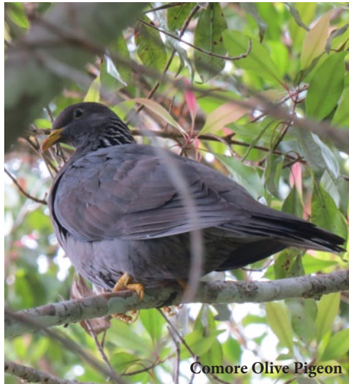
Comore Olive Pigeon