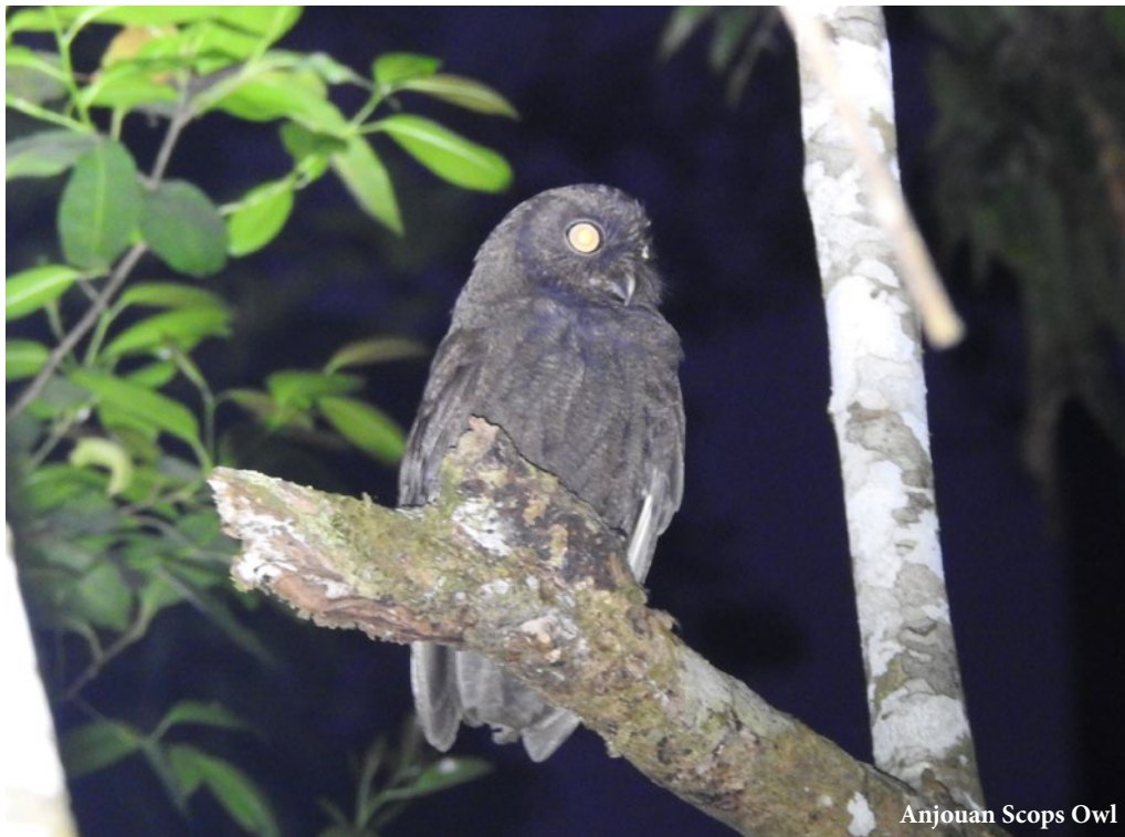
Anjouan Scops Owl

On arrival in Anjouan we were struck by the large numbers of people and more aggressive atmosphere, especially on the road; it certainly was our least favourite island, although the scenery was spectacular. After popping into our beachside hotel we dropped off bags and headed out to a remote part of the island where some better forest patches were relatively accessible. It was a long and winding road across the mountainous interior, but when we arrived at our destination we were immediately rewarded with a male Comoro Fody and a party of Crested Drongo . Anjouan Sunbirds were evident, and Greater Vasa Parrots and Comoro Blue Pigeons easy to see. As the sun set we positioned ourselves in the known territory of a pair of scops owls, and after a short bout of playback a pair of Anjouan Scops Owl flew in and landed beside us. They were quite excitable and moved around a lot, but we obtained several excellent views of them, the darkest and plainest of the Comoros scops owls. We arrived back at the hotel a couple of hours later, tired but very satisfied.