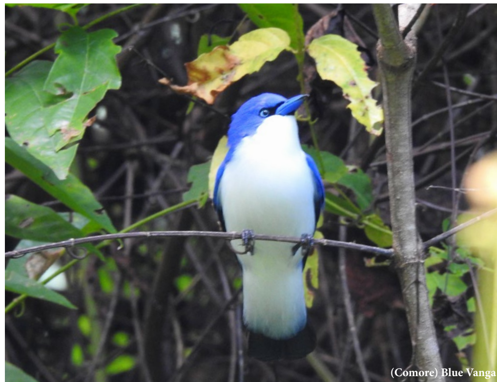
(Comore) Blue Vanga