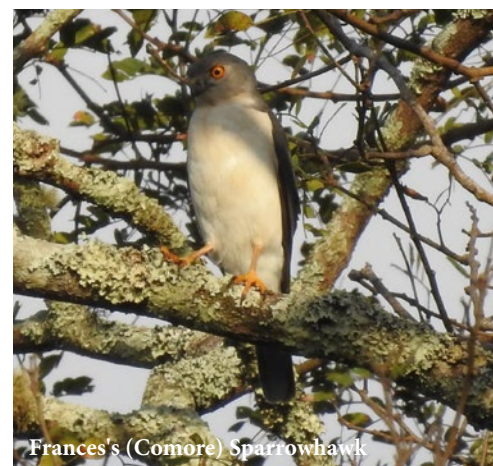
Frances's (Comore) Sparrowhawk