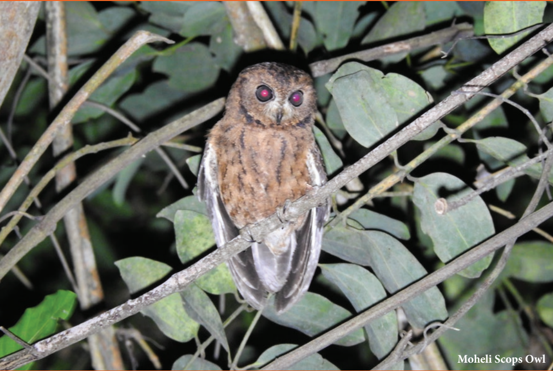
Moheli Scops Owl