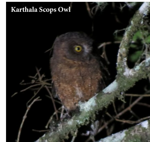
Karthala Scops Owl