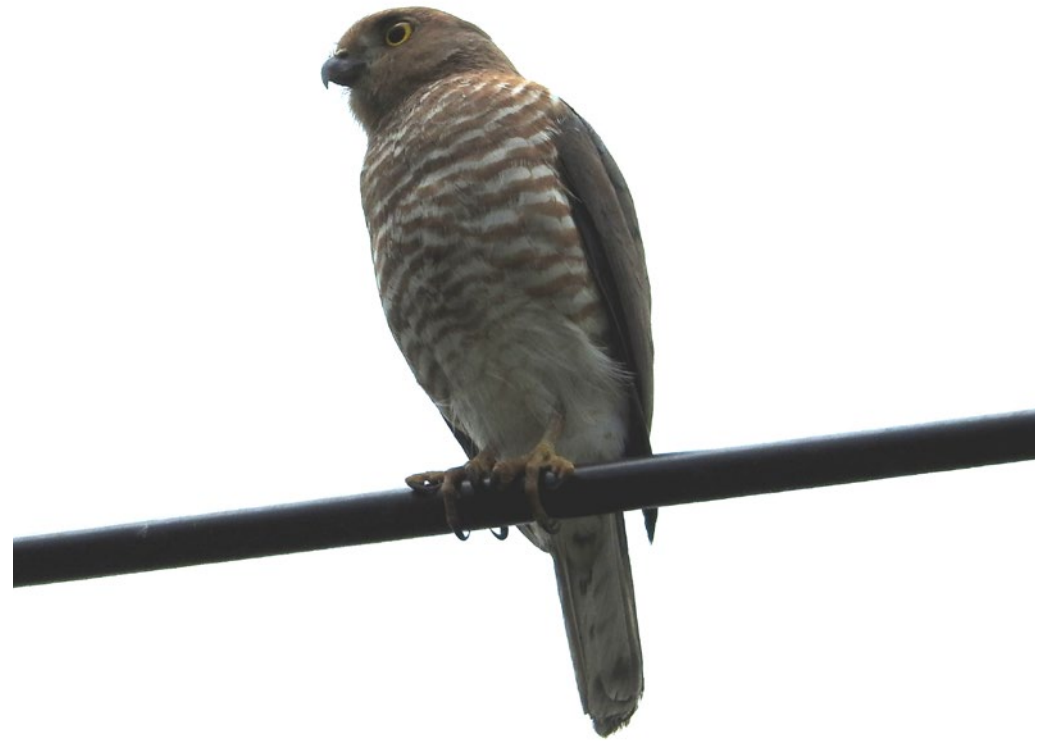
Frances's (Mayotte) Sparrowhawk

The next day was more relaxed, and we started off with some pre-breakfast birding in the highlands not far from our hotel. Several Comoros Thrushes showed well and we found Anjouan Brush Warbler and more Anjouan Sunbirds and Madagascar Turtle Doves . After breakfast we took a long drive along the coast, where we found a couple of Striated Herons and a lone Madagascar Malachite Kingfisher . A coastal wetland held several Common Moorhens , with young, and we noted their pure white undertails which meant that they did not belong to the expected Malagasy region subspecies. They were joined by a couple of Little Grebe and Common Greenshank . In the afternoon we returned to the forested area visited the previous day and this time quickly found our main targets still missing; a male Cuckoo Roller was watched on its perch for ages, and a male and two female Madagascar Paradise Flycatchers were seen well, before we returned to the hotel.