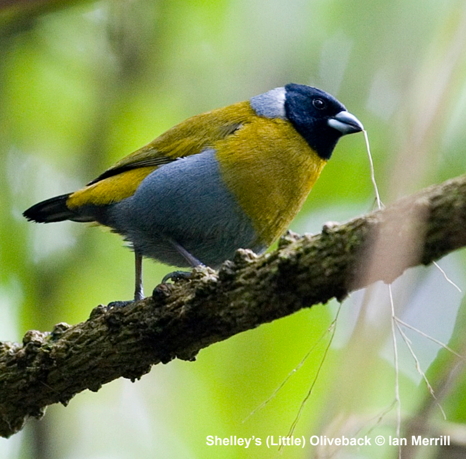
Shelley's (Little) Oliveback