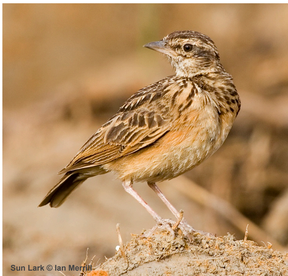
Sun Lark

After a welcome 9:30 breakfast, we took a walk around the crater lake. The undisturbed islands provide a safe roosting area for large numbers of Starlings, and we saw Purple, Splendid, Violet-backed, Bronzetailed, Wattled , and the stunning White-collared here. The dry scrubby areas below the ranch proved excellent for Estrildid Finches, attracted by the drinking pools in the heat of the day. Good