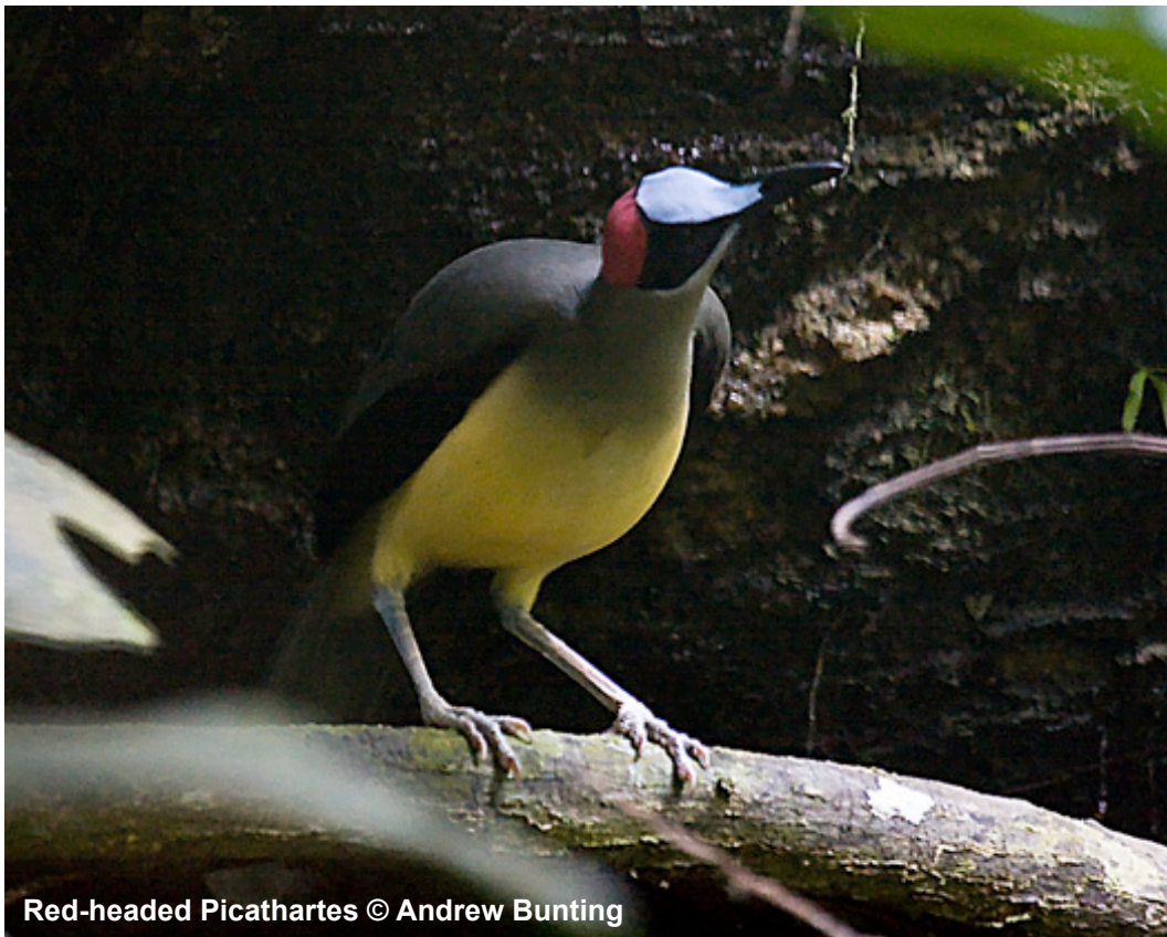
Red-headed Picathartes

On our final day in Cameroon, the group was divided in opinion as what to do, so we split the group. A couple of die-hards slogged up Shrike Trail, while the rest decided for a more relaxed and birdy amble along Nature Trail. Over the school campus we watched a Bat Hawk hunting at first light, before going our ways. The Shrike Trailers had not a sniff of Mount Kupe Bush Shrike, although the hard climb was well rewarded with superb views of Ursula's Sunbird feeding on a flowering plant in the under-storey; a male showed off its orange pectoral tufts, and even the iridescent blue flecks on the forehead were visible. In the mean time the Nature Trailers racked up a fine list of species, including Forest Swallow , Southern Hyliota , Luhder's Bush-Shrike , Preuss's Weaver and Western Bluebill . At midday we met back at base for lunch, before returning to Douala for our final dinner and checklist, and taking an evening flight back to Paris.