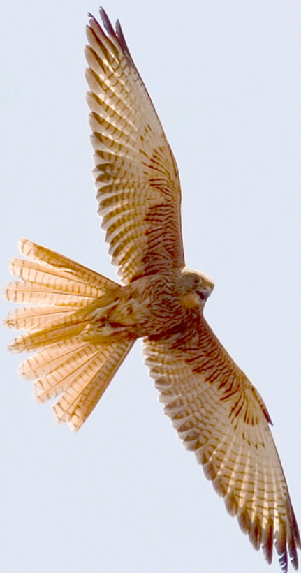
Fox Kestrel

With a day to kill we decided to try birding the tall woodland of the Adamawa Escarpment, about an hour from town. A few hours here in the morning were quite productive, although our previous success meant there were few new species. Notable were Adamawa Turtle Dove , Black Cuckoo (all-black, clamosus subspecies), an agitated White-bellied Tit , Red-headed Weaver , Lesser Blue-eared Starling , Dybowski's Twin-spot and Leaflove . Once the morning warmed up, raptors started soaring, and in a matter of 10 minutes we had displaying Crowned Eagle , Martial Eagle and a pair of African Hawk Eagles ! We spent a good while at a Red-throated Bee-eater colony on the way to town, where the Paparazzi managed to release some tension on the shutter buttons. A pair of Fox Kestrel also put on a good show, before it was back to down to the train station try again. Fortunately this time everything went