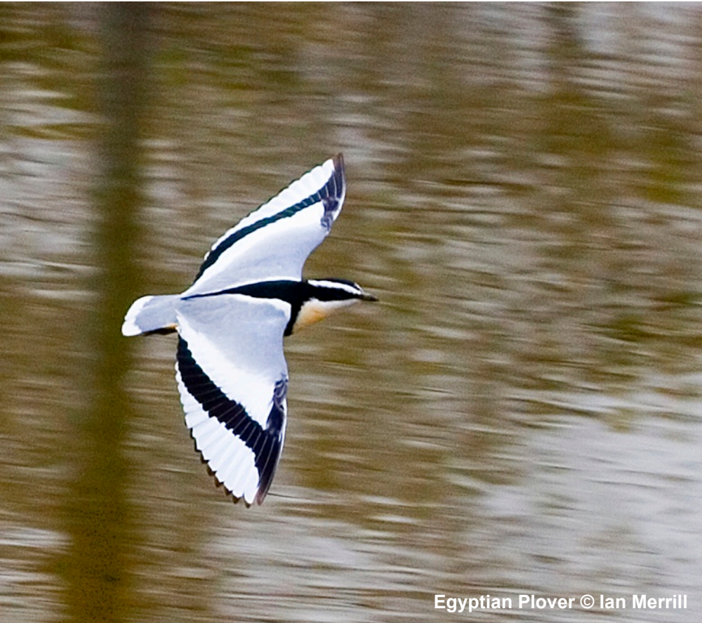
Egyptian Plover

slowed by a pair of Temminck's Courser in a bare field and a faulty starter motor. We eventually arrived at Campement du Buffle Noir after a long day on the road, quickly dumped the bags in our rooms and grabbed a well deserved ice cold drink. Just as some of us were relaxing Andy D stated reasonably calmly, 'there's two cats in the riverbed'. We quickly got the scopes on the distant shapes in the rapidly failing light but could just about make out the distinctive markings of a pair of Leopard. As a fitting finale to a great day we were just in time to spot African Scops Owl on the edge of camp before heading in for a much-deserved dinner.