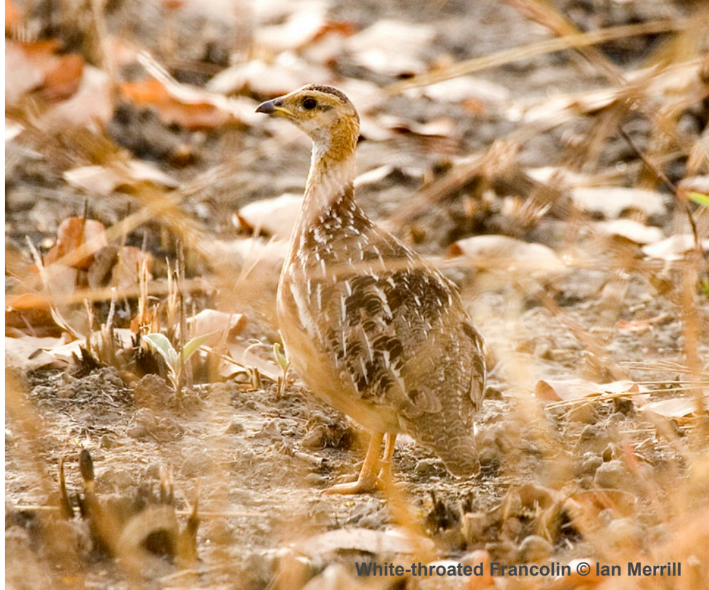
White-throated Francolin

peep. Fortunately we soon heard some birds calling not too far the road, and we hastily made our way towards them before they stopped calling, some of the group spotting Blue-bellied Roller as we made the dash. We had a fairly good idea of where they were, and carefully scanning quickly pinpointed their position about 100 m from us. They seemed reluctant to come closer, but we cautiously moved forward, managing to get within 20 m of a small covey of these fantastic birds. Further along the road we spotted White-breasted Cuckoo-Shrike , and the little-known trio, White-fronted Black Chat , Emin's Shrike (yes, again!) and Dorst's Cisticola before reaching the main road.