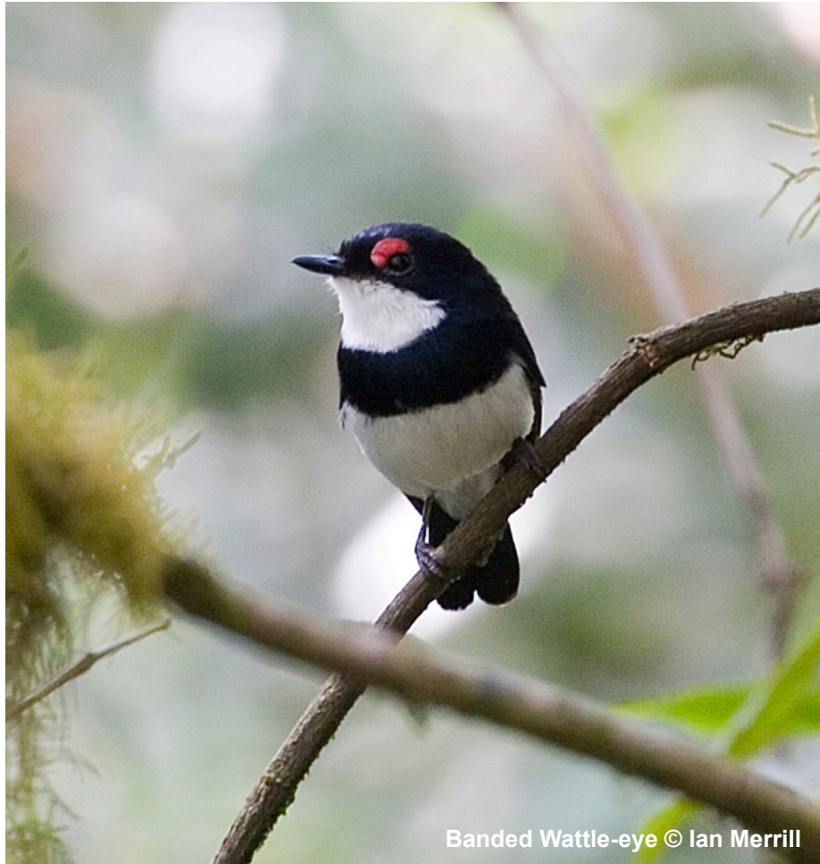
Banded Wattle-eye

Now our focus turned to the highland specials of the Cameroon Mountains EBA, which we had sampled briefly on our first day at Mount Cameroon. En route to Bamenda we stopped briefly at the Sanaga River, where Thick-billed Honeyguide , Rock Pratincole and the smart White-throated Blue Swallow were found. Our first afternoon in the Bamenda highlands was very rewarding. Degraded forest patches were home to the snazzy Black-collared Apalis , Cameroon Sunbird , localised Bannerman's Weaver , a single male Oriole Finch , many skulking Bangwa Forest Warbler (not seen by everyone) and, best of all, a pair of very confiding Banded Wattle-eye . At the forest edge and adjacent grasslands we found Blue-breasted Bee-eater , Pectoral-patch Cisticola and (Bouvier's) Orange-tufted Sunbird . The next morning we bumped our way up to the Mount Oku forests, where we hoped to clinch the remaining Bamenda highlands specials before heading for Nyasoso. Early on we spotted a