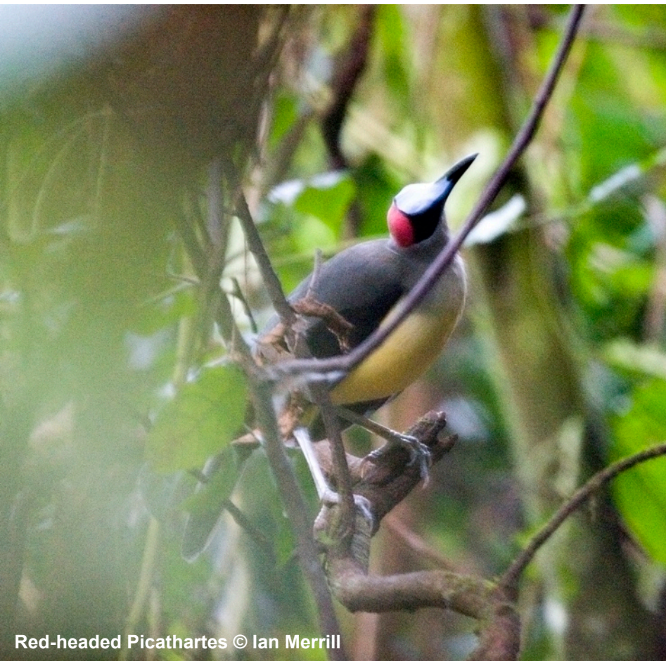
Red-headed Picathartes

the mountain to bring up some food. Excellent views of Brown-chested Alethe were had by some feeding quietly along the edge of a stream. We headed back to the area of the previous night in the late afternoon. All the effort and concern over the past few days was quickly consigned to the history books as all of the group had outstanding views of one of the worlds most charismatic birds. The Red-headed Picathartes (surely calling it Grey-necked is an insult!) spent 15 minutes preening on branches 20 feet off the floor, visited its nest briefly and bound within 30 feet sitting on nearby rocks, before being joined by a second bird before heading off. Watched for 30 minutes we happily descended back down the mountain with a veritable spring in our steps only pausing for views of Swamp Palm Bulbul, Honeyguide Greenbul, Superb Sunbird and Sabine's Puffback . Celebratory beers were drunk !