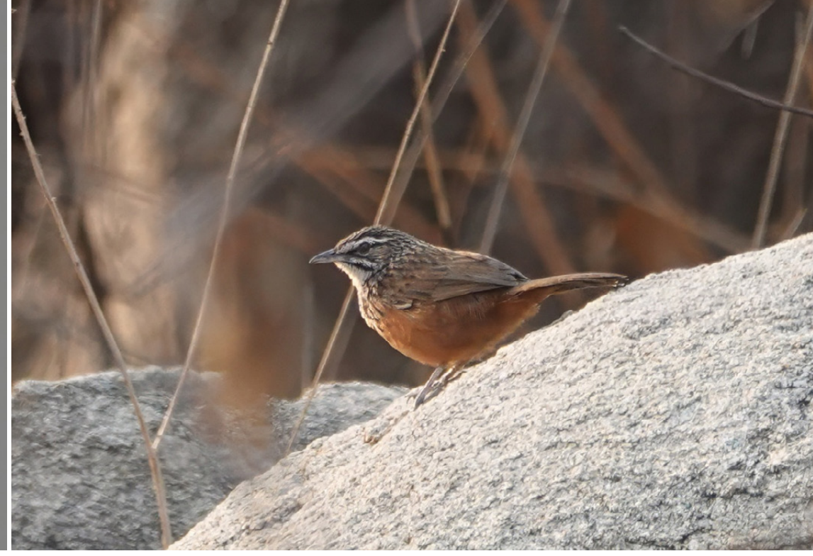
Rockrunner and Monteiro's Hornbill