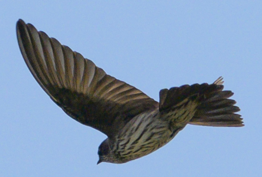
Brazza's Martin and Bocage's Sunbird

African Moustached Warbler and Streaky-headed Seedeater