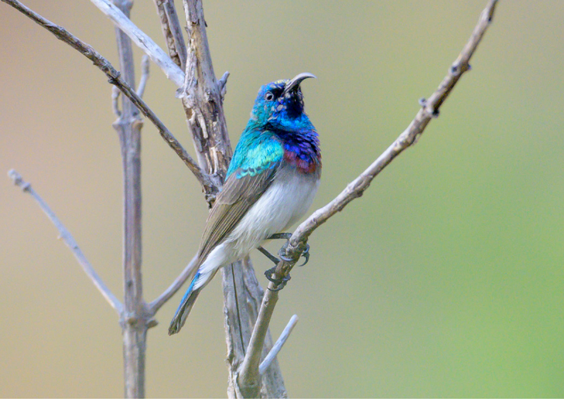
Oustalet's Sunbird and Ovambo Sparrowhawk