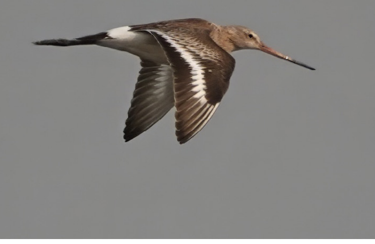
Black-tailed Godwit and Forest Swallow