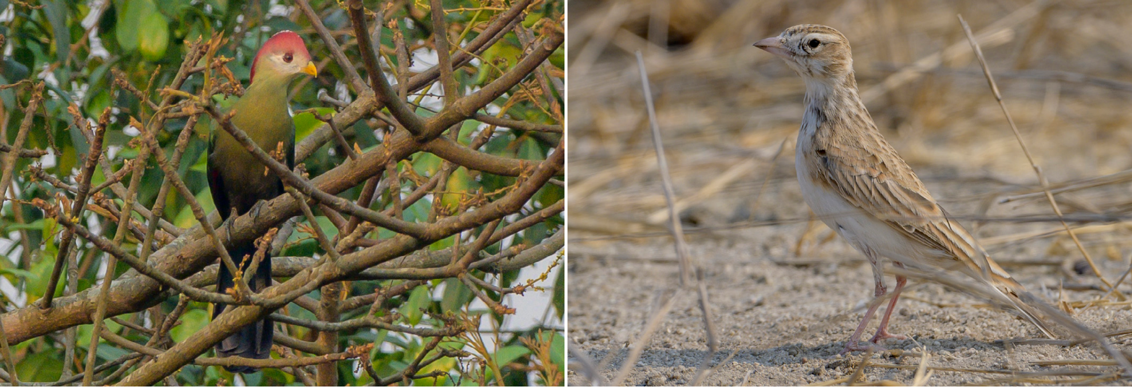
Red-crested Turaco and Red-throated Cliff Swallow