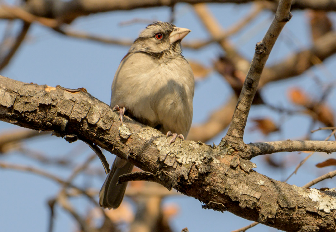
Chestnut-backed Sparrow-Weaver and Double-banded Courser