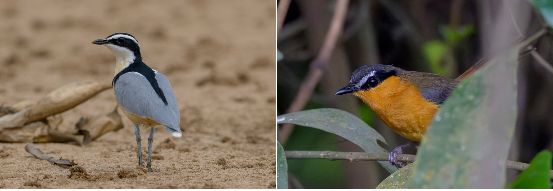
Egyptian Plover and Forest Scrub Robin