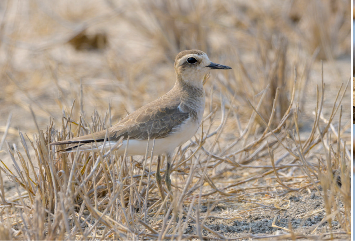
Caspian Plover and Cloud Cisticola