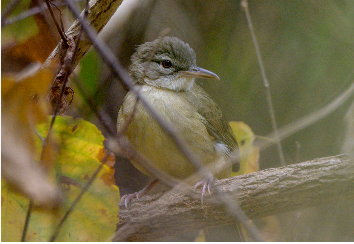
Pale-olive Greenbul and Peregrine Falcon