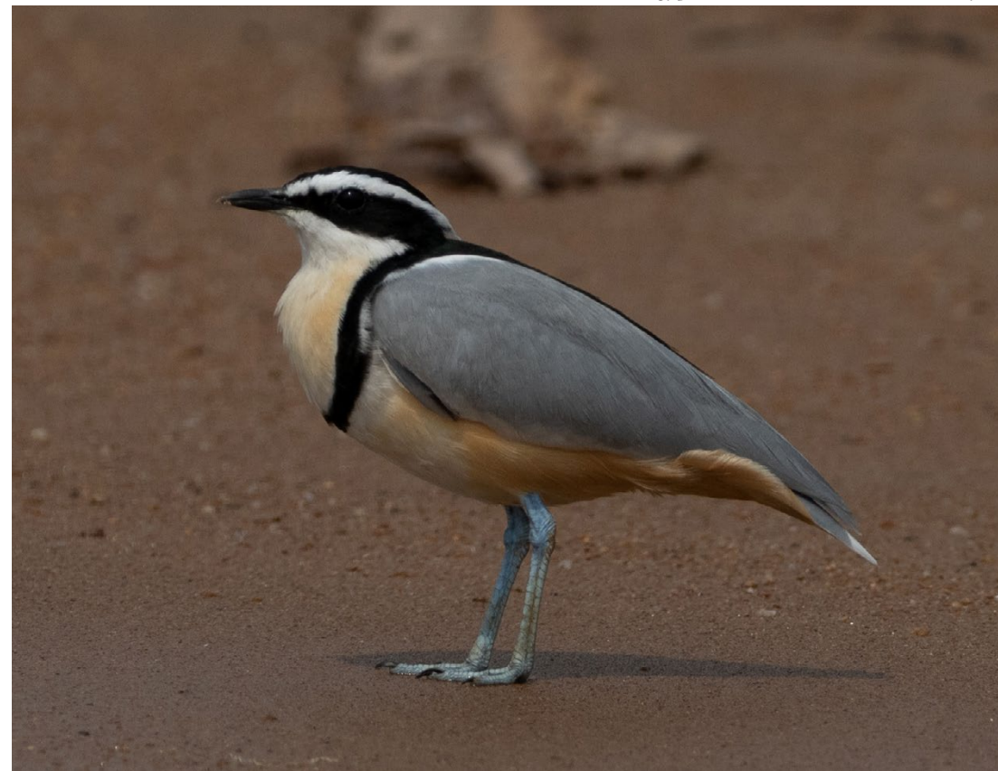
Egyptian Plover

Aside from the escarpment, the unique biodiversity of Angola can be found in the adjacent highlands, and it was to this region that we next turned our efforts. They highland reach their pinnacle at Mount Moco, the core of a region that holds a diverse array of habitats. Most of the area is blanketed in miombo woodland, now unfortunately mostly quite degraded due to clearing for agriculture and charcoal production. Significant areas of montane grassland can also be found, numerous rivers and associated dambo grasslands criss-cross the area, and very small patches of montane forest exist in the gullies on Mount Moco itself. We divided our time fairly evenly between these habitats, each with its own specials.