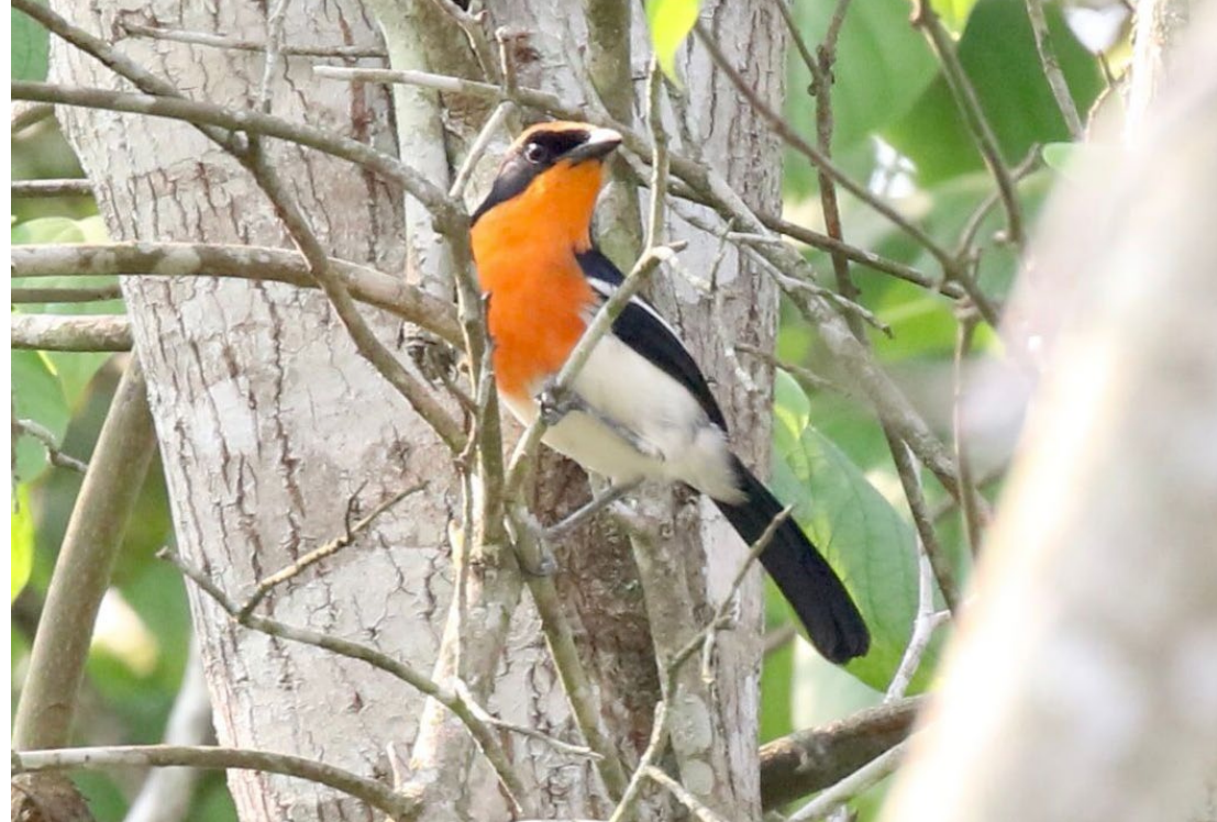
Braun's Bushshrike

During the following day-and-a-half we visited various sites along the northern escarpment of Uíge province, amassing an impressive list of species. Highlights included tracking down Angolan White-throated Greenbul for good views, Brown-backed Scrub Robin, a surprise Western Black-headed Batis, Orange-tufted Sunbird and White-collared Oliveback. Ample backup was provided by Eastern Piping Hornbill, Congo Pied Hornbill, Hairy-breasted Barbet, Speckled Tinkerbird, Great Blue Turaco, Guinea Turaco, Forest Chestnut-winged Starling, Yellow-mantled Weaver, Yellow-browed Camaroptera, Rufous-crowned Eremomela, Buff-throated Apalis, Chestnut-breasted Nigrita, Dusky-blue Flycatcher, Banded Prinia, White-chinned Prinia, Velvet-mantled Drongo, Black-winged Oriole, Black Bee-eater, Purple-throated Cuckooshrike, Grey-throated Tit-Flycatcher, Pink-footed Puffback, Blue-headed Crested Flycatcher, perched Afep Pigeon and Western Bronze-naped Pigeon, Dark-backed Weaver, Red-headed Malimbe, Crested Malimbe, Chestnut Wattle-eye, Yellow-