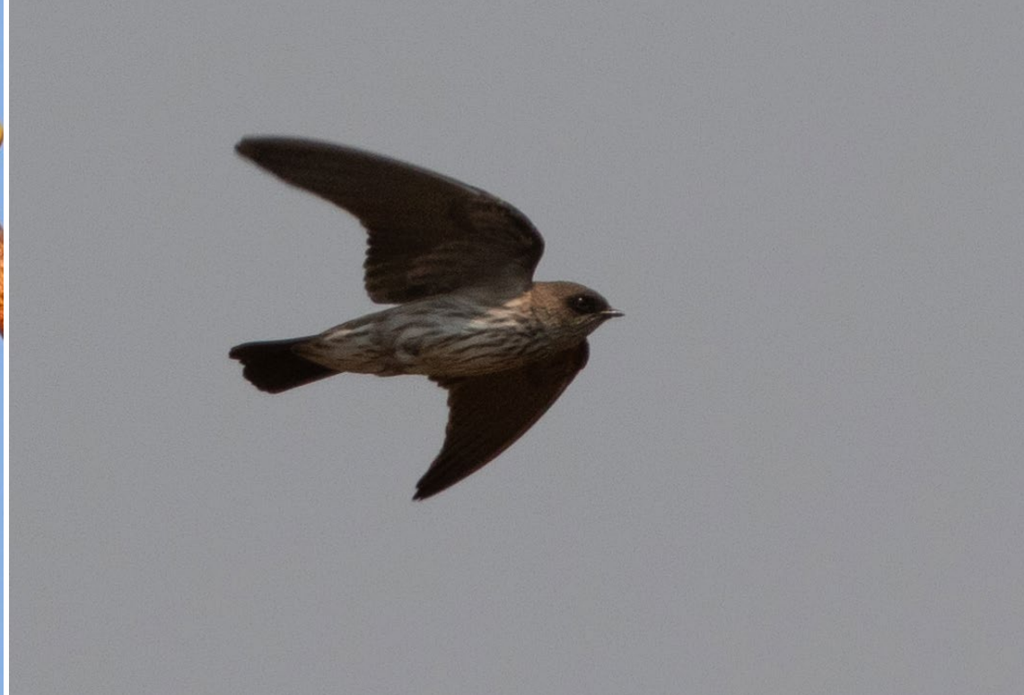
Brazza's Martin and Pulitzer's Longbill