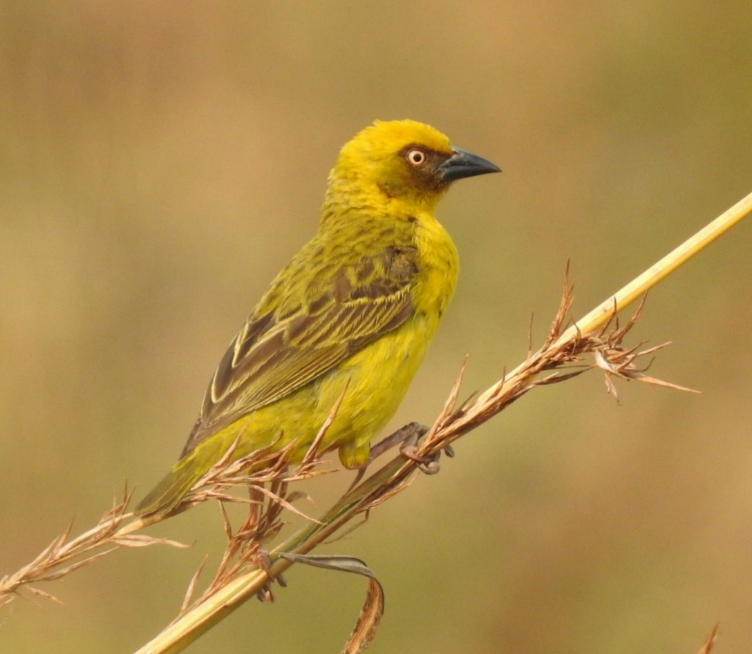
Bocage's Weaver

In the forests we first turned our attention to the small patch above the village of Kanjonde, which is the focus of my forest rehabilitation project at the mountain. It was pleasing to see that the firebreaks installed earlier in the year had successfully stopped fires from entering the forest patch, and that the trees in it continued to grow well. We spent the better part of a day here, with birds seen including Huambo Cisticola, White-tailed Blue Flycatcher, Ludwig's Double-collared Sunbird, Angola Slaty Flycatcher, Western Green Tinkerbird, Grey Apalis, Black-chinned Weaver, Olive Woodpecker, Bronzy Sunbird, Red-throated Wryneck, Thick-billed Seedeater, Dusky Twinspot, Bocage's Akalat and Evergreen Forest Warbler. Swierstra's Francolin crowded from the dense undergrowth but remained well hidden. Horus