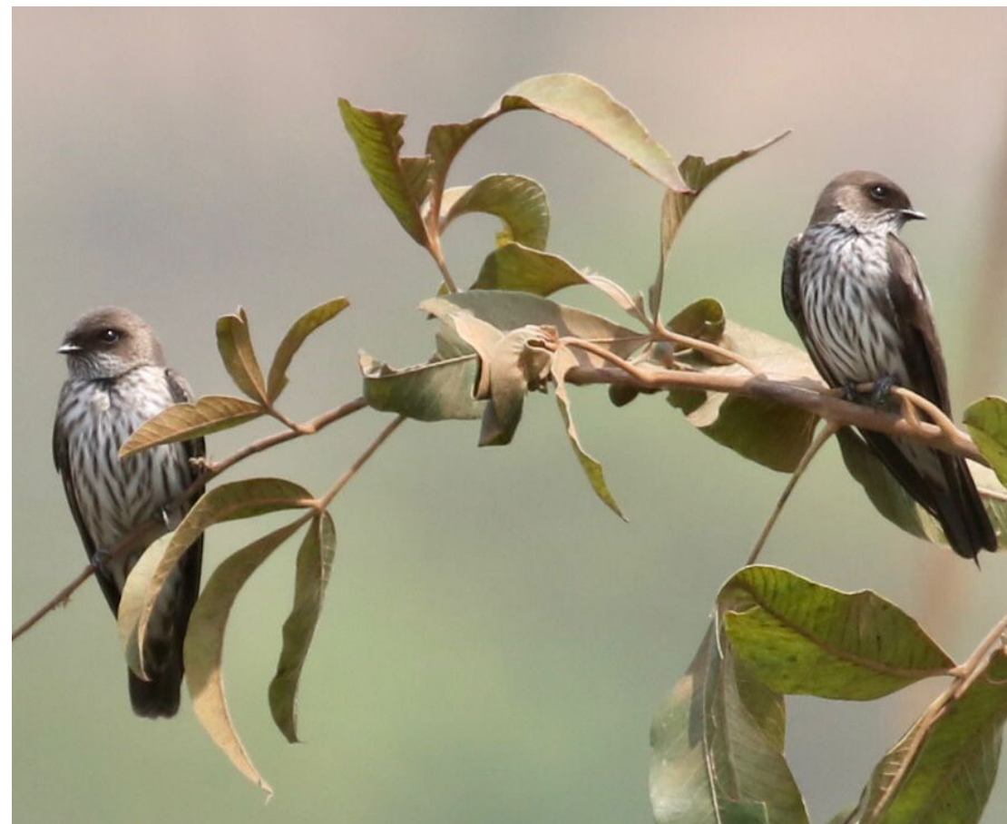
Braza's Martin

Next, we moved on to the Lubango area, breaking up the long drive with a few stops that brought a couple of surprises in the shape of Blue Quail and Rosy-throated Longclaw.