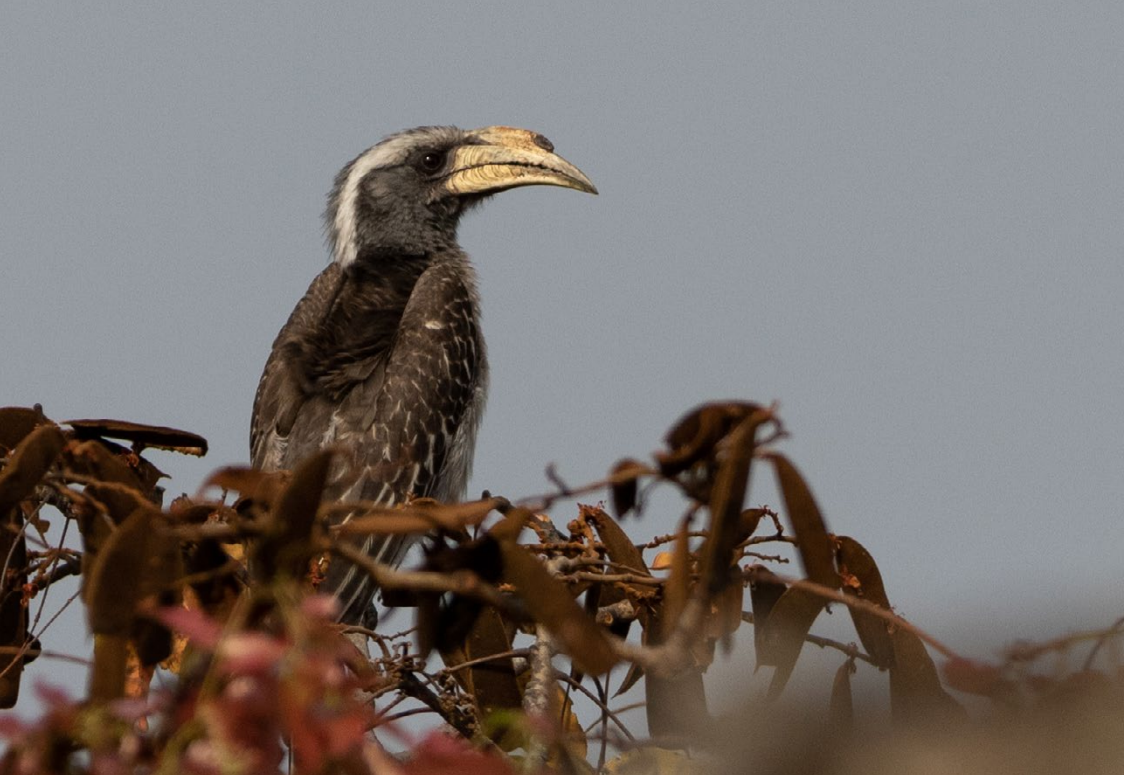
Pale-billed Hornbill and Senegal Lapwing