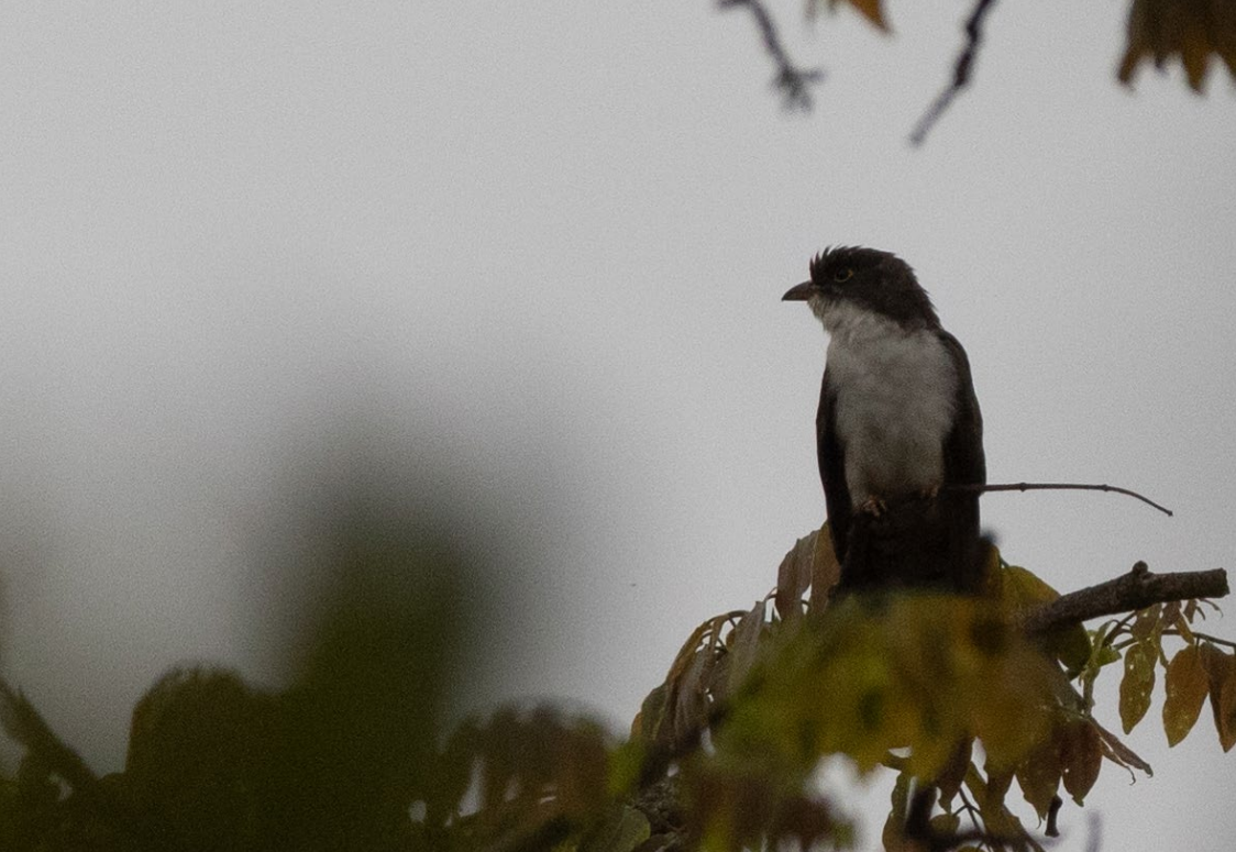
Thick-billed Cuckoo and Superb Sunbird