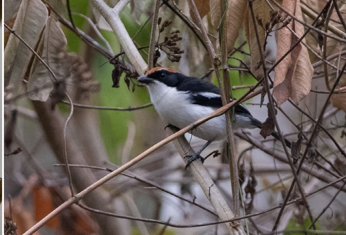
Gabela Bushshrike and Böhm's Flycatcher