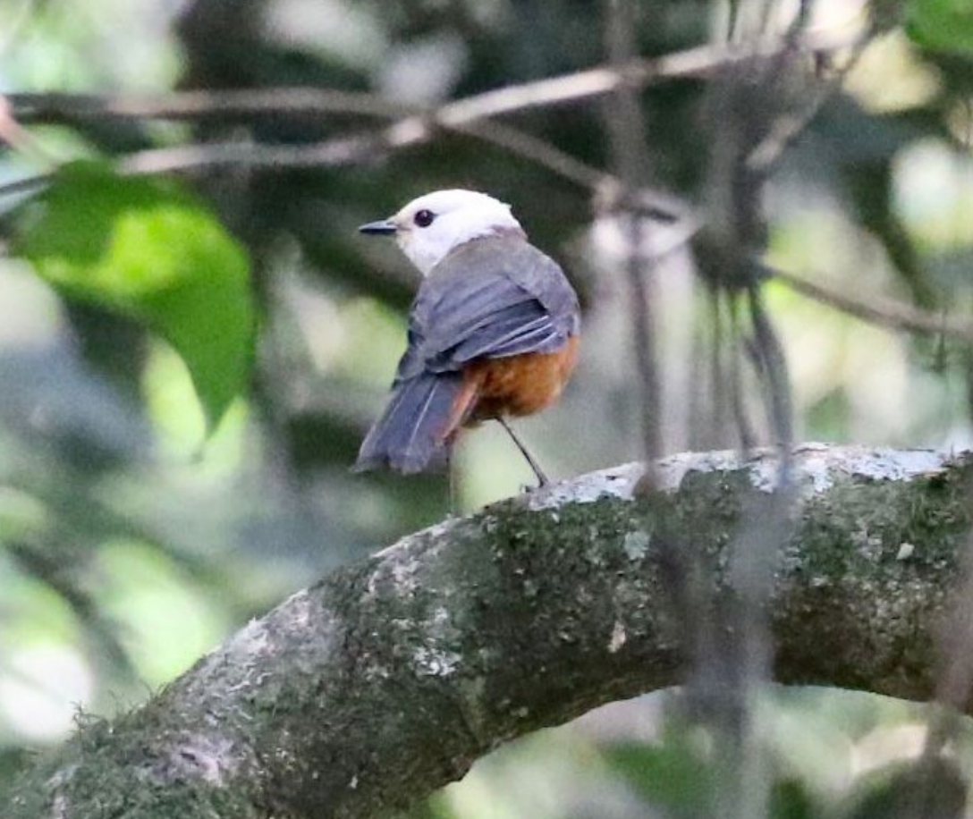
White-headed Robin-Chat © Aidan Kelly

Moving on, some vehicle battery problems caused a bit of a delay, but some clever thinking got us back on the road and we arrived at our comfortable accommodation near Muxima in time for dinner. Our successful stop near Caxito, several days previously, had taken the pressure off our day in the dry forests of the area and left just one major target. Fortunately, it didn't take long to find a pair of Grey-striped Francolin feeding in the track, which allowed prolonged observation before melting into the dense undergrowth. Many of the key birds were the same as around Caxito — Golden-backed Bishop, Gabela Helmetshrike, Pale-olive Greenbul, Purple-banded Sunbird, Angola Batis and Rufous-tailed Palm Thrush — but we also saw Red-backed Mousebird, Forest Scrub Robin, Olive Bee-eater, Mottled Spinetail, Böhm's Spinetail and Scaly-throated Honeyguide.