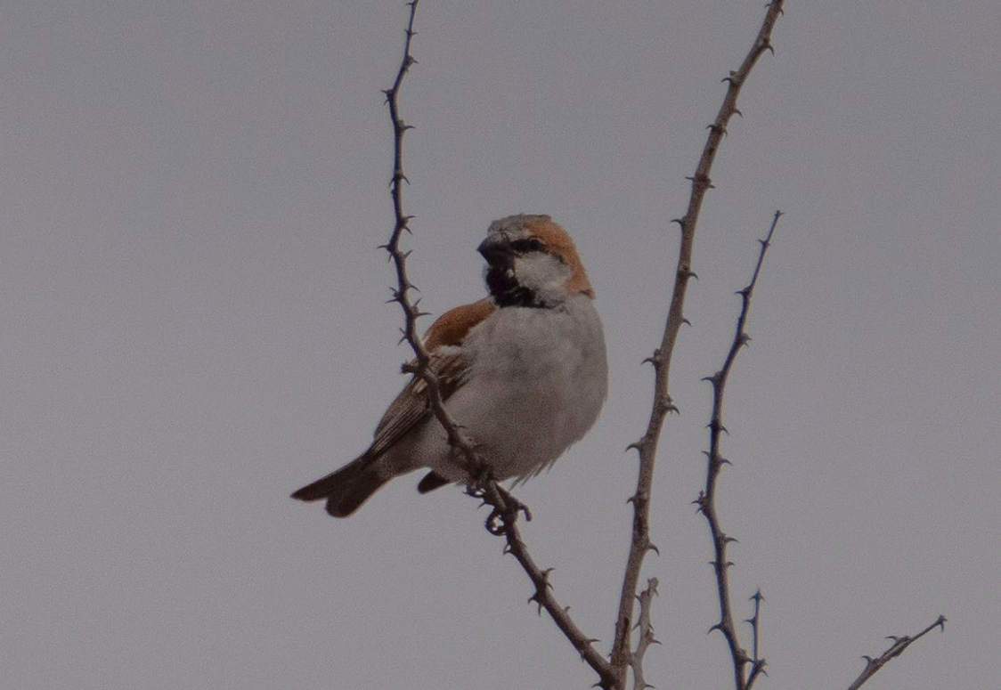
Great Sparrow and Dark Chanting Goshawk