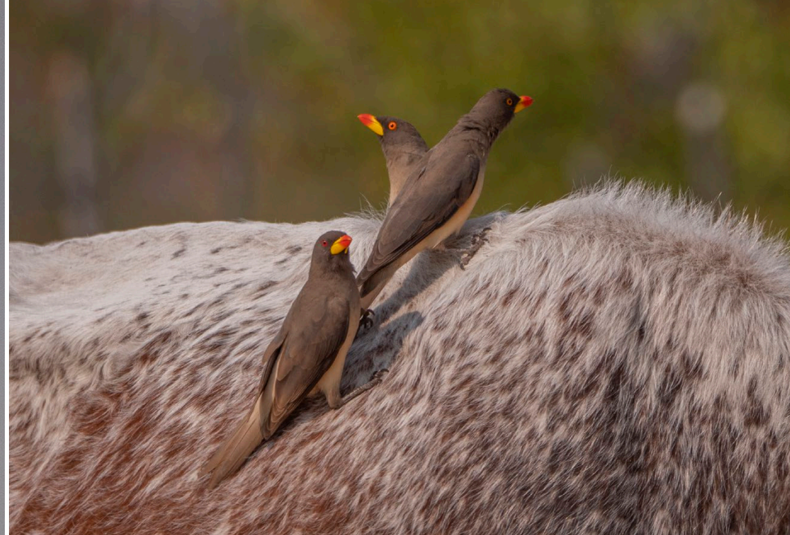
Yellow-billed Oxpecker and Black-necked Eremomela