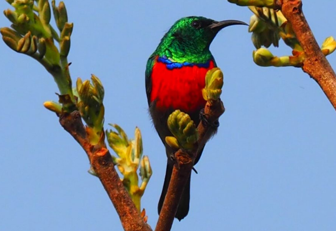
Ludwig's Double-collared Sunbird and Benguela Long-billed Lark