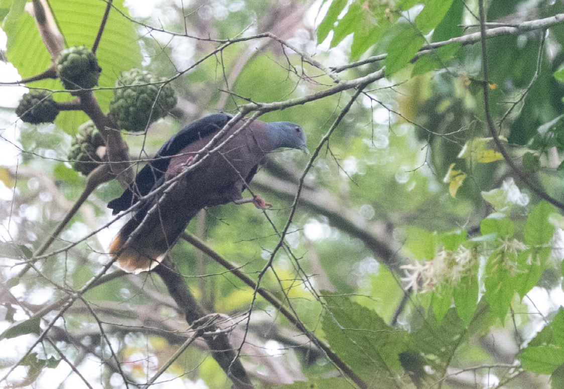
Western Bronze-naped Pigeon and Southern (Forest) Hyliota