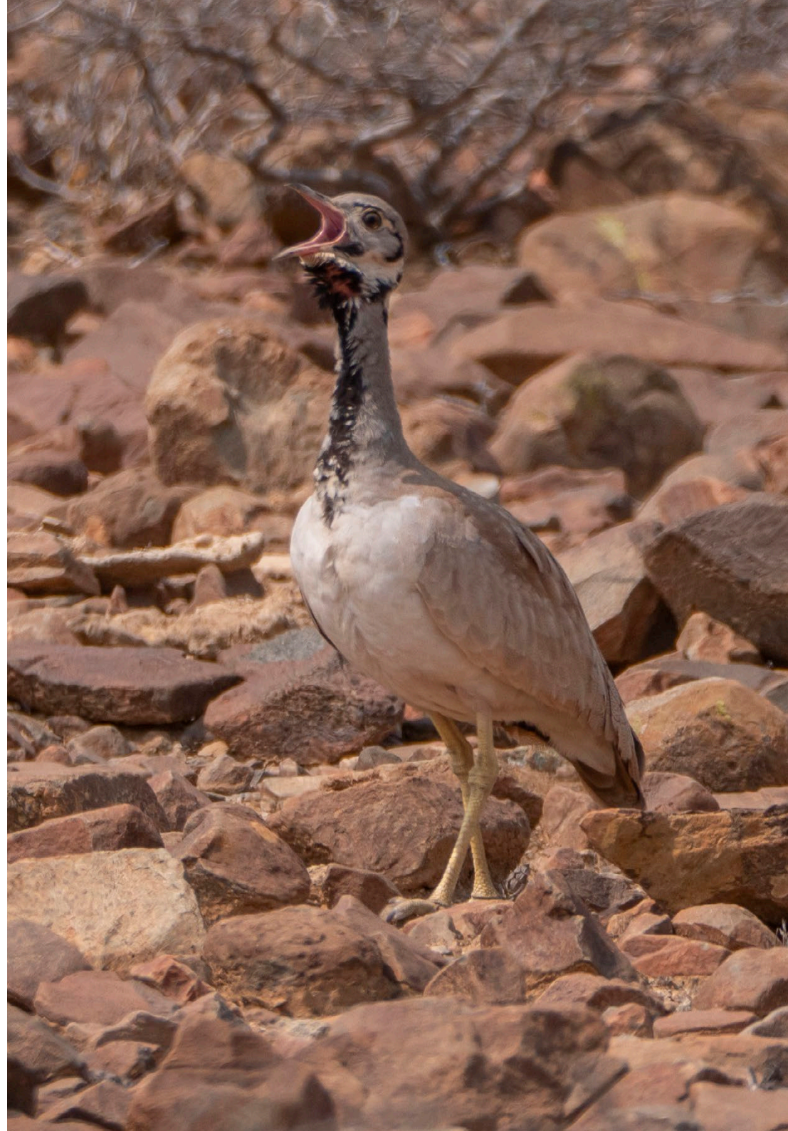
White-bellied Barbet and Rüppell's Korhaan

The coastal wetlands allowed us to do some list padding, with more interesting species including: Chestnut-banded Plover at the salt works at Benguela; Cape Teal, Blue-billed Teal, Lesser Flamingo, Greater Flamingo, Yellow-billed Stork, African Swampphen, Gull-billed Tern, Great White Pelican and Black Heron at Lobito; a surprise Blacksmith Lapwing at the Keve River; Western Osprey and Mangrove Brown Sunbird at the Kwanza River mouth; and White-fronted Plover and Eurasian Curlew at Mussulo Bay.