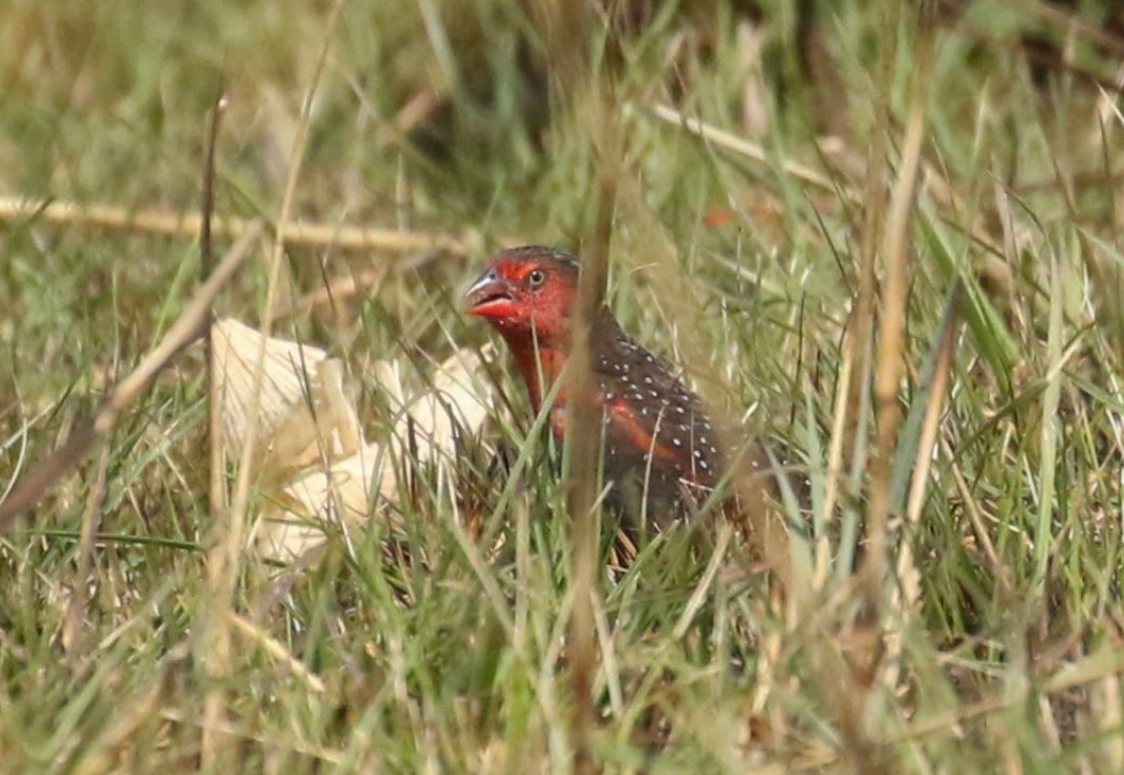
Locust Finch and Böhm's Spinetail © Aidan Kelly