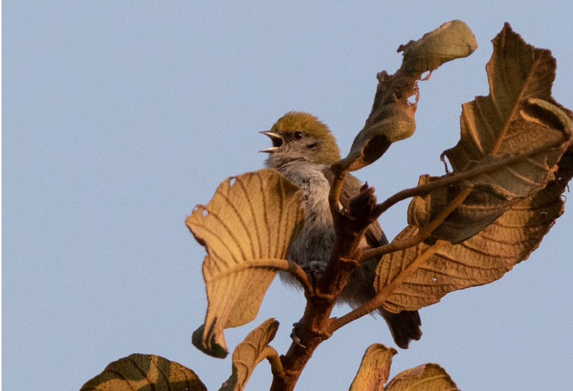
Grey Penduline Tit and Fülleborn's Longclaw