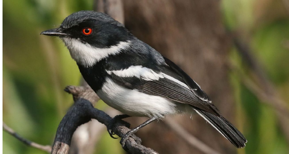
Margaret's Batis