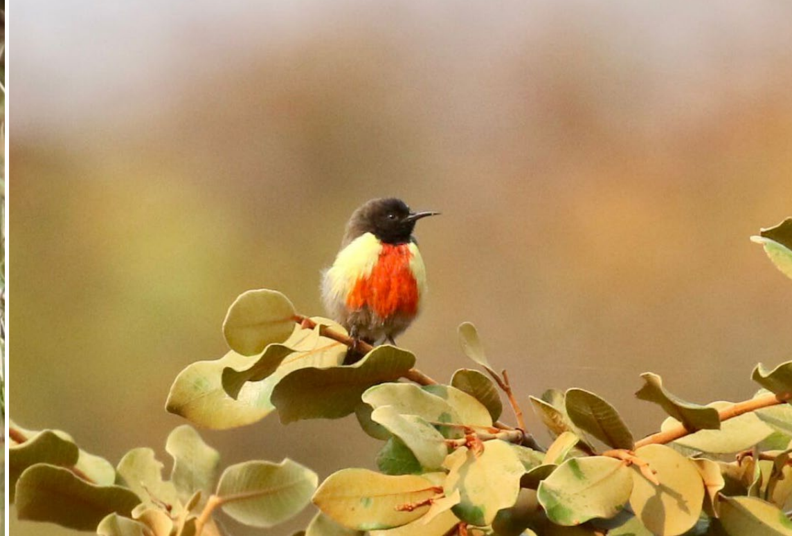
Anchieta's Sunbird and Gabela Helmetshrike