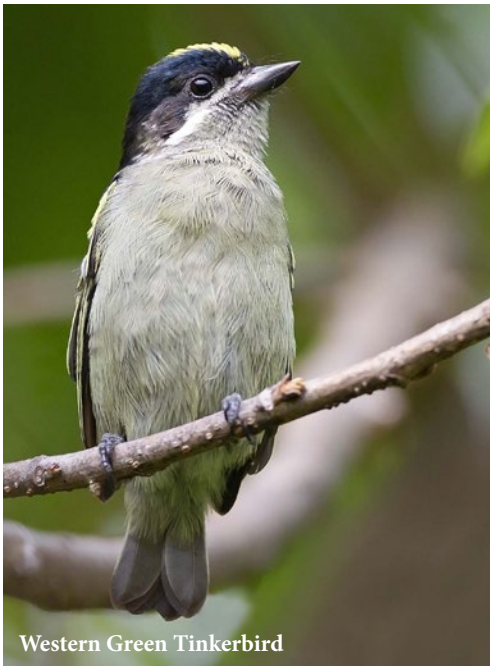
Western Green Tinkerbird