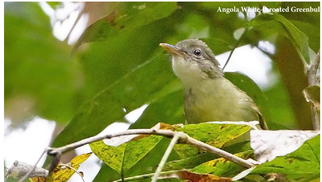
Angola White-throated Greenbul

The following day-and-a-half in the northern scarp forests of Uíge province produced an impressive list of species, with special mention deserved by Angola White-throated Greenbul that teased us for a while before it was seen by all. It is only the third time that this threatened endemic has been seen since the early 1970s, and the first bird tour to enjoy the privilege. Pigeons behaved well, with both Western Bronze-naped Pigeon and Afep Pigeon sitting up for good scope views. Tit Hylia was a pleasant surprise. Yellow-spotted Barbet was seen for the first time in Angola-outside-Cabinda. And we studied a small, plain-faced honeyguide in the scope, the olive wash across the breast suggesting Willcocks's Honeyguide , which would be a first for the country. Other highlights along the northern escarpment included Brown-backed Scrub Robin , Compact Weaver , Blue-breasted Bee-eater , African Yellow Warbler , Red-faced (Lepe) Cisticola , Moustached Grass Warbler , White-