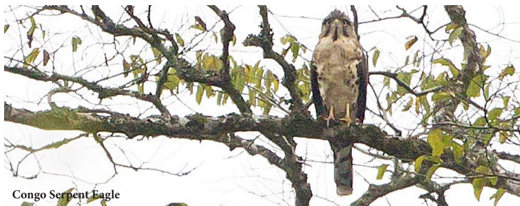
Congo Serpent Eagle

22 Sep: Tour ends with flights out of Lubango.