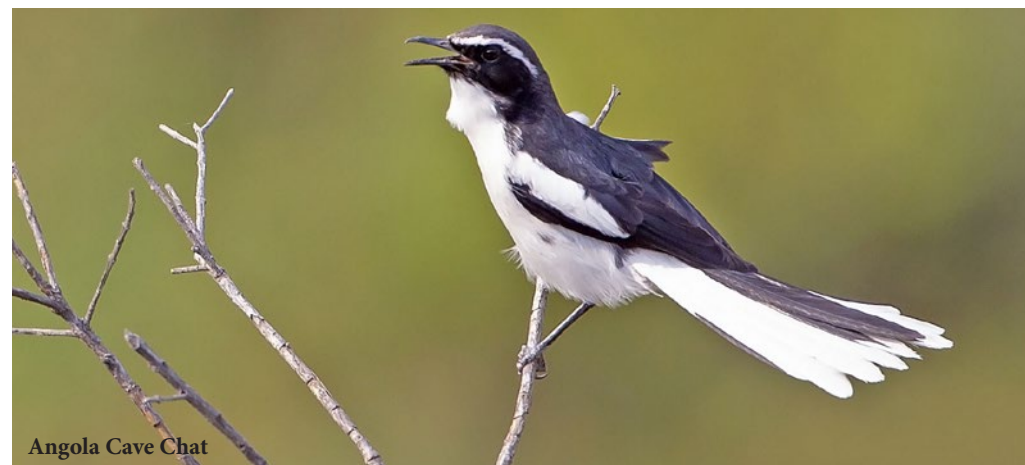
Angola Cave Chat

Black-faced Canary Crithagra capistrata - Good sightings on several occasions ( hildegardae at Moco, capistratus elsewhere)