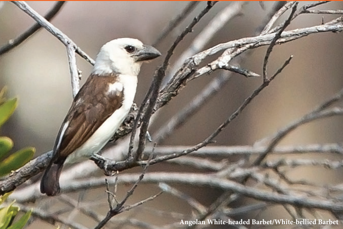
Angolan White-headed Barbet/White-bellied Barbet