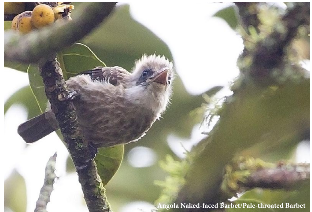
Angola Naked-faced Barbet/Pale-throated Barbet

Cabanis's Bunting Emberiza cabanisi - Seen at Kalandula ( orientalis )