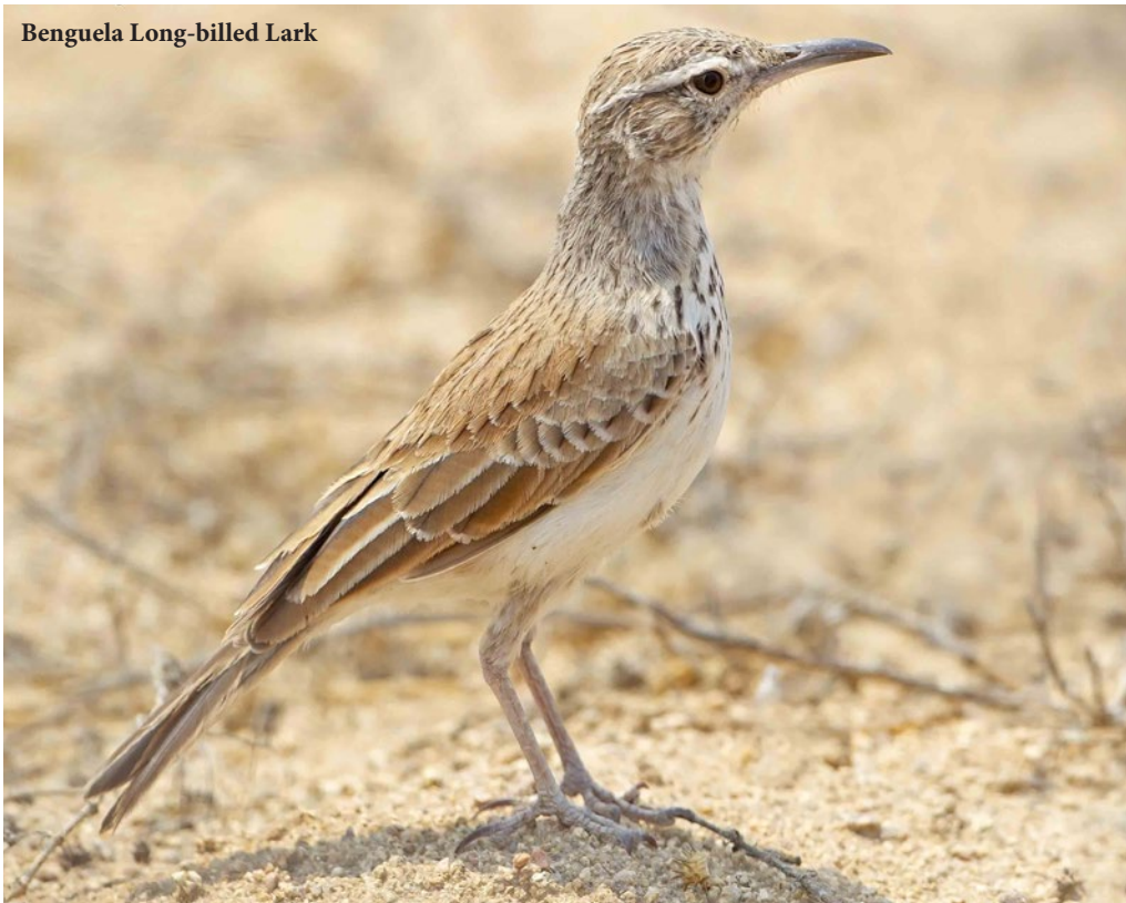
Benguela Long-billed Lark