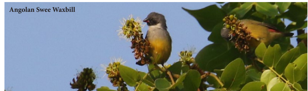
Angolan Sweet Waxbill

Golden-breasted Bunting Emberiza flaviventris – Seen a few times