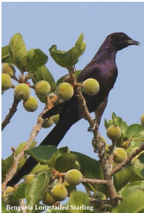
Benguela Long-tailed Starling

On our second full day around Lubango we descended the escarpment at Leba Pass, running a transect across the ever-drier landscape towards the coast. Our first stop is some dry woodlands fairly quickly produced our main target, the localised Cinderella Waxbill tracked down in a flowering tree and seen again later at point-blank range. In the same general area we found the benguellensis race of Meves's Starling (now split by BirdLife as Benguela Starling ), some smart afar Red-necked Spurfowl and Bennett's Woodpecker . Further towards the coast the habitat became drier and we found Crimson-breasted Shrike , Karoo Chat , Chat Flycatcher , Pale Chanting Goshawk , Pale-winged Starling , Chestnut-vented Tit-Babbler ( Warbler ), four Double-banded Sandgrouse and Dusky Sunbird . In the sparser areas still we found several confiding Benguela Long-billed Lark and a trio of Rüppell's Korhaan . Lunch at the seafront in Namibe was accompanied by Cape Cormorant before we retraced our steps back across the coastal plain and up the spectacular Leba Pass, for the end of the tour.