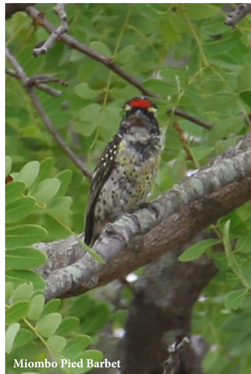
Miombo Pied Barbet