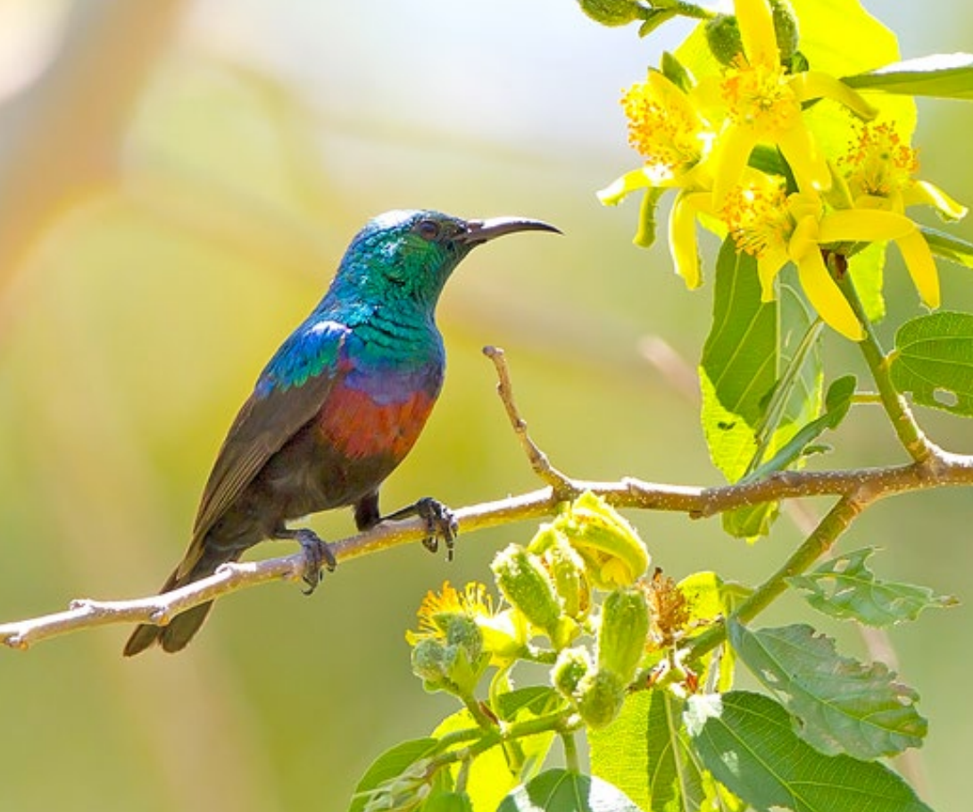
Shelley's Sunbird