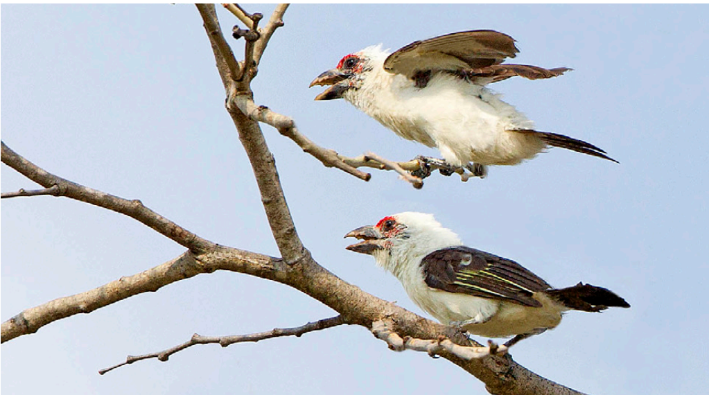
Chaplin's Barbet

Visit www.birdingafrica.com Deposit ($150) by credit card Email info@birdingafrica.com