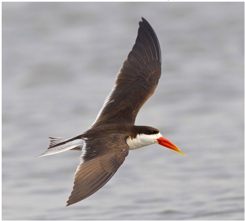
African Skimmer © Tertius Gous