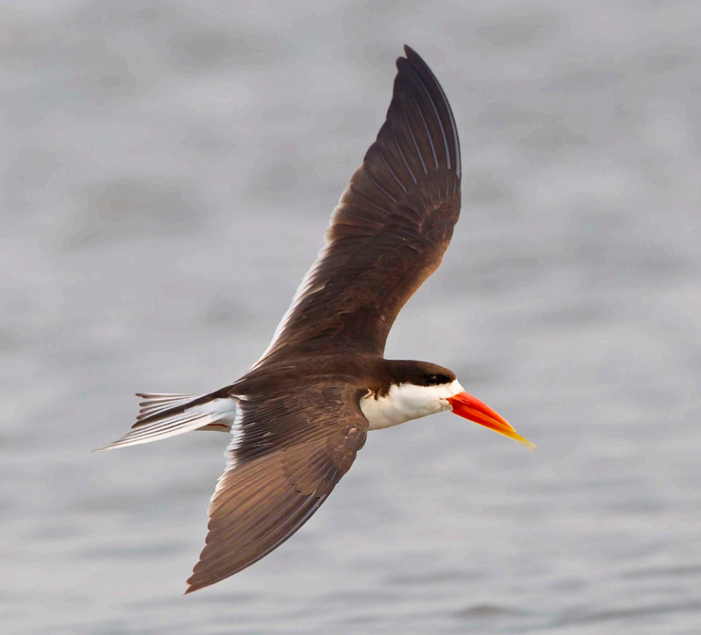
African Skimmer © Tertius Gous