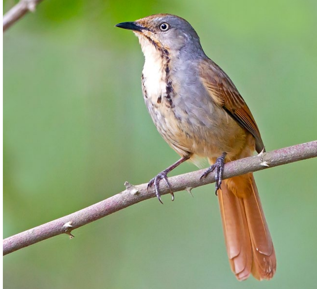
Collared Palm Thrush

Woodpecker, African Cuckoo-Hawk and Cuckoo Finch, and around wetlands, Rufous-bellied Heron, White-backed Duck and Spotted Crake.