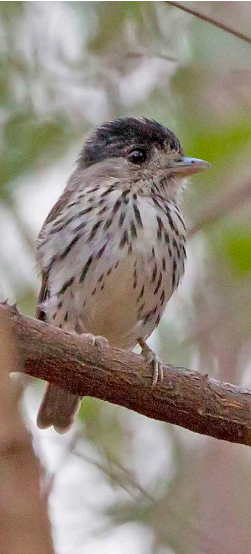
African Broadbill (left) and Narina Trogon (right)

of specials can be found and it is one of the best places to see the desirable African Pitta. Given the quality of the birds on offer Zambia must be regarded as one of Africa's most under-birded countries. Our 8-day Pitta Tour takes in the best that the south of the country has to offer, and aims to find as many regional specialties as possible in compliment to our Main Tour.