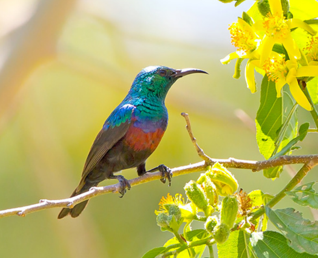
Shelley's Sunbird