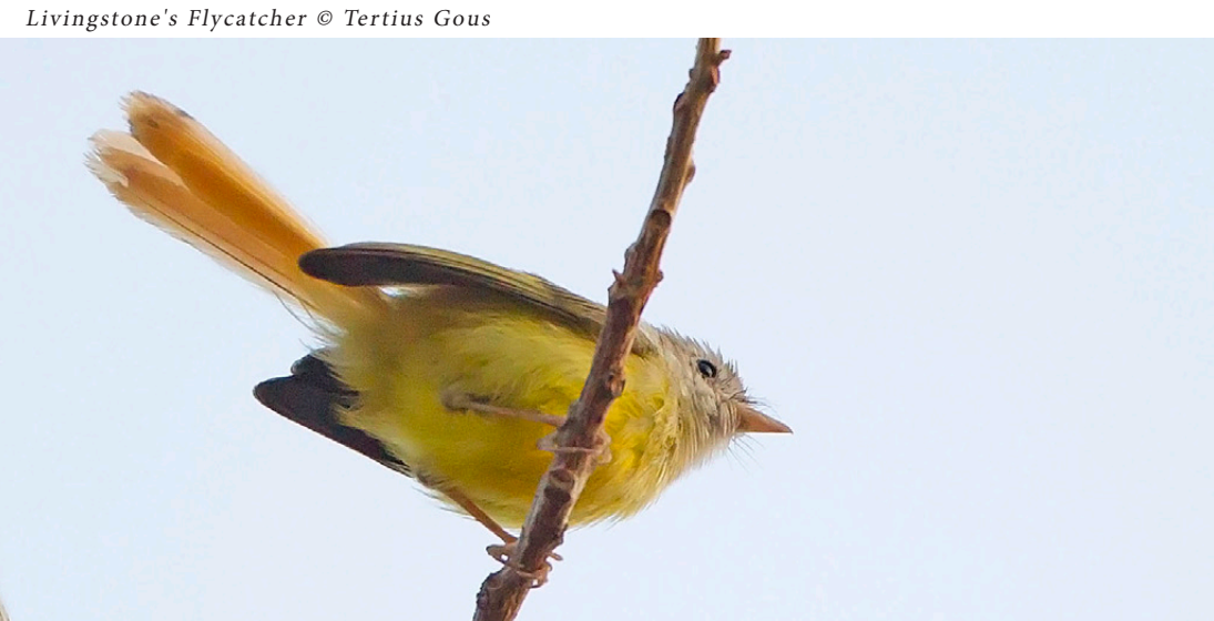
Livingstone's Flycatcher

Today we have a second chance for African Pitta in the early morning, before driving back to Lusaka, a three-hour drive.