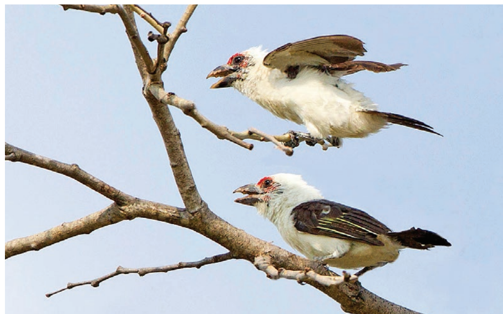
Chaplin's Barbet

Visit www.birdingafrica.com Deposit ($150) by credit card Email info@birdingafrica.com