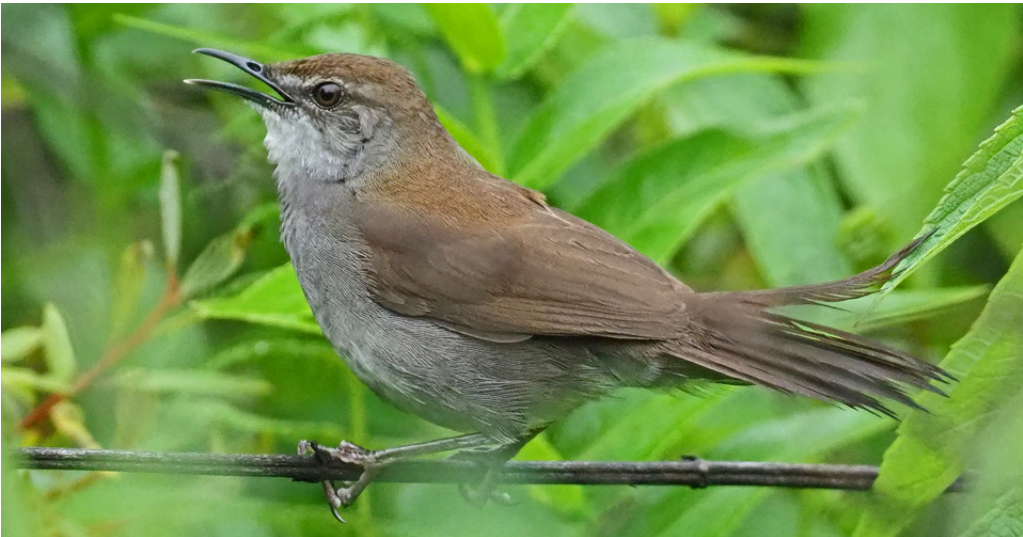
Bamboo Warbler

Visit www.birdingafrica.com Deposit ($150) by credit card Email info@birdingafrica.com