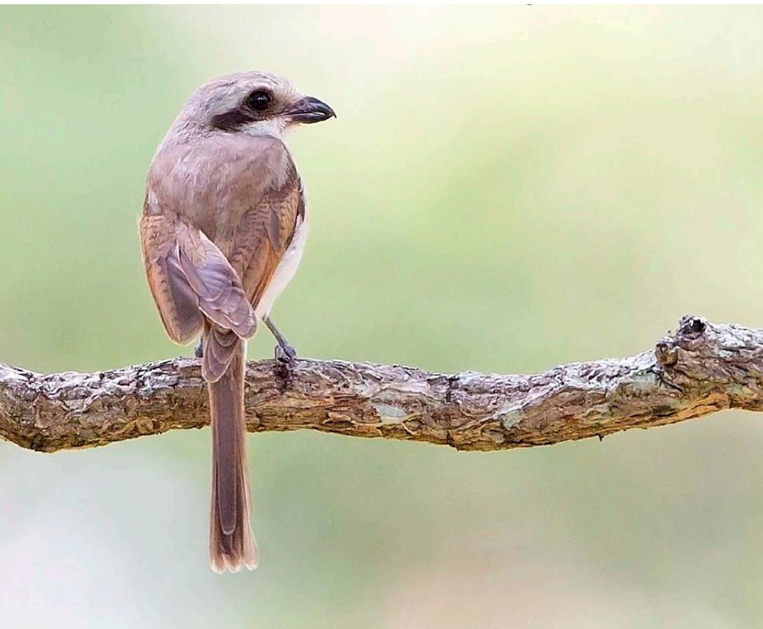
Souza's Shrike

The star bird at Nsoke is the unobtrusive Chestnut-mantled Sparrow-Weaver, which we'll look for in the tall miombo woodland. A good variety of other birds can be seen around the wetlands and thickets of Nsoke, and other possible species include Half-collared Kingfisher, Red-throated Twinspot, Fülleborn's Longclaw, Red-backed Mannikin, Lesser Swamp Warbler, Little Rush Warbler, Northern Blue-mantled Flycatcher and Chirping Cisticola. In the afternoon we'll continue to the industrial Copperbelt. Overnight in Chingola.