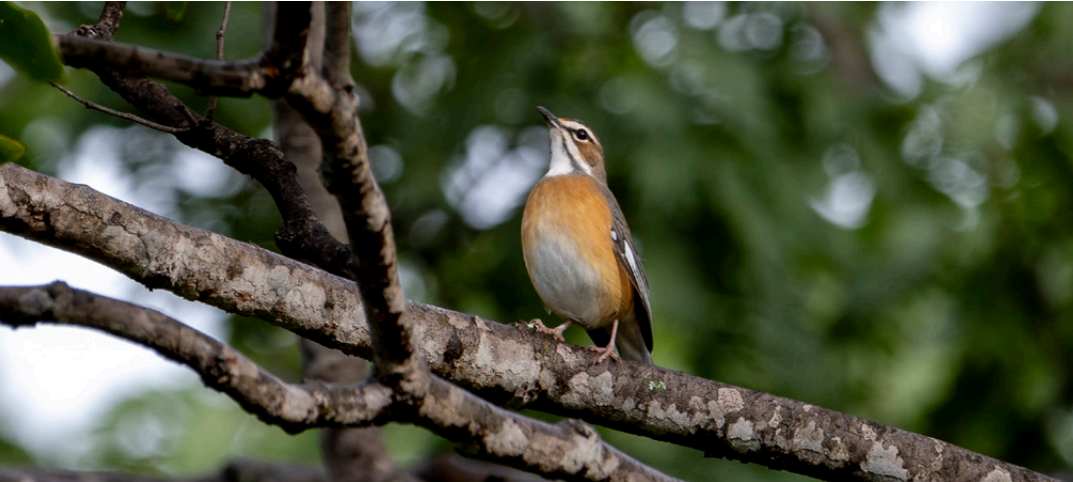
Miombo Scrub Robin

During the Zambia Pitta Tour we visit the Zambezi Valley in search of Africa Pitta, Livingstone's Flycatcher and Red-throated Twinspot, the Upper Zambezi area for Black-cheeked Lovebird and (hopefully) Slaty Egret, and the Nkanga/Choma area for the endemic Chaplin's Barbet, along with a wide variety of Miombo species.