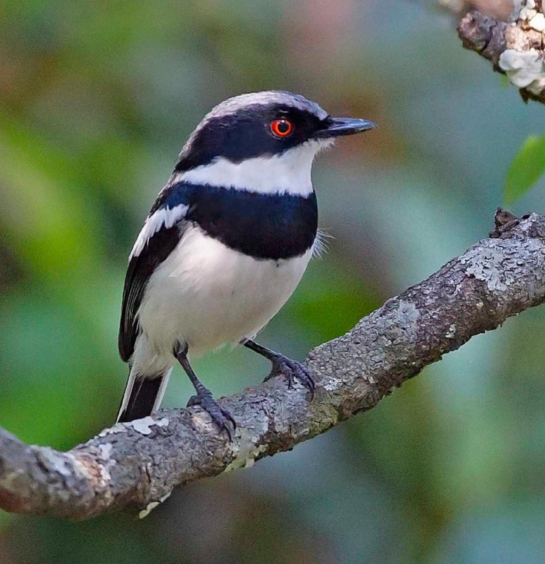
Margaret's Batis

The focus of our morning will be the moist miombo woodlands to the east of Chingola, where specials could include Black-backed Barbet, Sharp-tailed Starling and, with some luck, the scarce Whyte's Barbet. In the afternoon we'll continue to Mutanda and bird around Mutanda Nature Lodge, where Bocage's Akalat, African Thrush and Grey-olive Greenbul are all possible.