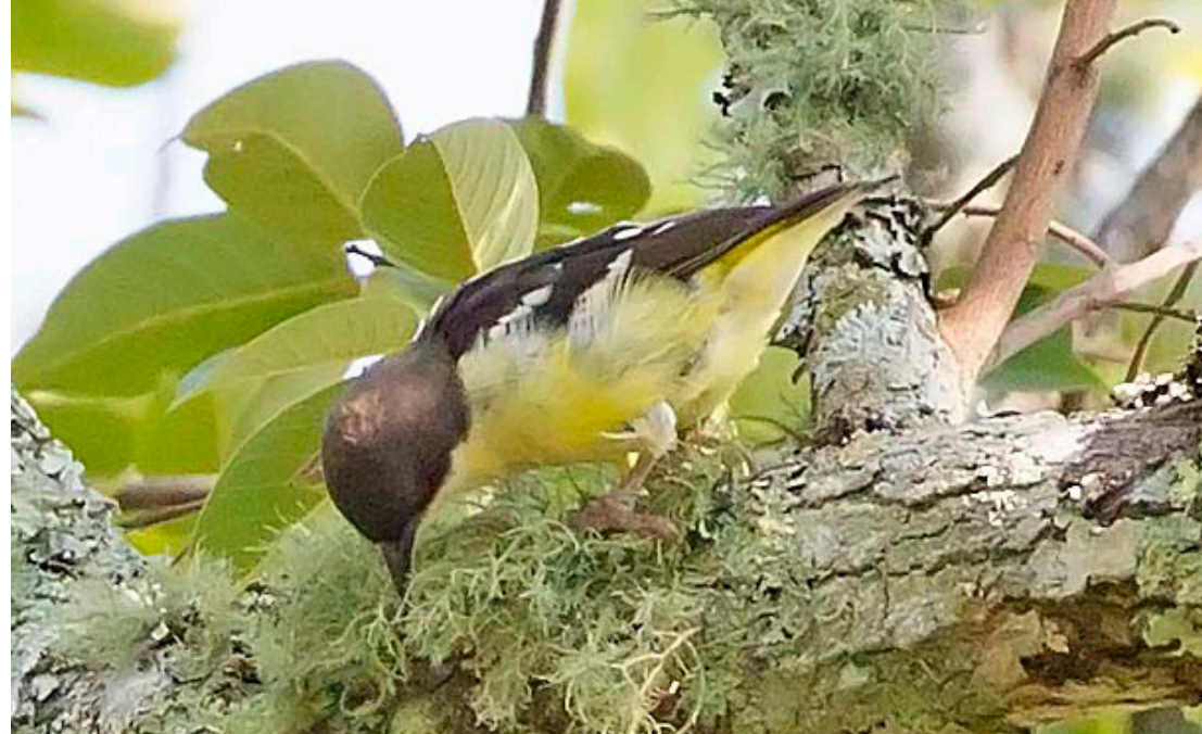
Bar-winged Weaver

After a bit of birding in the Chisamba area we set off on the long drive for Mutinondo Wilderness, breaking our trip at Forest Inn. Overnight at Mutinondo Wilderness Lodge.