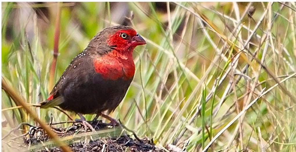
Locust Finch © Tertius Gous