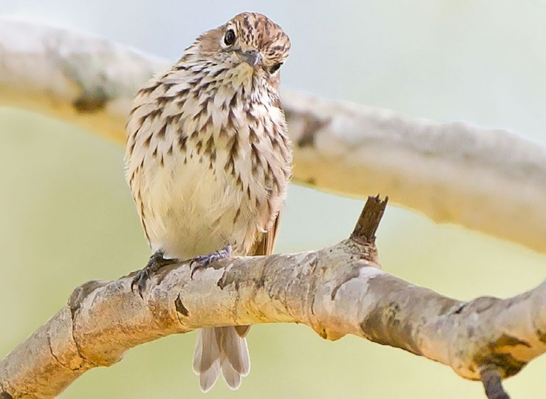
Bohm's Flycatcher ©Tertius Gous