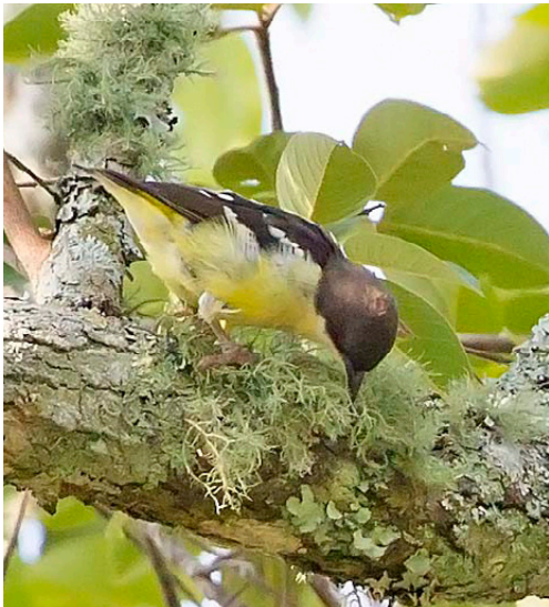
Bar-winged Weaver © Tertius Gous