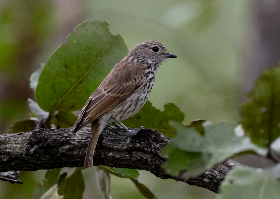
Böhms Flycatcher

Accommodation and meals are generally fairly good by African standards, and vary from private lodges and guest houses to rustic bush camps and small hotels. Rooms mostly have private facilities and hot water. We may need to share ablution facilities only on the odd occasion.