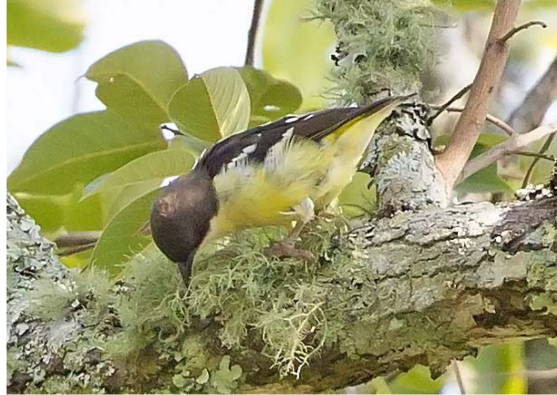
Bar-winged Weaver © Tertius Gous