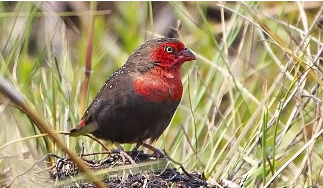
Locust Finch