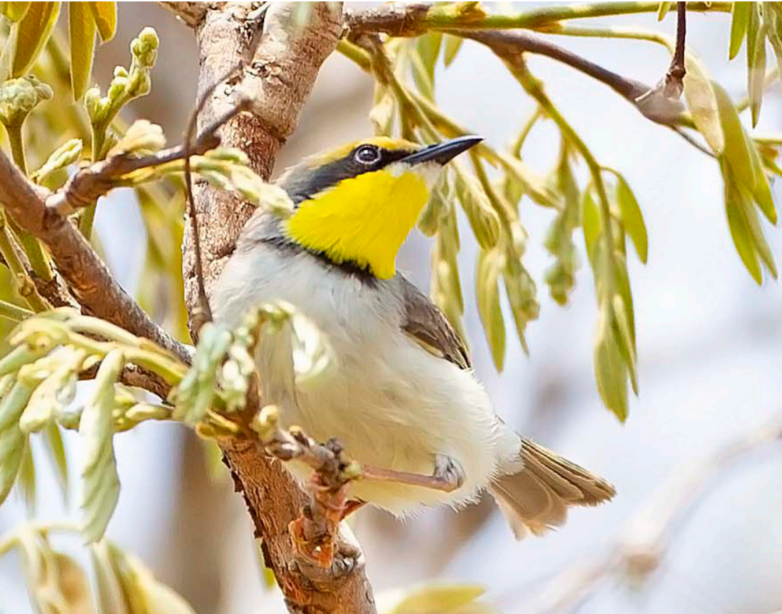
Black-necked Eremomela

The Zambia Pitta Tour starts in Livingstone on the evening of Day 13. Those who joined the Zambian Main Tour will fly from Lusaka to Livingstone first. Please see our separate Zambia Pitta Tour leaflet for full details.