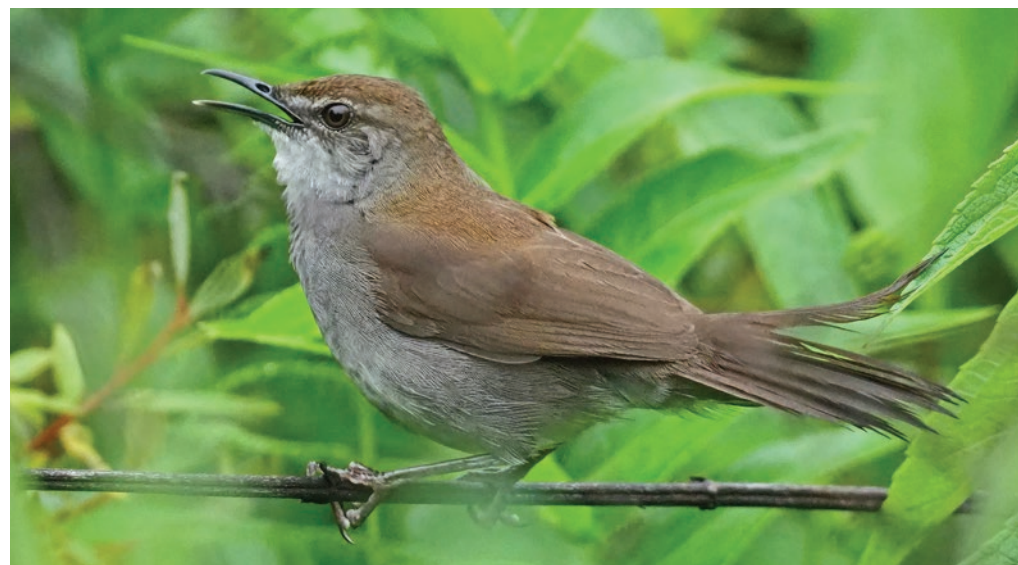
Bamboo Warbler © John Clark

Visit www.birdingafrica.com Deposit ($150) by credit card Email info@birdingafrica.com