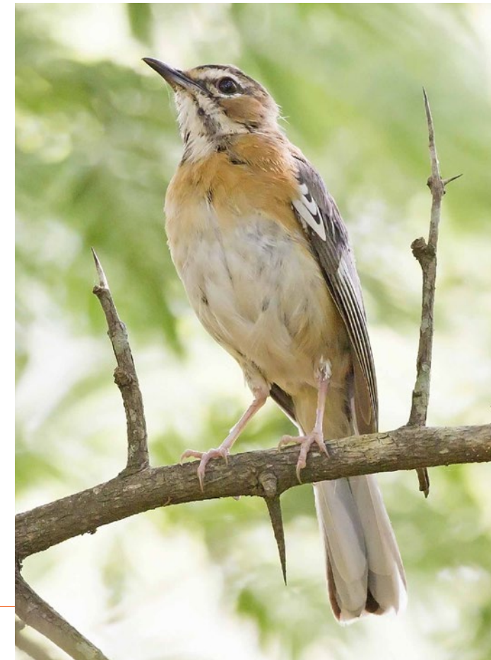
Miombo Scrub Robin

During the Zambia Pitta Tour we visit the Zambezi Valley in search of Africa Pitta, Livingstone's Flycatcher and Red-throated Twin-spot, the Upper Zambezi area for Black-cheeked Lovebird and (hopefully) Slaty Egret, and the Nkanga/Choma area for the endemic Chaplin's Barbet, along with a wide variety of Miombo species.