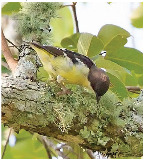
Bar-winged Weaver