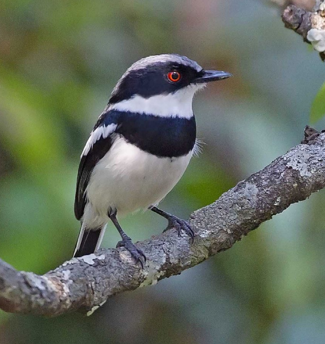
Margaret's Batis