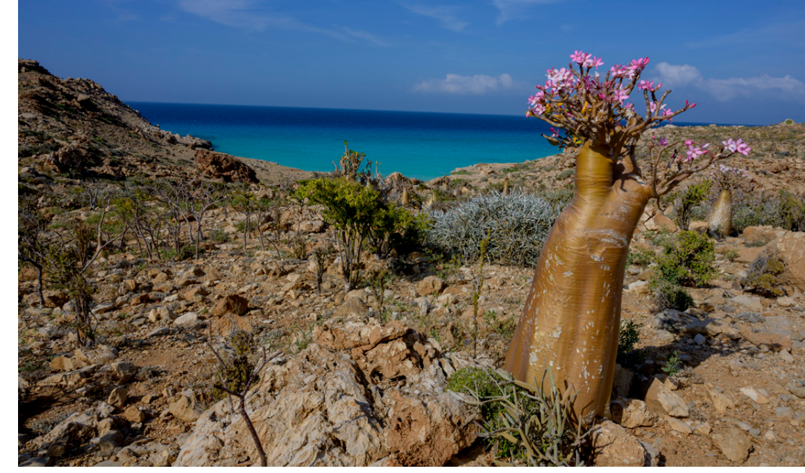
Spectacular plants and landscapes of Socotra

Please email info@birdingafrica.com a copy of your proposed flight details for approval before paying for your tickets.