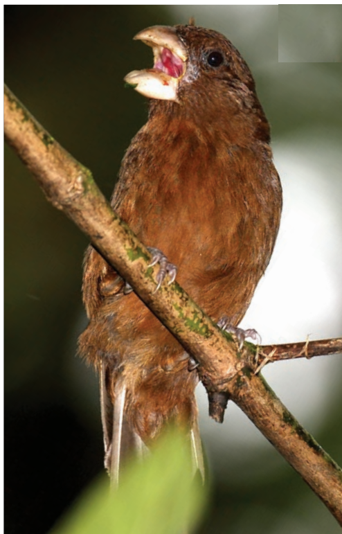
Sao Tome Grosbeak