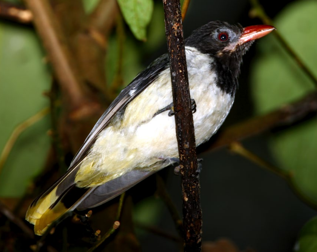
Sao Tome Oriole © Tasso Leventis