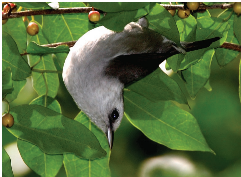
Principe Speirops

Visit www.birdingafrica.com Deposit ($150) by credit card Email info@birdingafrica.com