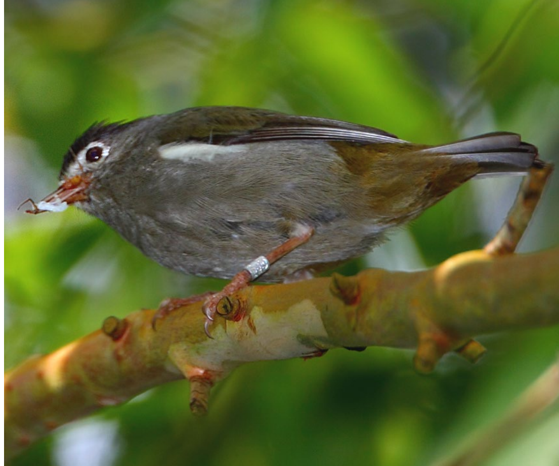
Sao Tome Speirops

Today we hike into the remote forest of southern São Tomé. This is the best area on the island for the threatened Dwarf Olive Ibis, and other key birds we hope to see include Sao Tome Scops Owl, Sao Tome Short-tail and Giant Sunbird. There is also a chance to see the very rare Sao Tome Grosbeak and Sao Tome Fiscal. Overnight camping in the forest.