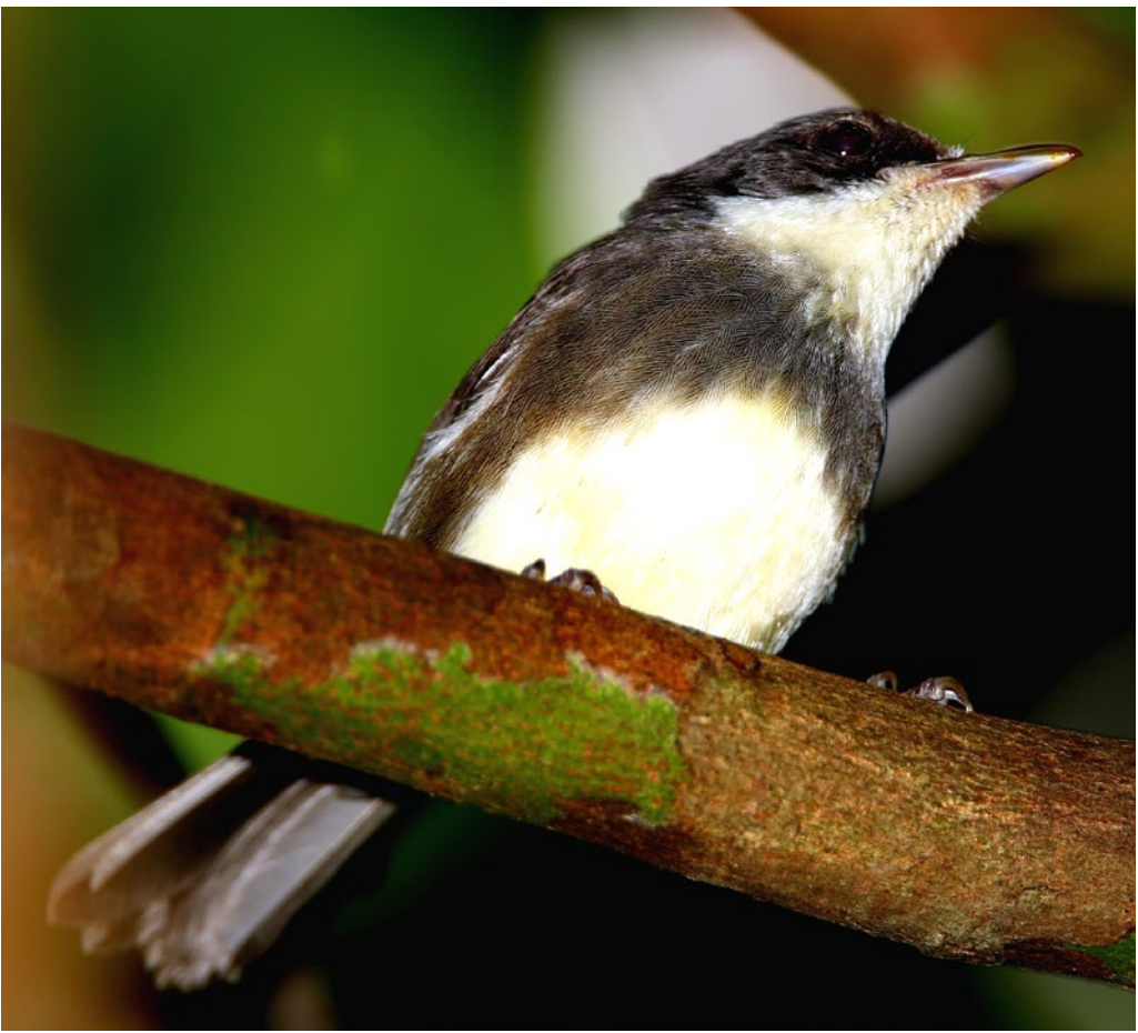
Dohrn's Thrush Babbler © Tasso Leventis