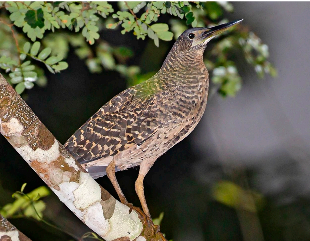
White-crested Tiger Heron

After some final birding near Makeni, where we stand a chance for Black-backed Cisticola and Black-faced Quailfinch, we make the shortish drive to Lungi, near Freetown, planning to arrive in the early afternoon. The tour ends on arrival at Lungi International Airport.