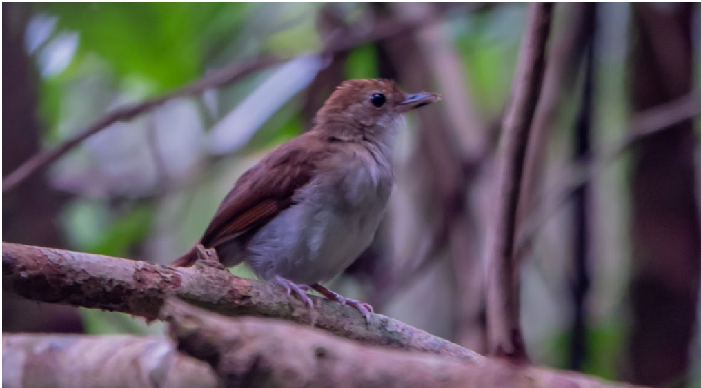
Rufous-winged Illadopsis