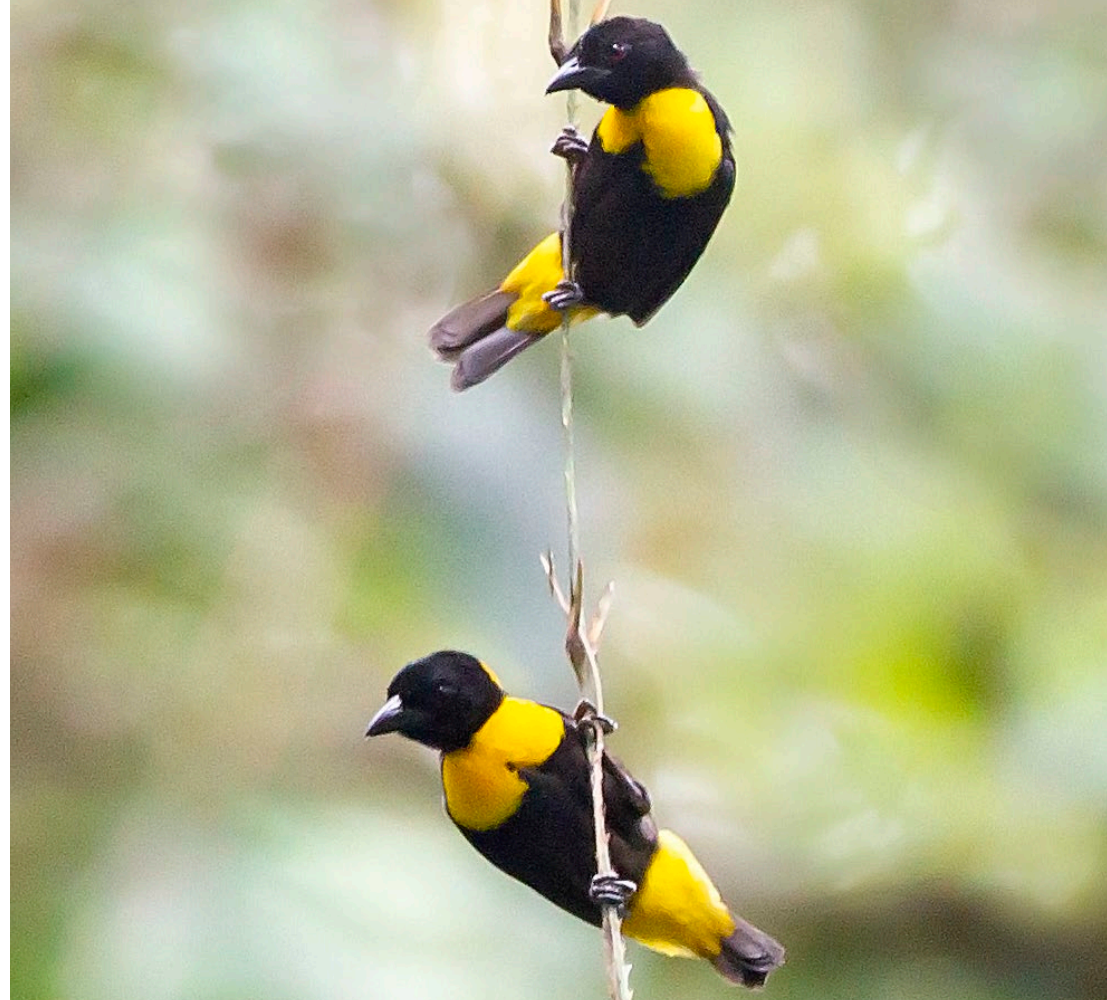
Gola Malimbe

Here too we hope to find Long-billed Pipit, Red-tailed Leaflove, the local race of African Stonechat, Western Square-tailed Drongo and Grey-winged Robin-Chat. Lowland forest and swamps are home to Gola Malimbe, Black-headed Rufous Warbler and Western Yellow-bellied Wattle-eye. A long list of other birds will be on our radars, including Ahanta Francolin, Grey-headed Bristlebill, Square-tailed Saw-wing, Red-shouldered Cuckooshrike,