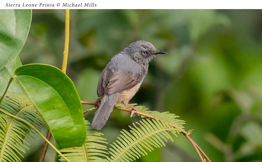
Sierra Leone Prinia

Today is the longest drive of the trip, as we make our way south and west to Sierra Leone. Land border crossing formalities are straight forward and shouldn't take more than 90 minutes. From the border it is a two-hour drive to Tiwai Island. Overnight on Tiwai Island.