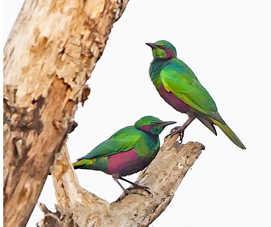
Emerald Starling

While we won't enter the remote primary forest at Gola East, a good array of birds can be found during easy walks. Birds we could find include Lagden's Bushshrike, Green-tailed Bristlebill, Western Yellow-bellied Wattle-eye, Narina Torgon, Latham's Forest Francolin, Puvel's Illadopsis, Grey-hooded Capuching Babbler, Yellow-billed Turaco, Long-tailed Hawk, Western Piping Hornbill, Brown-cheeked Hornbill, Yellow-casqued Hornbill, Timneh Parrot, Rufous-winged Illadopsis, Pale-breasted Illadopsis and Copper-tailed Starling. There is a Yellow-headed Picathartes colony an hours' walk away from our accommodation, which we will also visit during an evening, although birds