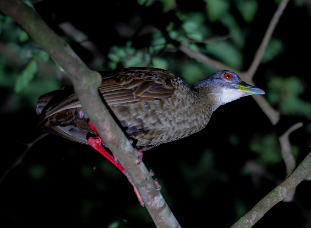
Nkulengu Rail