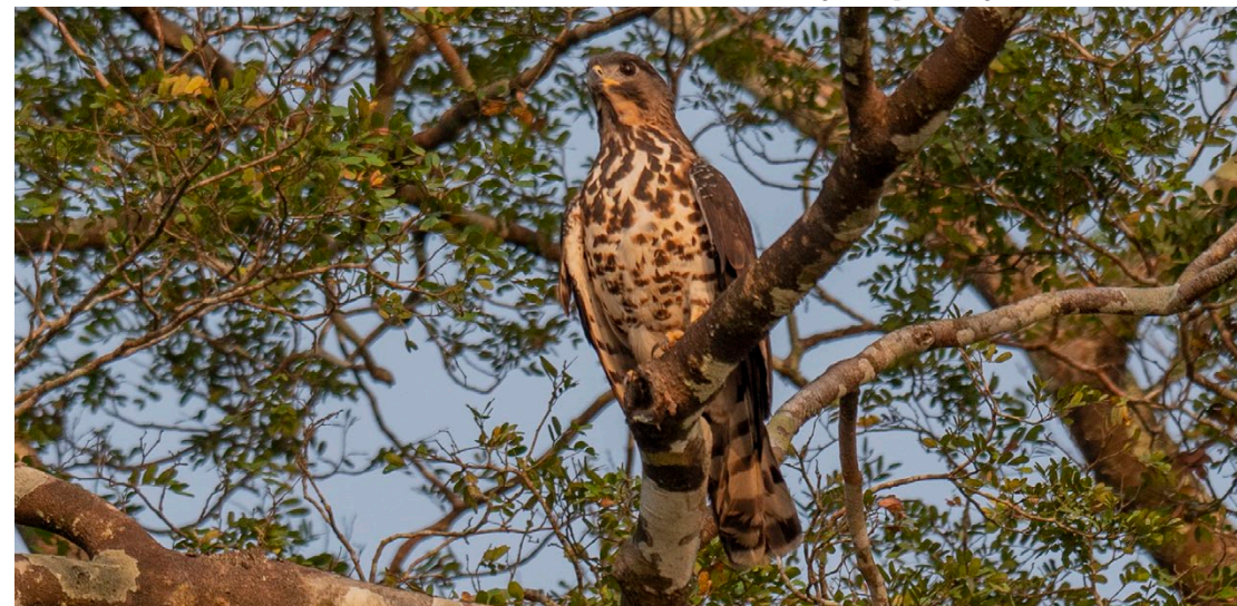
Congo Serpent Eagle

One of the challenges of birding the region is the generally poor infrastructure and bad roads, necessitating long drives on bumpy roads and long hikes combined with camping. We have researched and explored the area to find the most comfortable way of seeing these birds, offering a tour that brings access to the region in a significantly more comfortable way, suitable to a wider range of travellers and bird enthusiasts. Although some of the Upper Guinea endemics are very rare at sites visited (White-breasted Guineafowl, Western Wattled Cuckooshrike and Red-fronted Antpecker), we visit sites on this tour at which all Upper Guinea endemics have been found.