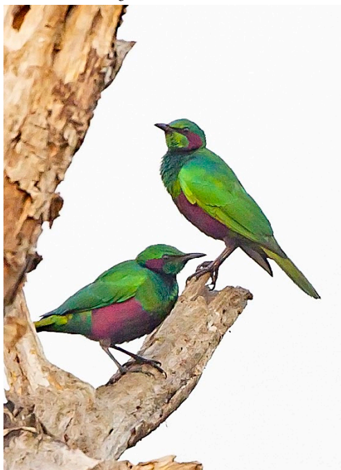
Emerald Starling

Visit www.birdingafrica.com Deposit ($150) by credit card Email info@birdingafrica.com