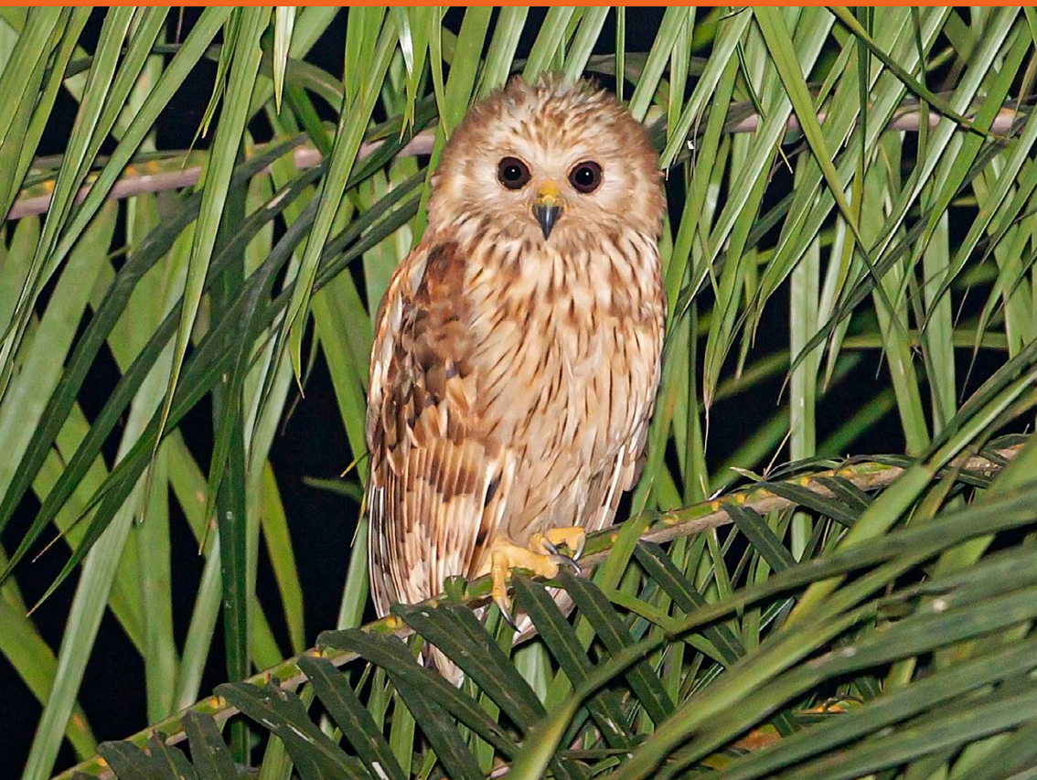
Rufous Fishing Owl