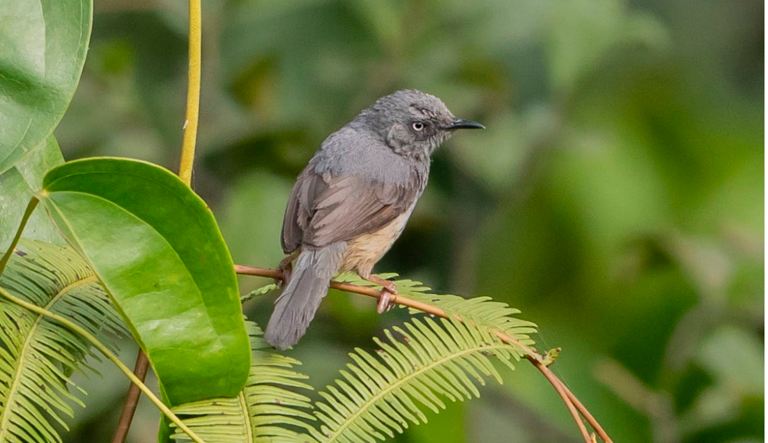
Sierra Leone Prinia

Here too we hope to find Long-billed Pipit, Redtailed Leaflove, the local race of African Stonechat, Western Square-tailed Drongo and Grey-winged Robin-Chat. Lowland forest and swamps are home to Gola Malimbe, Black-headed Rufous Warbler and Western Yellow-bellied Wattle-eye. A long list of other birds will be on our radars, including Ahanta Francolin, Grey-headed Bristlebill, Squaretailed Saw-wing, Red-shouldered Cuckooshrike,