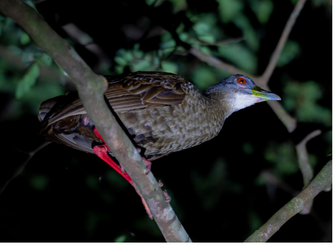
Nkulengu Rail