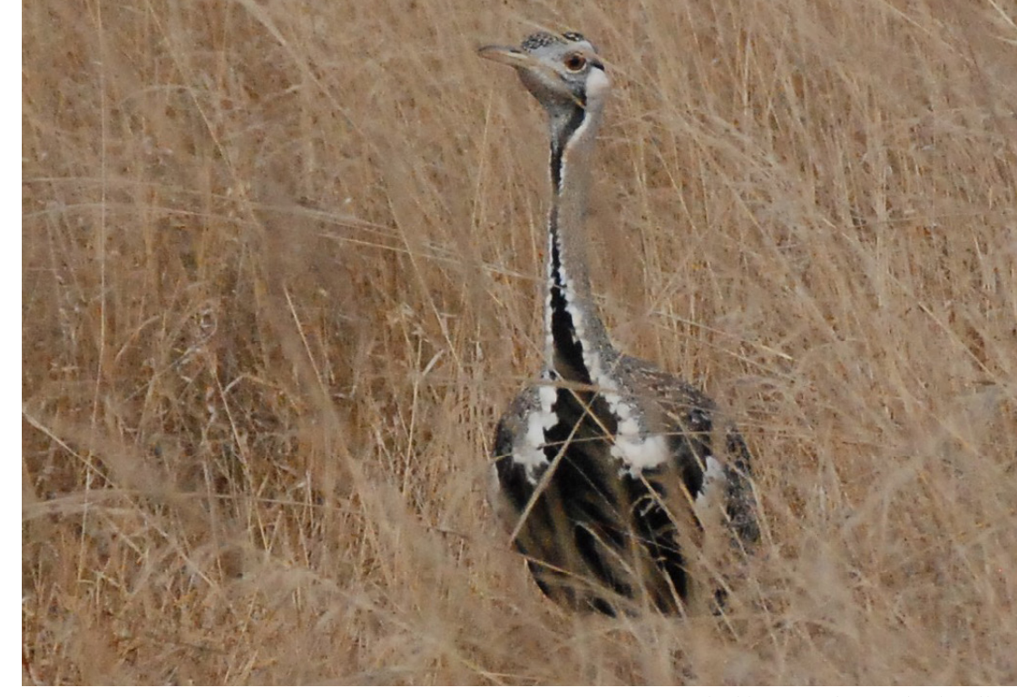
Hartlaub's Bustard

Fischer's Greenbul, Little Yellow Flycatcher, East Coast Akalat, Chestnut-fronted Helmetshrike, Scaly Babbler, Kenya Crested Guineafowl, Fischer's Turaco, Red-tailed Ant Thrush, Pallid Honeyguide, Little Spotted Woodpecker, Mombasa Woodpecker, Plainbacked Sunbird, Forest Batis and Southern Banded Snake Eagle. Open areas around the forest hold Malindi Pipit, Zanzibar Red Bishop, Coastal Cisticola and Golden Palm Weaver, and there is an outside chance for Violet-breasted Sunbird. Nights at Watamu.