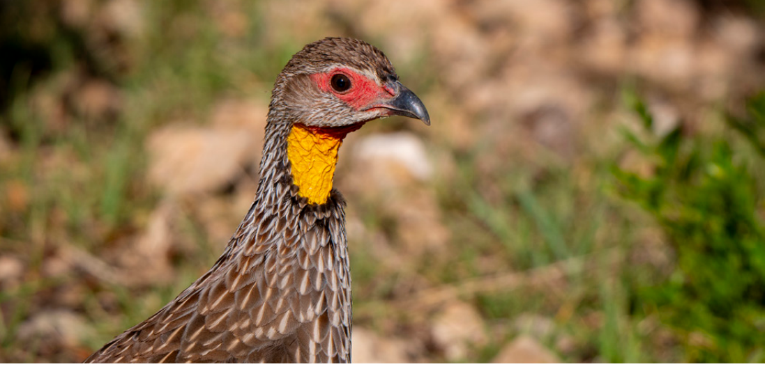
Yellow-necked Spurfowl @ Michael Mills