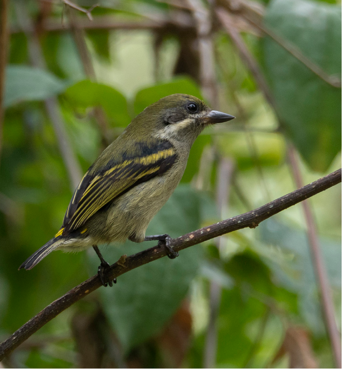
Moustached Green Tinkerbird