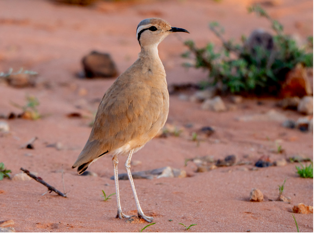
Somali Courser © Michael Mills