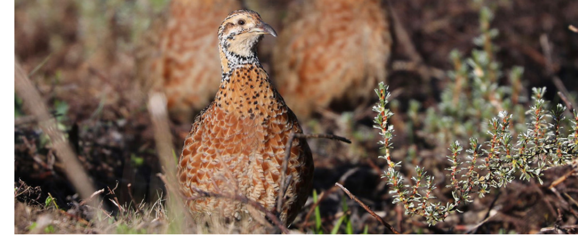
Elgon Francolin