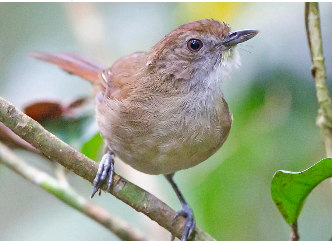
Pale-breasted Illadopsis

We spend a second morning on the Kakum canopy tower, before making our way to far western Ghana. As we approach Ankasa we will stop for some wetland birding, which may produce Mangrove Brown Sunbird, White-browed Forest Flycatcher and Hartlaub's Duck. Overnight at Anaksa.