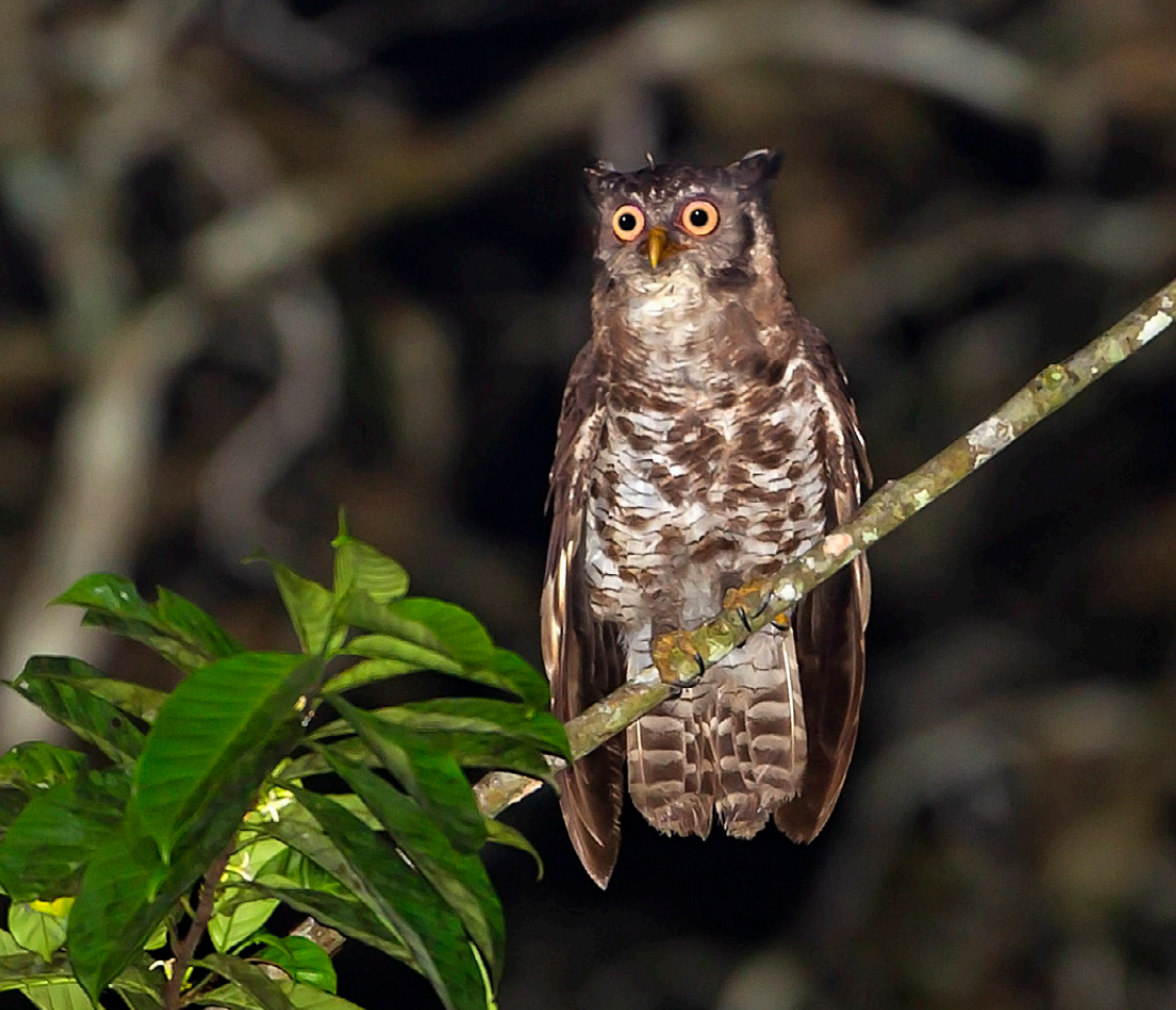
Akun Eagle-Owl