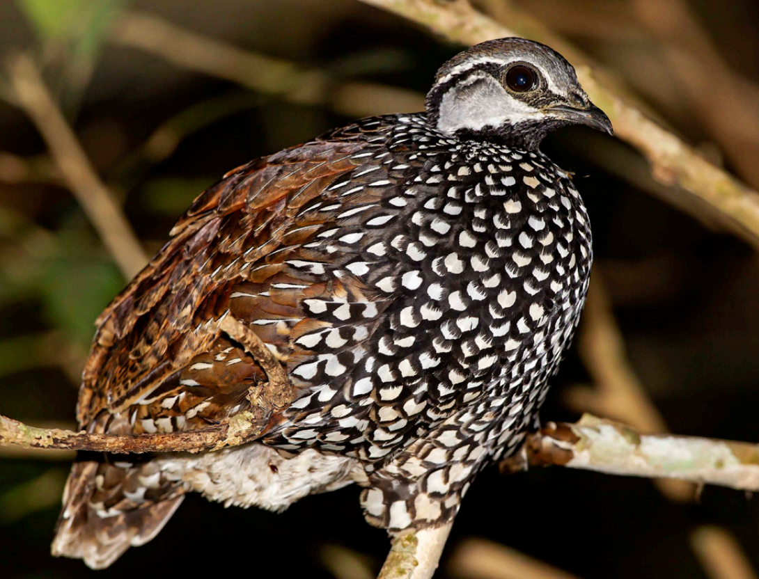
Latham's Forest Francolin