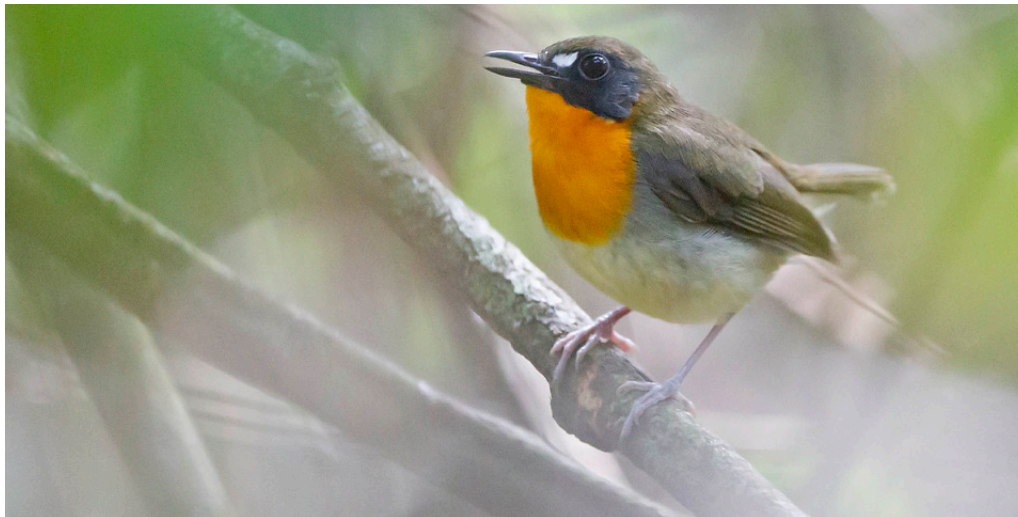
Western Forest Robin