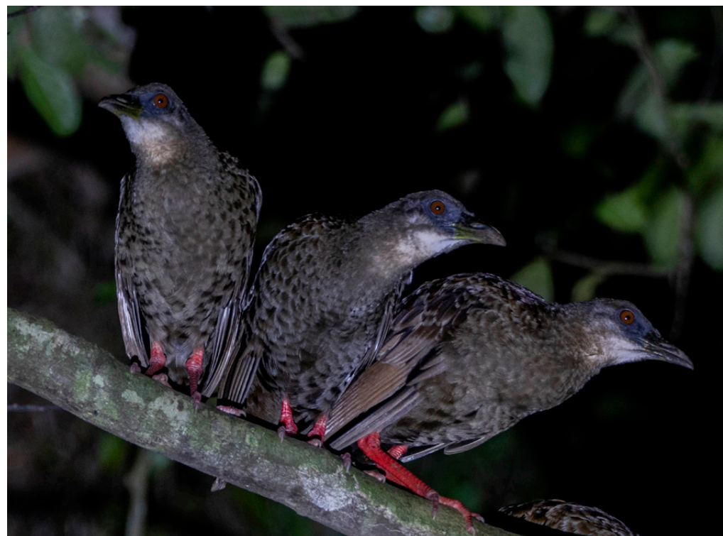
Nkulengu Rail

Visit www.birdingafrica.com Deposit ($150) by credit card Email info@birdingafrica.com