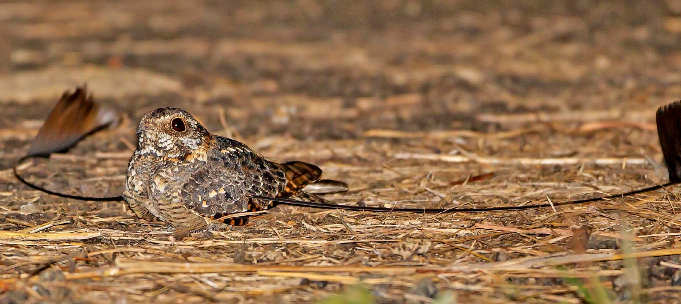
Standard-winged Nightjar