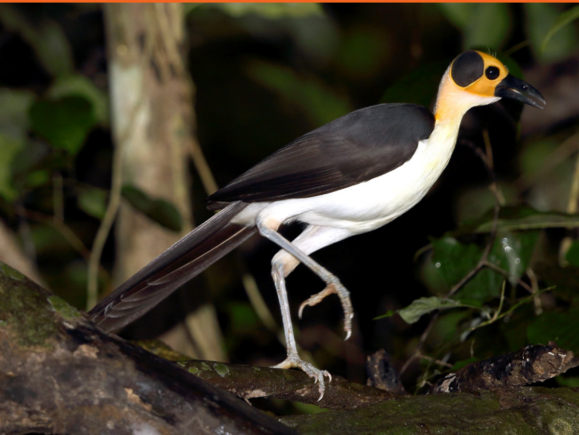
Yellow-headed Picathartes