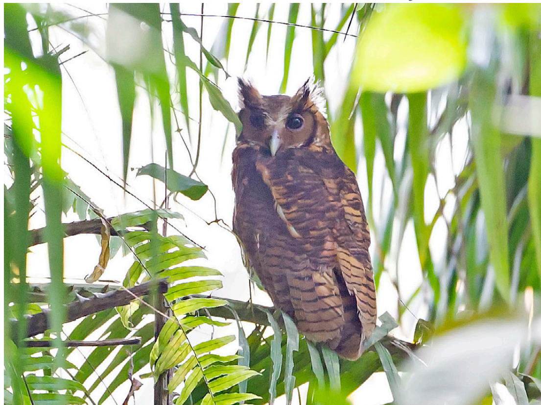
Fraser's Eagle-Owl

This morning we'll bird the rich lowland forests to the east of Kumasi at Bobiri Butterfly Sanctuary. A wide range of sought after species occur here, including Forest Wood Hoopoe, Lagden's Bushshrike (very rare), Black Spinetail, Narina Trogon, Least Honeyguide, Little Green Woodpecker, Red-fronted Parrot, Red-billed Helmetshrike, Sabine's Puffback, Purple-throated Cuckooshrike, Blue-headed Crested Flycatcher, Dusky Tit, Copper-tailed Glossy Starling, Yellow-mantled Weaver, Maxwell's Black Weaver and Red-vented Malimbe. Overnight at Kumasi.