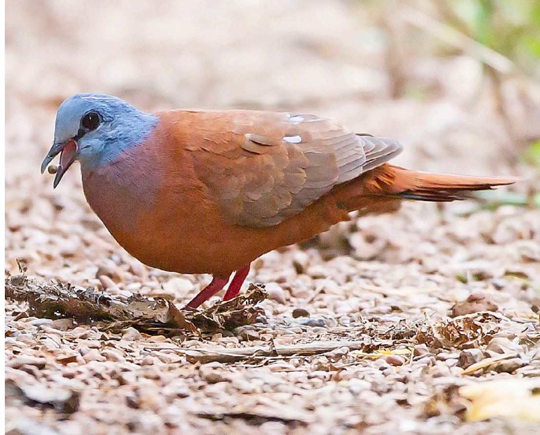
Blue-headed Wood Dove

Targets include Congo Serpent Eagle, Fire-bellied Woodpecker, Buff-throated Sunbird, Red-chested Goshawk, Blue-headed Wood Dove, Black-throated Coucal, Forest Francolin, Fraser's Eagle-Owl, Brown Nightjar, Black Spinetail, Chocolate-backed Kingfisher, Black Bee-eater, Rosy Bee-eater, Forest Wood Hoopoe, Red-billed Dwarf Hornbill,