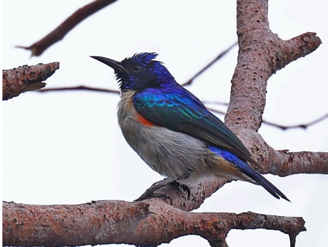
Violet-tailed Sunbird © Paul Noakes