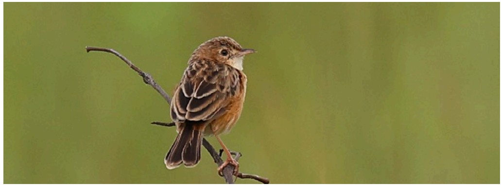
Dambo Cisticola © Paul Noakes