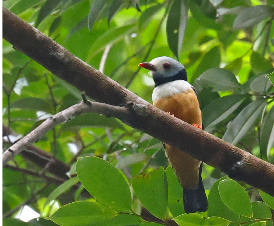
Rufous-bellied Helmetshrike

Bee-eater, Rufous-naped Lark (the subspecies here called Malbrant's Lark), Flappet Lark, Banded Martin, Dambo Cisticola (rare), Sooty Chat, Yellow-mantled Widowbird, Fawn-breasted Waxbill, Locust Finch (rare) and Long-legged Pipit.