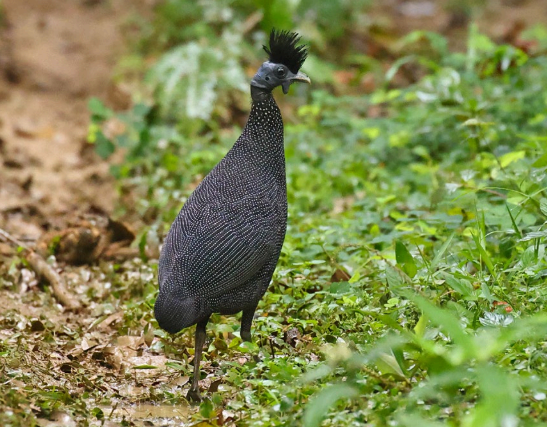
Plumed Guineafowl