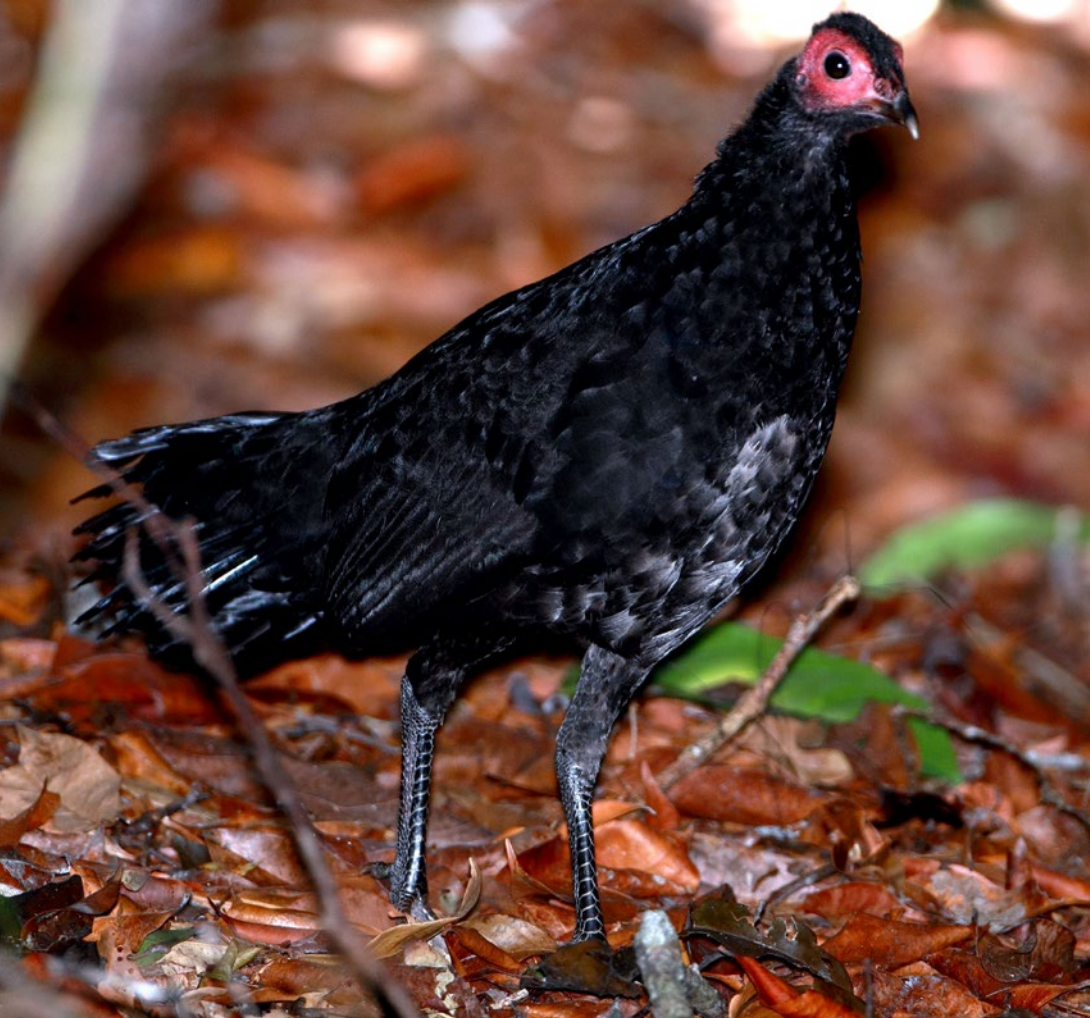
Black Guinea fowl © Tasso Leventis