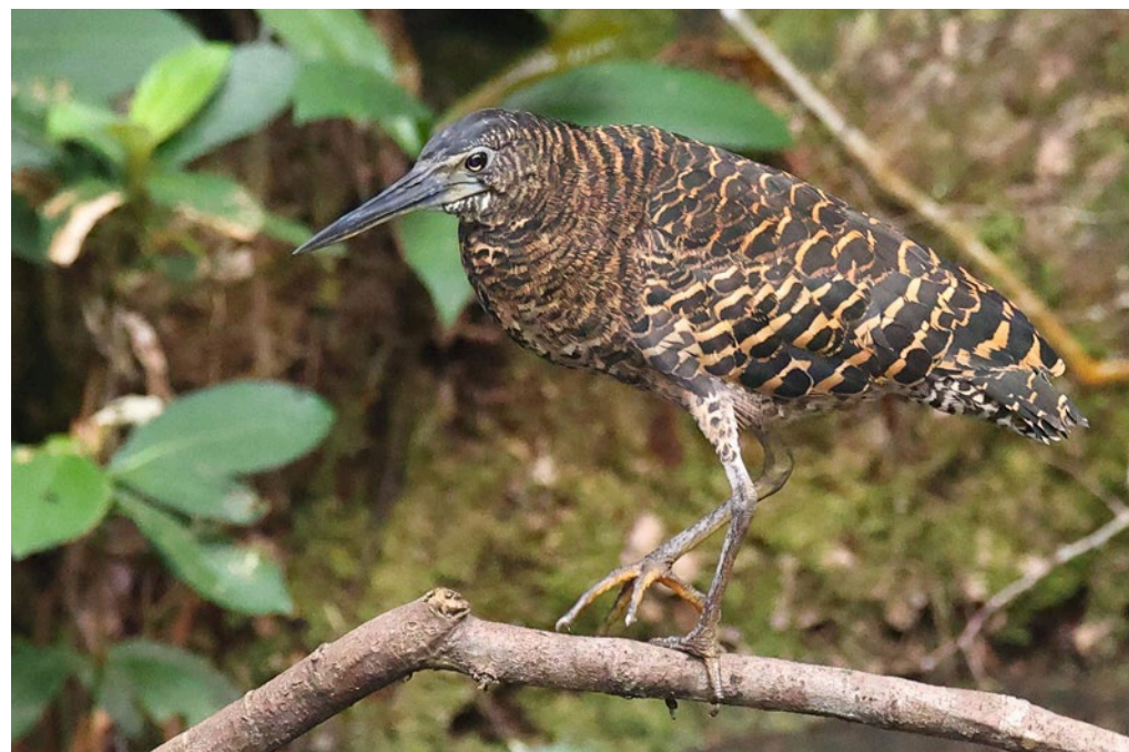
White-crested Tiger Heron

Visit www.birdingafrica.com Deposit ($150) by credit card Email info@birdingafrica.com