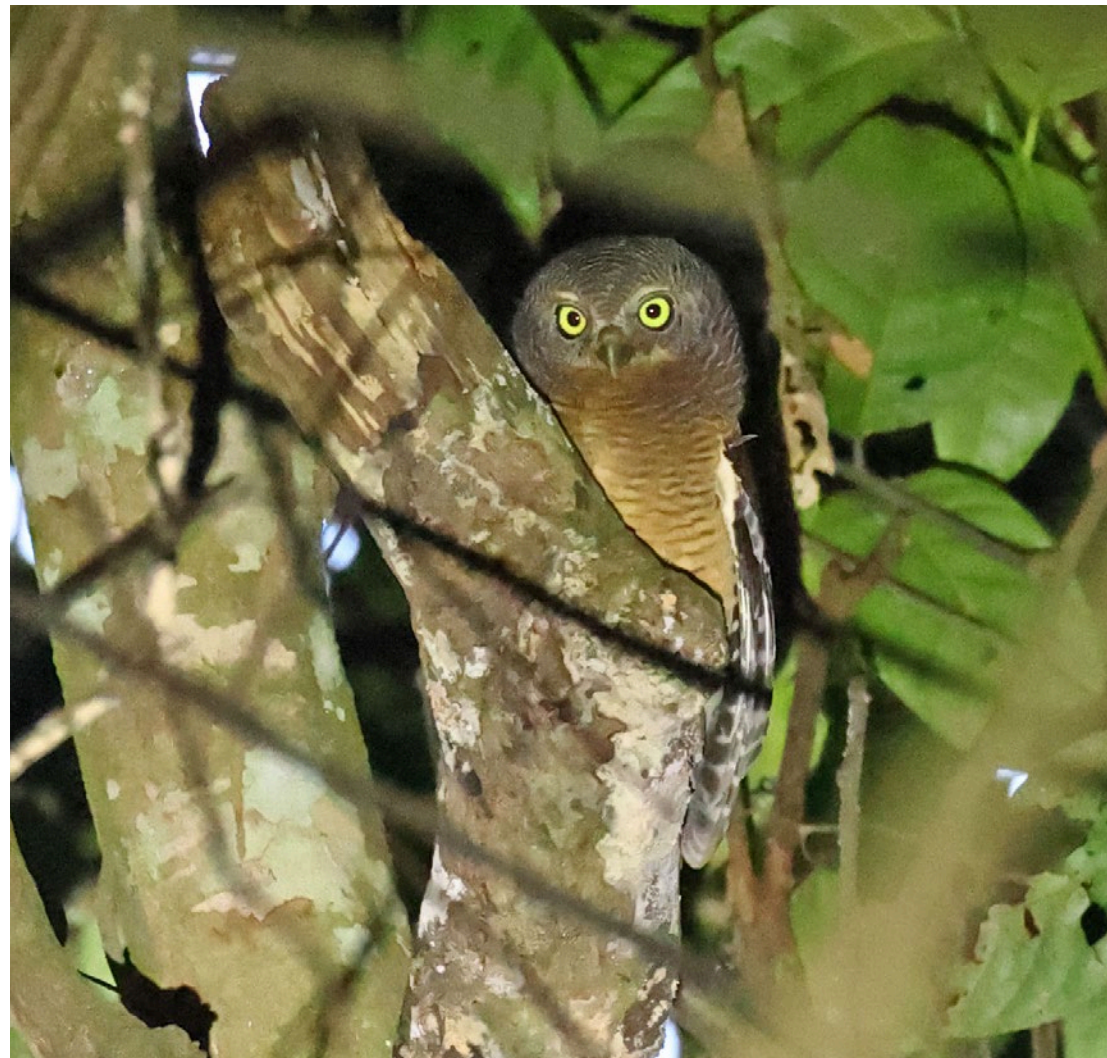
Sjöstedt's Barred Owllet © Paul Noakes

After some final birding at Ipassa we'll drive back to Booué and then take the train to Lope, where we expect to arrive around midnight. We'll immediately transfer to our comfortable lodge, 5 minutes away by car. Overnight on the edge of Lope.