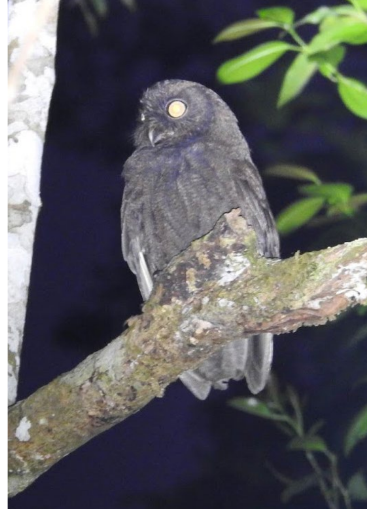
Anjouan Scops Owl

Leaving Anjouan by air we'll touch down on the nearby island of Mayotte, much more developed than the other Comoros islands and politically part of France. A short drive will bring us to our accommodation in the central highlands, surrounded by forest where Mayotte Scops Owl, Mayotte Drongo, Mayotte Sunbird and Mayotte White-eye are found. Frances's Sparrowhawk