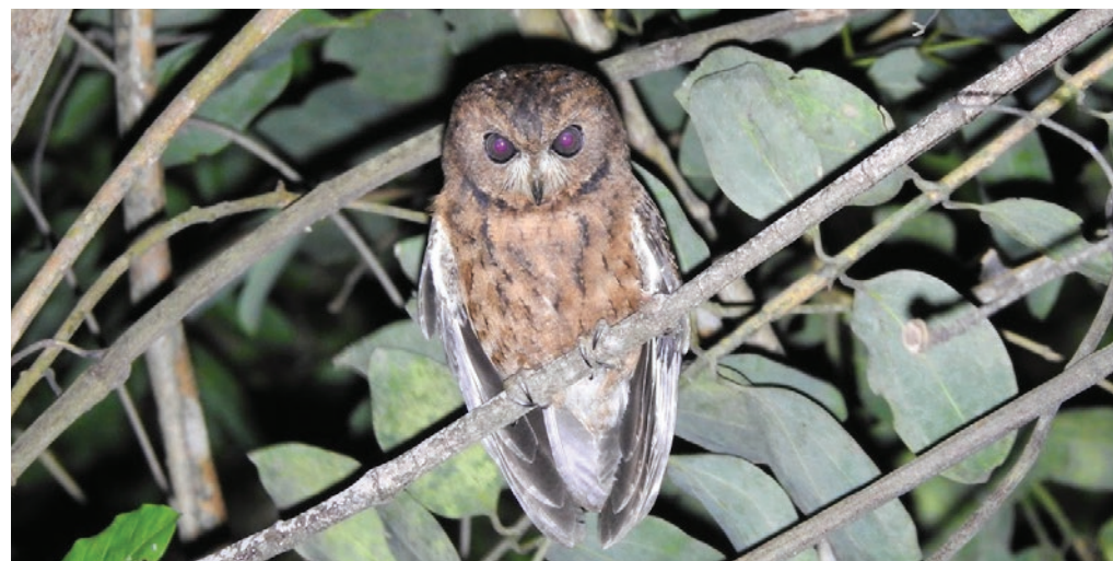
Moheli Scops Owl © Michael Mills

Visit www.birdingafrica.com Deposit ($150) by credit card Email info@birdingafrica.com