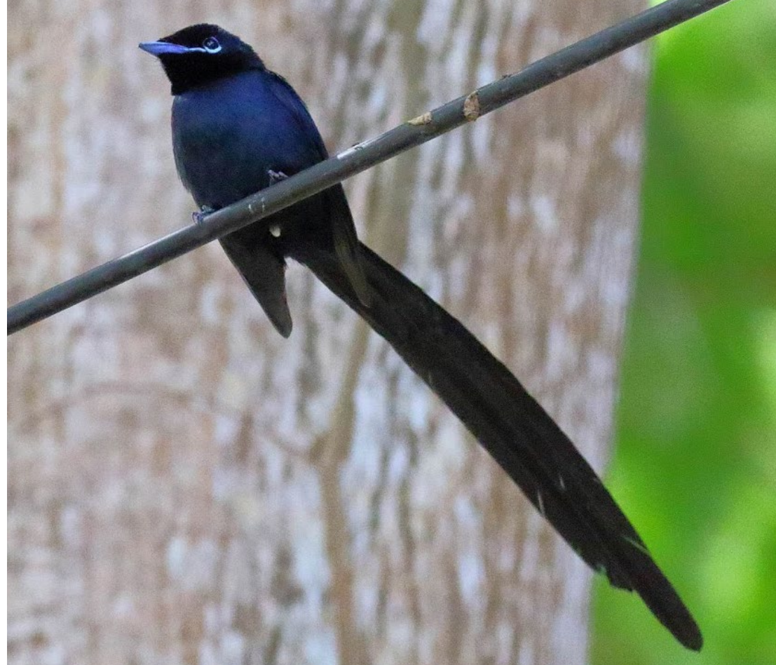
Seychelles Paradise Flycatcher

morning outing to forests of the central highlands should allow us to find Seychelles Black Parrot. Later in the morning we'll take a boat trip to nearby Cousin Island, where impressive numbers of Lesser Noddy, Brown Noddy and White Tern breed, and Seychelles Magpie-Robin, Seychelles Fody and Seychelles Warbler can usually be found with ease. In the afternoon we'll visit the adjacent Island of La Digue where the striking Seychelles Paradise Flycatcher is found. Night on Praslin Island.