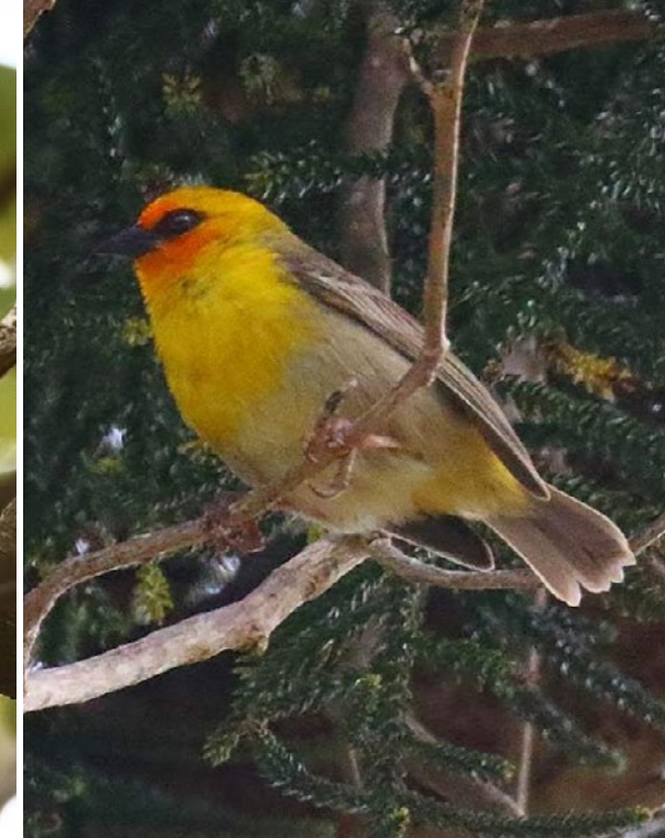
Mauritius Kestrel (left) and Rodrigues Fody (right)