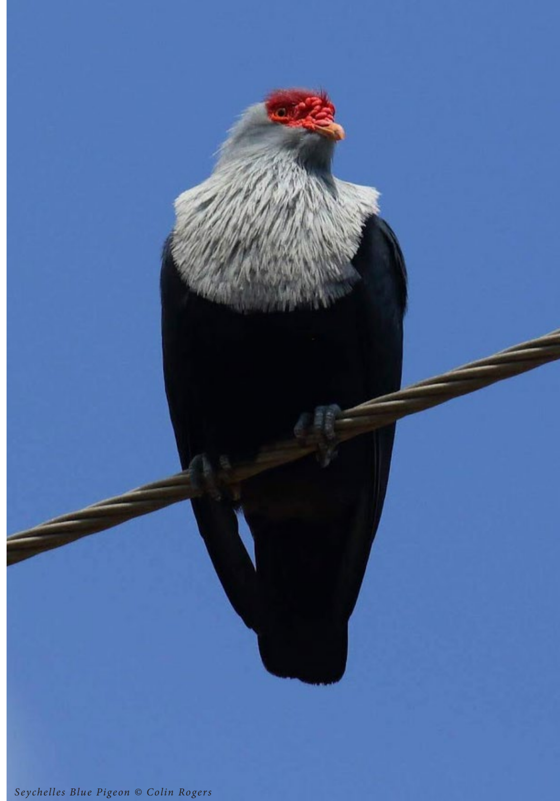
Seychelles Blue Pigeon