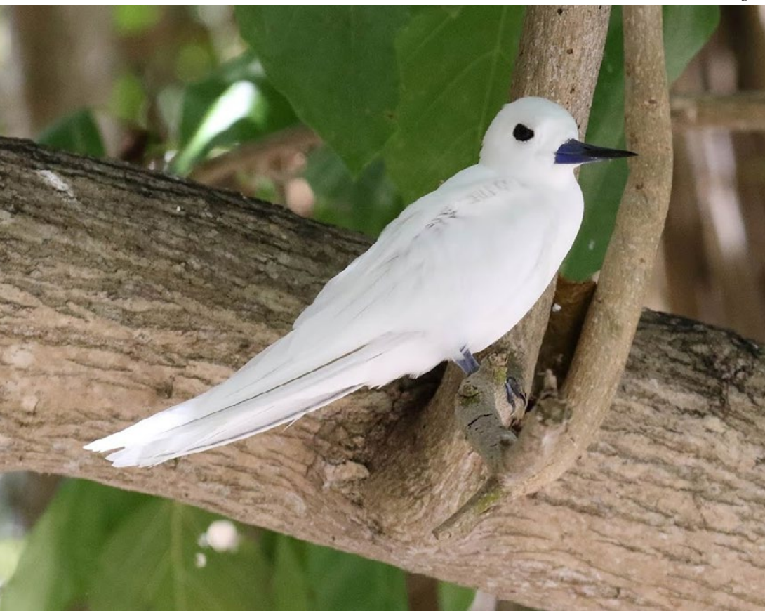
White Tern © Colin Rogers