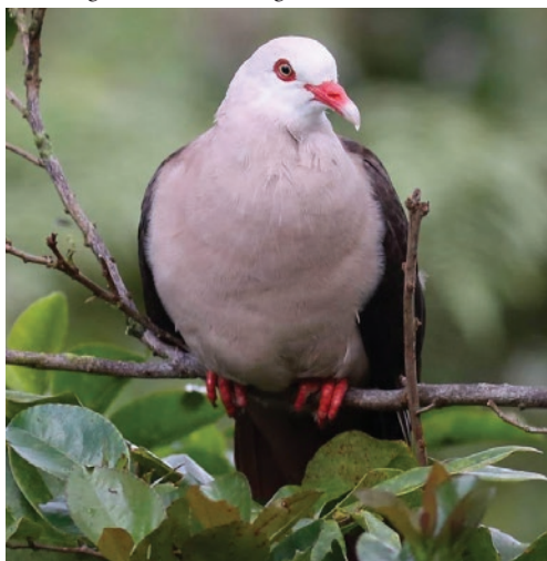
Pink Pigeon