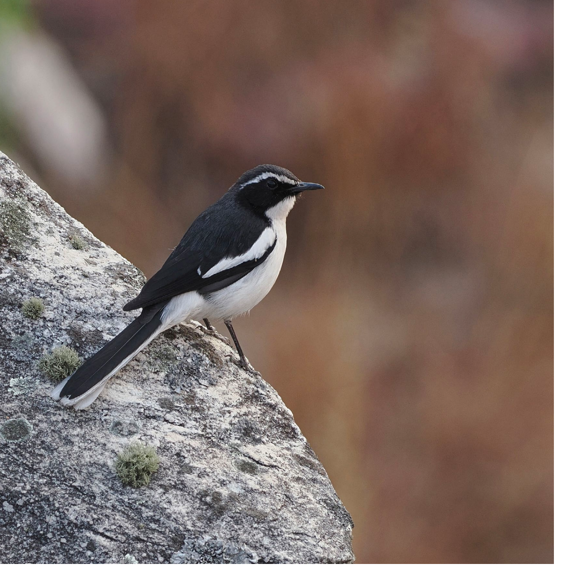
Angola Cave Chat

Next on our agenda came Lubango, where we spent a day along the spectacular southern escarpment at Tundavala. Here, montane grasslands and remnant patches of Afromontane forest produced some of the best birding of the trip in impressive surrounds. Swierstra's Francolin was seen well, after a little effort, with a smart male sitting out on a rock. Rocky areas were home to Angola Cave Chat, Short-toed Rock Thrush, and other goodies included Buffy