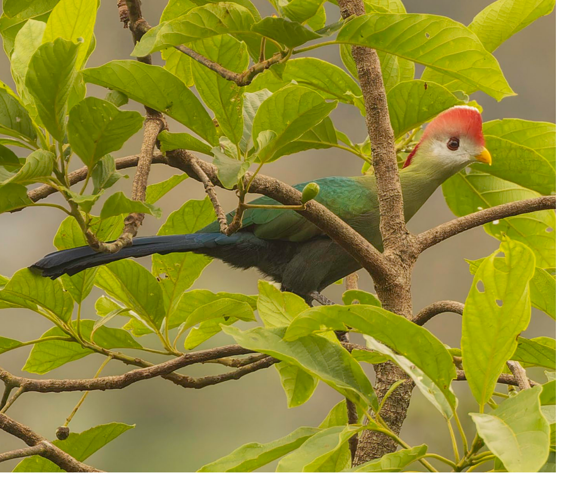
Red-crested Turaco

From the northern-most point of the trip, near Uíge, we turned south-eastwards to the Kalandula Falls area with its broad-leafed woodlands and gallery forests. En route we paused at Lucala to admire Rock Pratincole.