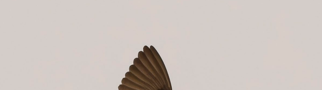
Black-necked Eremomela and Bocage's Sunbird