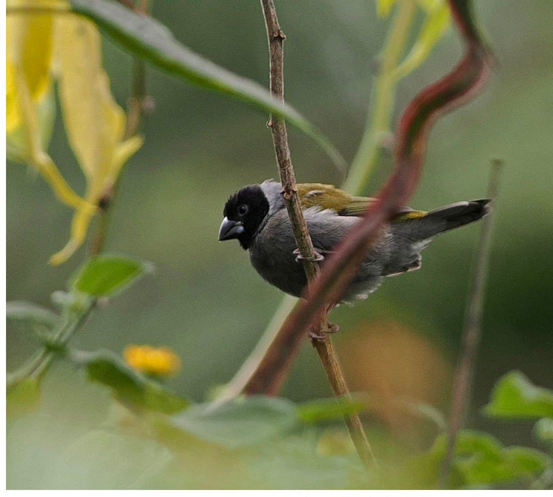
White-collared Oliveback

During the following day-and-a-half we visited various sites along the northern escarpment of Uíge province, amassing an impressive list of species. Highlights included more views of Braun's Bushshrike, perched Forest Swallow, tracking down the difficult Angolan White-throated Greenbul, Brownbacked Scrub Robin, Western Black-headed Batis, and prolonged views of White-collared Oliveback. Ample backup was provided by more common and widespread birds such as Eastern Piping Hornbill, Congo Pied Hornbill, Hairy-breasted Barbet, Speckled Tinkerbird, Great Blue Turaco, Guinea Turaco, Forest Chestnut-winged Starling, Yellow-mantled Weaver, Yellow-browed