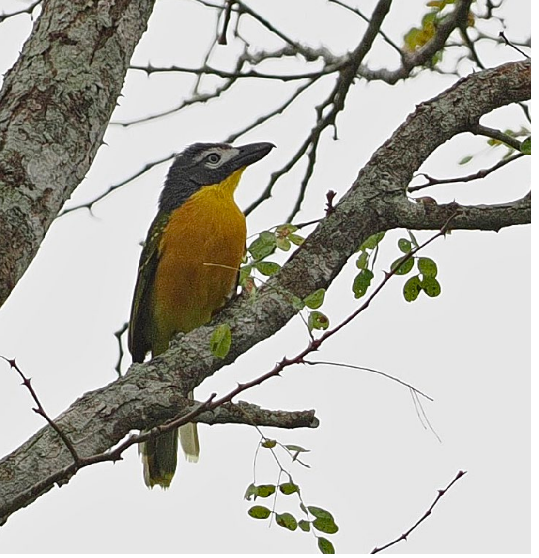
Monteiro's Bushshrike

The central escarpment (focussed on Kumbira) is arguably the highest priority for conservation in Angola, but is also one of the most rapidly disappearing areas of habitat due to slash-and-burn cultivation. Some of the rarer endemics cling to the last uncleared patches of suitable habitat. We wasted no time in commencing our birding at Kumbira, where on our first afternoon we found a trio of Endangered endemics