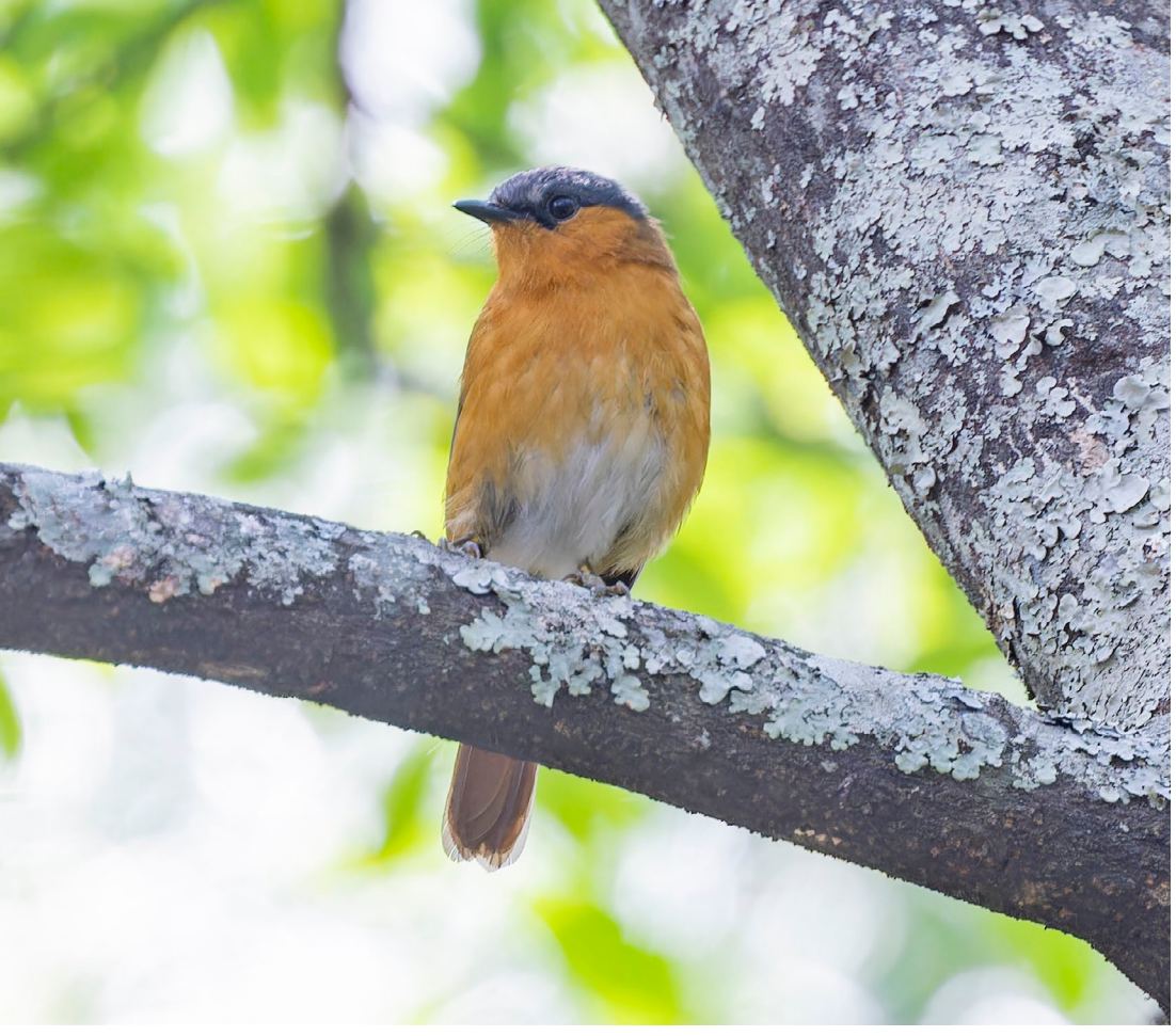
Bocage's Akalat

crowned Canary, and, best of all, Finsch's Francolin.