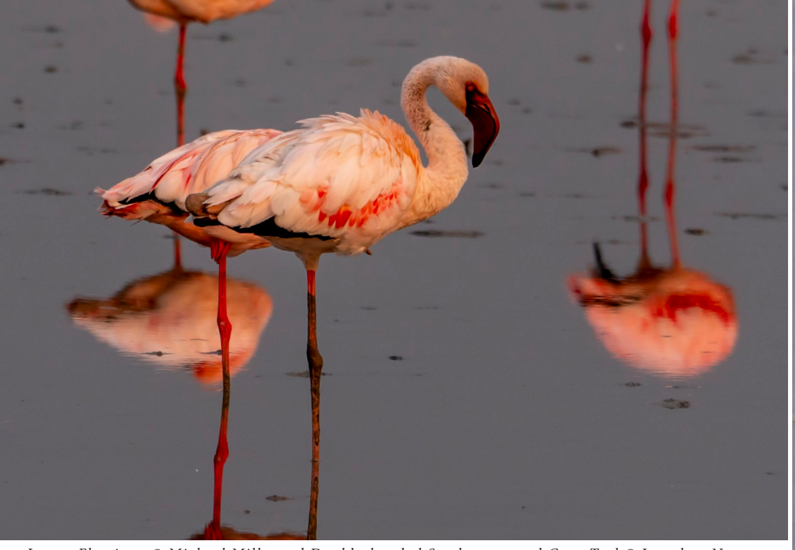
Lesser Flamingo, and Double-banded Sandgrouse and Cape Teal